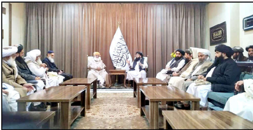
KABUL: Ameer Jamiat-e-Ulema Islam (JUI) Maulana Fazlur Rehman along with delegation meeting with Vice Afghanistan Prime Minister Maulvi Abdul Kabeer.

The reason behind the widespread disruption is yet not clear as the Pakistan Telecommunication Authority (PTA) has not issued any statement.