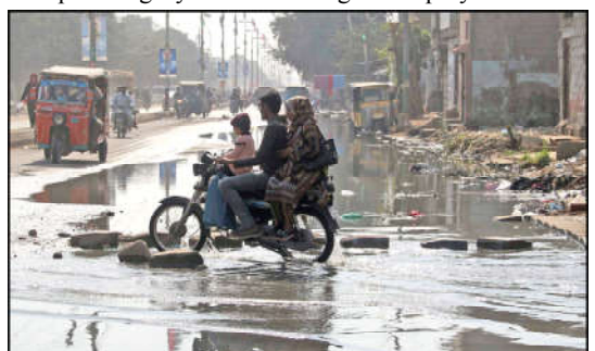
KARACHI: People facing difficulties due to accumulated sewerage water main road of New Karachi area as needs to attention for concern authority in Provincial Capital.

can't give peace to our city. He demanded that recruitment in police from top to bottom should only be made on merit, without any political influence. He said in fact all government vacancies should be filled through the public service commission. He said for giving a push to the economy it is necessary to boost industry, but it can't be done without peace and security. He said crime is on the rise in Karachi and the traders and industrialists are either closing down their businesses and industries or shifting them to other cities. He said no one is ready to invest in Karachi and if this situation continued the megacity would face a serious economic crisis and huge unemployment.