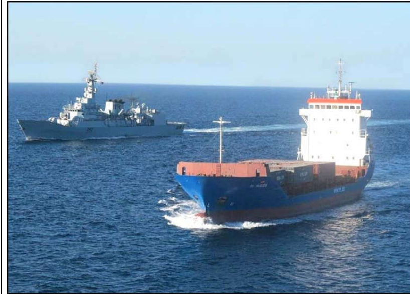
Pakistan Navy Ship escorting merchant vessel in Arabian Sea

Islamabad has stated that the TTP and other groups use Afghan soil against Pakistan — a claim denied by Afghan Taliban government.