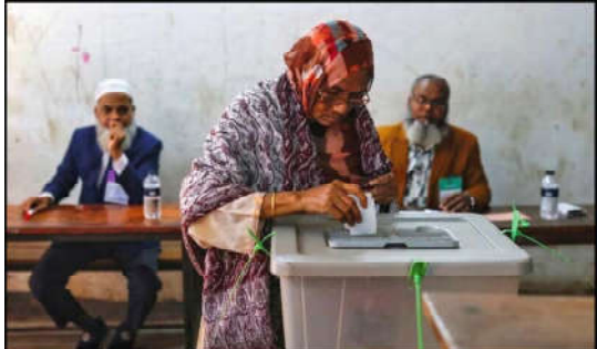
An elderly woman puts ballot paper inside a ballot box after casting her vote in the morning during the 12th general election in Dhaka, Bangladesh.

livered about 218 of the 737 Max planes worldwide, the company told AFP. US-based Alaska Airlines grounded all 65 of its Boeing 737 Max 9 jets on Friday after a flight carrying 171 passengers and six crew was forced to make an emergency landing. The National Transportation Safety Board (NTSB) said a sealed-over door panel had opened and come off mid-flight. Alaska Flight 1282 had departed from Portland International Airport and was still gaining altitude when the cabin crew reported a "pressurisation issue", according to the FAA. The plane quickly returned to Portland and there were no major injuries. Images posted on social media showed a side panel of the plane blown out, with emergency oxygen masks hanging from the ceiling.