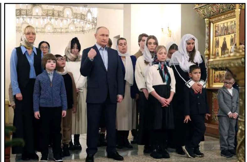
Russia's President Vladimir Putin attends the Orthodox Christmas liturgy at a cathedral on the territory of the Novo-Ogaryovo state residence outside Moscow, Russia.

State television footage showed the Russian leader attending with a small group of families of soldiers killed an intimate midnight service, known as the Divine Liturgy, later on Saturday at a chapel at his residence in Novo-Ogaryovo outside Moscow. There was no call from Putin this year for a ceasefire in Ukraine to coincide with the holiday, which many Orthodox Christians celebrate on Jan. 6-7 - as was the case a year ago.