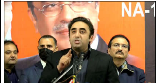
LAHORE: Chairman PPP Bilawal Bhutto Zardari addressing workers convention at NA-127.

Chairman PPP said that they ask us that why we have come to Lahore. We asked them why they had come here.