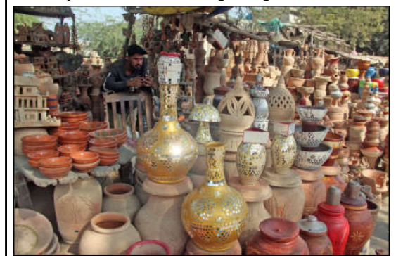
KARACHI: A vendor is displayed fancy plants pots attraction for customers at his roadside setup Kumhar Wara area in Provincial Capital.

Islamabad the team disconnected 98 connections on illegal use of gas and amount of Rs 0.30 million have been booked against gas theft cases. In Multan 25 connections were disconnected on illegal use of gas while another 25 on use of compressor. The team also imposed fine of Rs 0.050 million against gas theft cases. In Peshawar and Karak, the company disconnected 93 connections on account of direct use of gas and illegal use of gas and also imposed fine of Rs 3.05 million against gas theft cases.