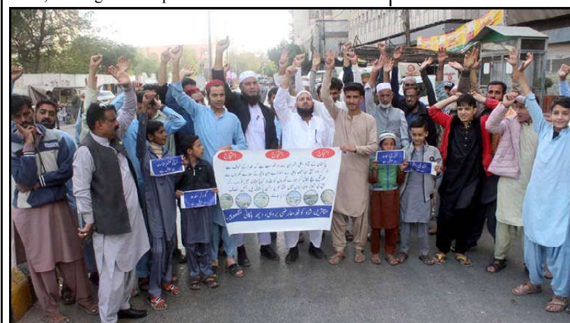
KARACHI: Residents of Manghopir are holding protest demonstration against high handedness of affluent people, at Karachi press club.

including 22.6 million children in Punjab, 10.3 million children in Sindh, 7.5 million children in KP, 2.6 million children in Balochistan, 0.72 million children in AJK, 0.28 million children in GB and 0.42 million children in Islamabad. It will be a 3 days campaign + 2 days catchup in general (in mobile team areas) and 5 days campaign + 2 days catch up in areas implementing the Community Based Vaccination and Special Mobile Team approach.