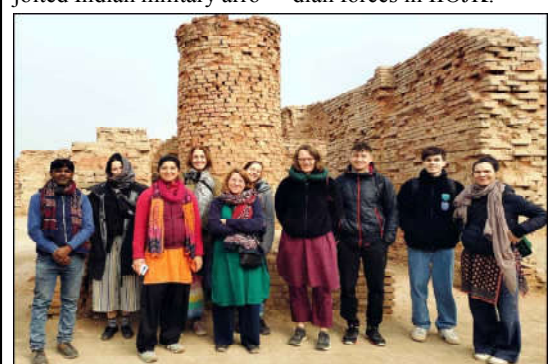
MOHENJO DARO: A tourist delegation from Germany are visiting and expressed keen interest in the historical ruins of the World Heritage Monuments of Mohenjo Daro.

ISLAMABAD (APP): The All Parties Hurriyat Conference (APHC) has expressed serious concern over the continued illegal detention of thousands of Kashmiris, including Hurriyat leaders and activists languishing in different jails in India Illegally Occupied Jammu and Kashmir (IIOJK). According to Kashmir Media Service, the APHC spokesman, in a statement issued in Srinagar, said that the freedom-loving people of Kashmir had been facing the worst type of Indian state terrorism for demanding their inalienable right to self-determination. He said that despite the Indian suppression and repression, the exemplary steadfastness displayed by the people of Kashmir had jolted Indian military arrogance and utterly bulldozed its nefarious designs to break the will of the Kashmiri people. The spokesman, denouncing the confiscation of properties and houses of the people of Kashmir by the Indian Bharatiya Janata Party regime with the help of Indian armed forces, urged the United Nations Human Rights Council and other rights organizations to visit IIOJK and monitor the worst situation where people were being imprisoned in their houses, having no right to talk and walk freely in the territory. He also urged the international community to support the Kashmiris' just struggle for the right to self-determination, help stop the massive human rights abuses perpetrated by Indian forces in IIOJK.