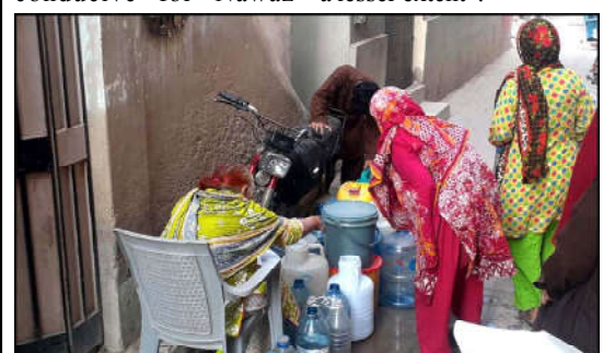
KARACHI: People are filling their water cans from public tap as they facing shortage of drinking water in their area, at Malir area in Karachi.

ISLAMABAD (INP): Senator Mushahid Hussain has advised Nawaz Sharif to become president instead of vying for the prime minister's office. Chairman Senate standing committee for defence Mushahid Hussain was talking to a private television channel in an exclusive interview. "In view of ground realities and knowing Mian Nawaz Sharif, I will tell him to shun the premiership. It will be better for the country and the democracy that he becomes the head of state," Mushahid said. "I don't want him to be expelled from office fourth time. Now it is a hybrid-plus system, not conducive for Nawaz Sharif, as three among six prime ministers have been jailed," he added. "Nawaz Sharif is a king, he makes strong decisions like nuclear and CPEC," Senator Mushahid said. "He has become prime minister of the country thrice, and mother of all deals is that no big distance would remain between the 'elite' and the 'street' any long. This distance should be ended, and I think it will happen," Senator Syed said. Mushahid Hussain Syed said that the Army Chief's US visit was very pleasant, "see those that were more favourites, have now become favourites to a lesser extent".