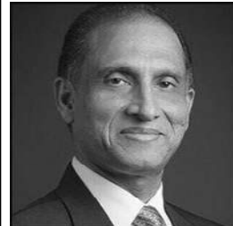
Aizaz Ahmad Chaudhry

Three months into the war in Gaza, thousands of Palestinians, including a large number of children, have been martyred by the Israeli Defence Forces. What is the end goal of Israel for which it has unleashed unprecedented death and destruction? Israel's stated objective is that it wants to destroy Hamas. This is not credible because Israel is meting out genocide-like collective punishment to all Palestinians, and not just Hamas. Is Israel's goal, then, to create a 'greater Israel' by forcibly pushing the Palestinians into neighbouring Arab countries or elsewhere? If that be the objective, Israel has certainly overestimated what its brutal force can achieve, and underestimated the resilience of Palestinians, who seem determined not to leave the land on which their ancestors had lived for millennia.