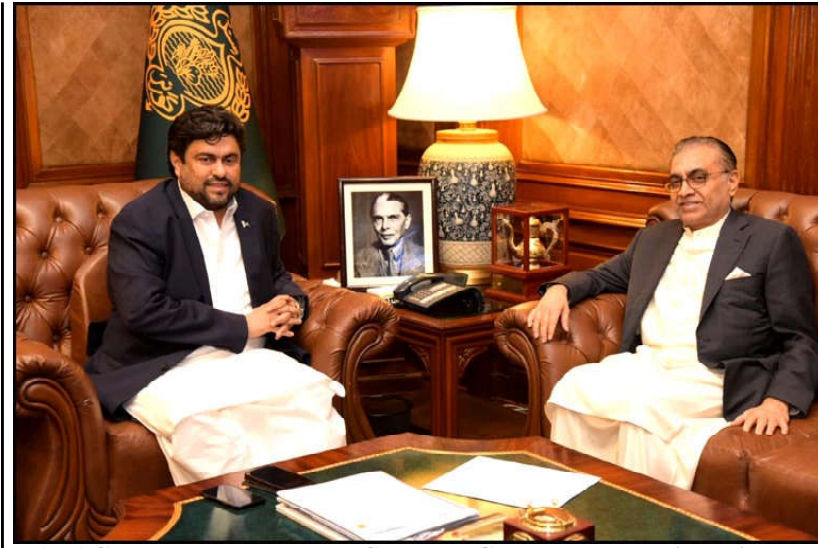
KARACHI: Holland Honorary Consul General Tarek Moinuddin Khan meeting with Sindh Governor Kamran Khan Tessori at governor house.

During the protests, the miscreants targeted the civil and military installations including — Jinnah House and the General Headquarters (GHQ) in Rawalpindi. The military termed May 9 "Black Day" and decided to try the protesters under the Army Act.