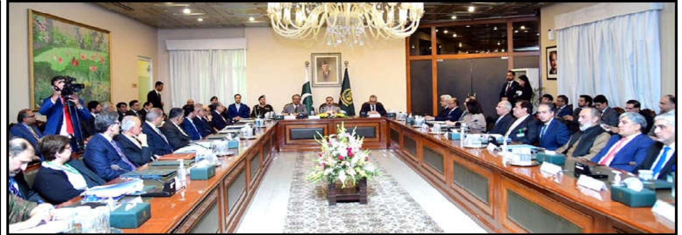
ISLAMABAD: Caretaker Prime Minister Anwaar-ul-Haq Kakar addresses the Envoys' Conference.