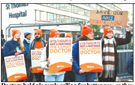
Doctors hold placards calling for better pay, as they stand on a picket line outside London's St Thomas Hospital on the first day of strike action.

Monitoring Desk TOKYO: Three men were injured on Wednesday in a stabbing incident and taken to hospital after a woman wielded a knife on a train at Akihabara Station in Tokyo, Japanese police said. The police received an emergency call at just before 11 pm local time (1400 GMT) saying the woman had inflicted injuries with a knife on the Yamanote loop line, one of the busiest transport routes in the city.