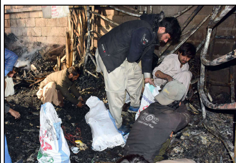
ISLAMABAD: A view of the destructive shops after burnt fire at Timber Market of I-11 in Federal Capital.