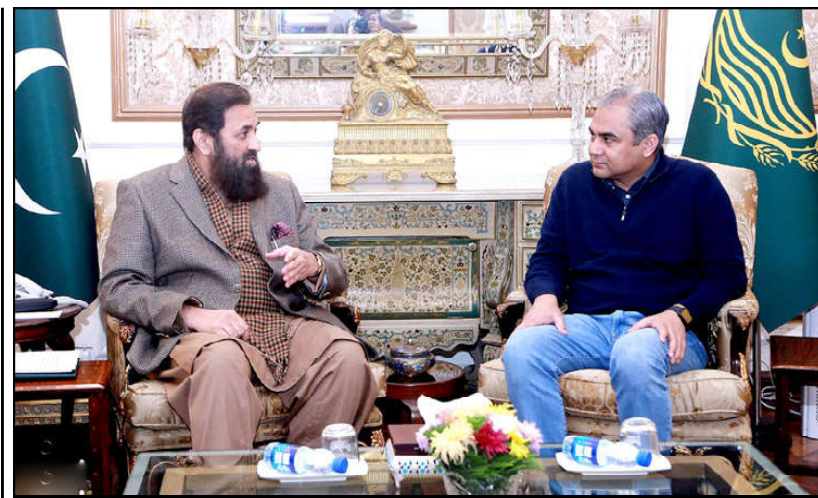
LAHORE: Caretaker Chief Minister Punjab Mohsin Naqvi in a meeting with Punjab Governor Muhammad Baligh-ur-Rehman.

was "up to two years or with fine, or both" it was increased to "up to three years and shall also be liable to fine up to two hundred thousand rupees. In default of payment of fine additional imprisonment for three months." In schedule II, "may be arrested without warrant "non-bailable" has also been added. With regard to Section 148 the existing punishment was "up to three years or with fine, or both" has been replaced by "up to five years and shall also be liable to fine up to five hundred thousand rupees, which shall not be less than one hundred thousand rupees."