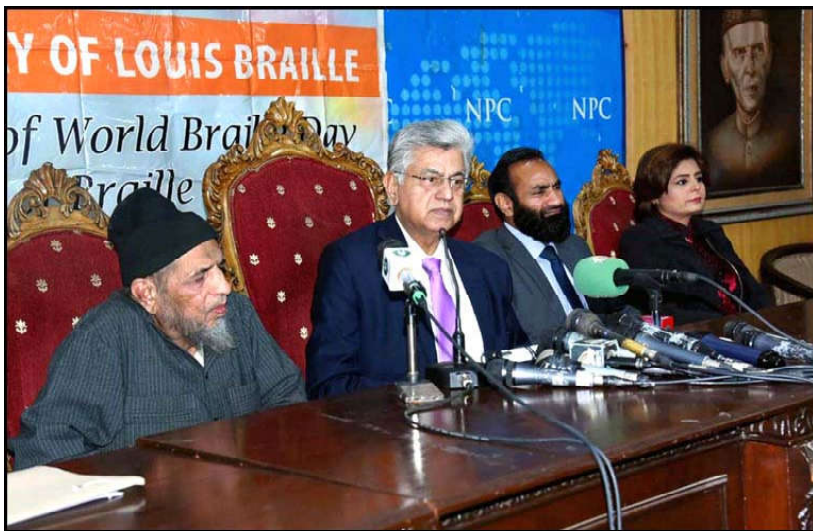
ISLAMABAD: Murtaza Solangi, Caretaker Federal Minister for Information and Broadcasting addressing an event organized by Pakistan Disabled Foundation for special persons at National Press Club.

He reaffirmed his trust in Pakistan's diplomacy and diplomats in their capability to fully deliver despite pressing odds and expressed the hope that the deliberations of this year's conference would lead to practical suggestions to navigate Pakistan's foreign policy through present day challenges. The prime minister extended his best wishes to the Foreign Office and Pakistani diplomats in safeguarding Pakistan's interests and advancing Pakistan's global stature. Caretaker Foreign Minister Jali Abbas Jilani has underlined the importance of regular debate on Pakistan's foreign policy and global and regional developments. He made this statement while speaking as an opening speaker at a three-day Envoys Conference that commenced at the Foreign Office in Islamabad today. Prime Minister Anwaar-ul-Haq Kakar will deliver a keynote address. The conference aims to deliberate and finalize recommendations on a range of bilateral, regional, and global dimensions of Pakistan's foreign policy. The Envoys Conference is a regular feature for in-depth discussions on various facets of Pakistan's foreign policy, considering regional and global developments.