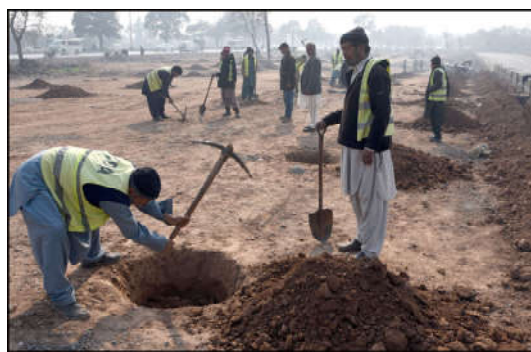
ISLAMABAD: Workers of CDA are busy in their work at green belt along the Murree road in Federal Capital.

Two individuals have been nominated for FIR. FIA is currently investigating the matter further. It is pertinent to mention that PTA has established a monitoring and detection system to identify unusual patterns and anomalies associated with SIM card activations. This technological upgrade has enabled prompt intervention and insight into suspicious SIM activations. Overall, this resolute and unwavering commitment underscores the Authority's dedication to eradicate the illegal issuance of SIMs.