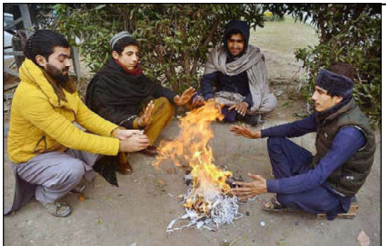
PESHAWAR: Vendors sitting around fire to keep them warm during cold weather in the city.