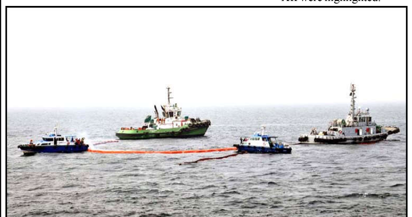
KARACHI: A view of marine oil spill exercise BARRACUDA XII conducted in Arabian Sea held under auspices of Pakistan Navy and Pakistan Maritime Security Agency.

KARACHI (APP): The sea phase of International Exercise Barracuda-XII was held at North Arabian Sea on Thursday which was participated by Interim Chief Minister Sindh Maqbool Bagra as chief guest who witnessed the sea phase of the exercise on board Pakistan Maritime Security Agency (PMSA) Ship KASHMIR. According to the Pakistan Navy news release, the air and surface assets of Pakistan Navy, PMSA, Pakistan Air Force (PAF) and other national stakeholders participated in the sea phase of exercise. Exercises on containment of oil spill, Search and Rescue operations and anti piracy were demonstrated by Pakistan Navy and PMSA aircrafts, PN & PAF helicopters and PMSA ships. The drills were witnessed by fifteen foreign observers and representatives of various National stakeholders. The foreign observers applauded the efforts being put in by all the stakeholders specially the efforts of Pakistan Navy and PMSA to fight any disaster at sea. Earlier, the opening brief of the exercise was held at Karachi. Foreign Observers and delegations from relevant stake holders also attended the brief wherein the aims and objectives of Exercise BARRACUDA-XII were highlighted.