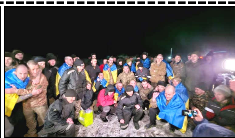
Ukrainian prisoners of war (POWs) pose after a swap, amid Russia's attack on Ukraine, at an unknown location in Ukraine.

think this statement speaks for itself," the official told reporters. Biden consulted with his national security team on the morning of New Year's Day while on holiday in the US Virgin Islands to "discuss options" over the Huthi attacks, the official said. Britain—a close US ally on security issues—has issued its own warning of "direct action," with Prime Minister Rishi Sunak saying that the Huthis "must end their deadly and destabilizing attacks on vessels." "The UK will always take action to defend freedom of navigation," Sunak wrote on X, formerly known as Twitter.