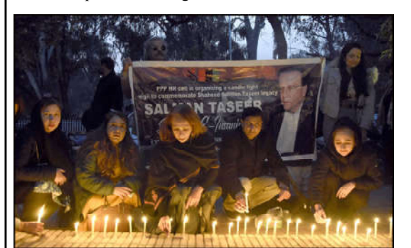
ISLAMABAD: Members of civil society hold a banner during candle light vigil ceremony on the eve of 13th death anniversary of former Governor Punjab Salman Taseer, at Kohsar market in the Federal Capital.

smog due to the insignificant rain during this Winter season has caused diseases among the citizens especially those with allergy issues, old people and children. According to health experts, the major sufferers of seasonal diseases especially influenza, cough and fever are the children and old ones due to their weak immune systems. They have suggested taking those diets which can boost their immunity to fight seasonal diseases, revert to organic foods and handle such issues with home remedies.