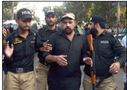
KARACHI: Policemen detain activists of Pakistan Tehreek-e-Insaf (PTI) party outside high court who arrived their case hearing in the Provincial Capital.