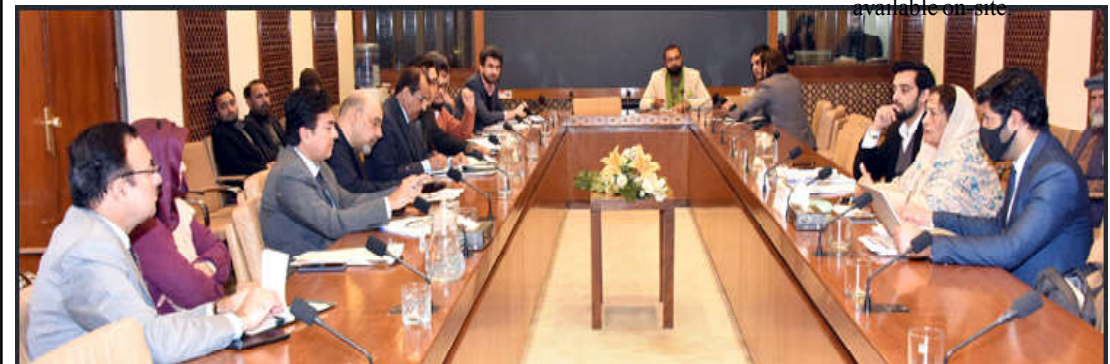
Senator Engr. Rukhsana Zuberi, Convener Sub-Committee of the Senate Standing Committee on Overseas Pakistanis and Human Resource Development presiding over a meeting of the committee at Parliament House Islamabad.