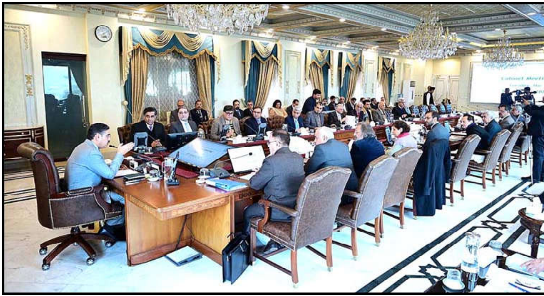
ISLAMABAD: Caretaker Prime Minister Anwaar-ul-Haq Kakar chairs meeting of the Federal Cabinet.

Vol. XIV No. 25 Reg. mails-B / ID-445 Wednesday January 31, 2024, Rajab 19, 1445 A.H. Ph: 2158688, 2158997 Pages 4: Rs. 12