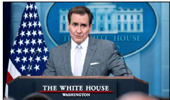
US National Security Council spokesmans John Kirby speaks during the daily briefing in the Brady Briefing Room of the White House in Washington, DC.