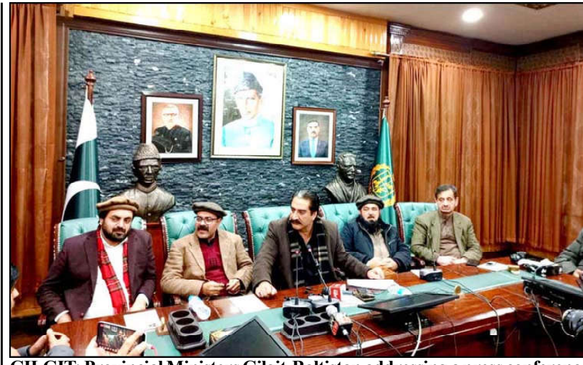
GILGIT: Provincial Ministers Gilgit-Baltistan addressing a press conference regarding wheat subsidy.

During a briefing, the caretaker CM was told that Angiography, CTscan and other facilities are being conducted at the hospital.