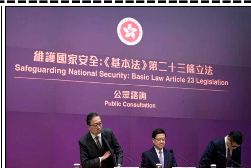
Hong Kong's Secretary for Justice Paul Lam, Chief Executive John Lee and Secretary for Security Chris Tang Ping-keung attend a press conference regarding the legislation of Article 23 national security laws, in Hong Kong.

Officials in Kyiv have urged Western allies to bolster its air defence capabilities and said gaining control of the country's air space is a priority for this year.