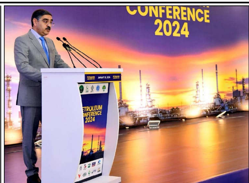
ISLAMABAD: Caretaker Prime Minister Anwaar-ul-Haq Kakar addresses the participants of Petroleum Conference.

Provincial chief ministers, minister for energy, secretary petroleum, government representatives, policy makers, foreign and domestic investors from the energy and petroleum (E&P) sector and international delegates also attended the conference.