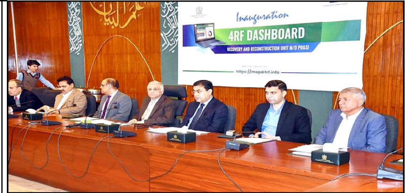
ISLAMABAD: Caretaker Minister for Planning Development & Special Initiatives, Muhammad Sami Saeed chairs the 3rd meeting of the Policy & Strategy Committee/Oversight Board for Post-Flood Resilient, Recovery, Rehabilitation and Reconstruction Framework (4RF) at the Planning Ministry.