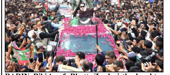
BADIN: Bibi Aseefa Bhutto Zardari, the daughter of Shaheed Mohtarma Benazir Bhutto addressing to Party workers rally at DC Chowk during Election Campaign.

He said that the caretaker government and concerned authorities would be contacted to facilitate these girls who are gifted with talent and persistence to pursue their passion.