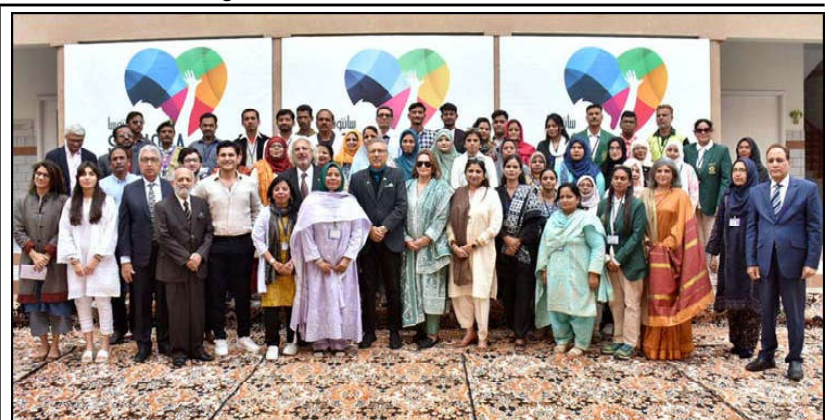
KARACHI: President Dr. Arif Alvi and the First Lady Begum Samina Arif Alvi in a group photo with organizers and staff at Society for Children in Need Of Special Attention (SCINOSA).

RAWALPINDI (Online): PTI founder Imran Khan has said one of his Aides de Camp (ADC) stole the cipher at behest of former army chief Gen (Retd) Qamar Javed Bajwa. He said this in his statement recorded under 342 during the hearing of cipher case in Adiala jail Tuesday. While recording his statement Imran Khan said "cipher was in Prime Minister (PM) House. The responsibility of security rests with military secretary, principal secretary and secretary protocol who sees the security of PM house. He further said during my tenure of three and half years this is the only document which went missing from PM house. After cipher went missing I asked military secretary to hold inquiry. That was the only occasion when I got offended with military secretary. He stated one of his ADCs stole cipher at the behest of Gen (Retd) Bajwa. Military secretary told after inquiry that no evidence has been found with reference to cipher.