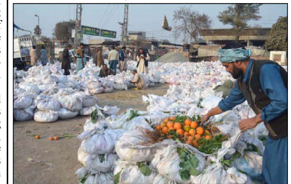
SARGODHA: Vendors displaying orange to attract the customers in front of market.

He assured that the PTA would continue to focus on improving coverage, access and quality of services to promote ease of doing business and attract more investment.