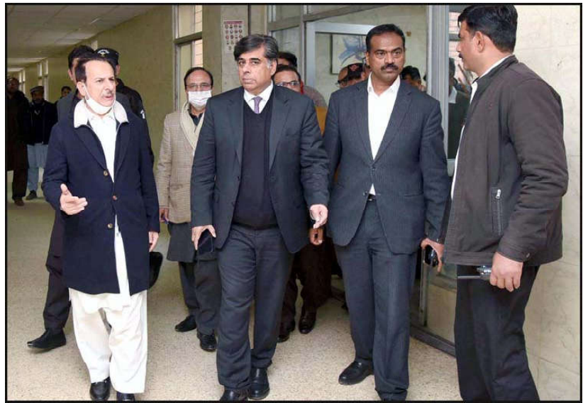
ISLAMABAD: Caretaker Interior Minister and Commerce Dr. Gohar Ejaz & Federal Minister for National Health Dr. Nadeem Jan visited PIMS Hospital.