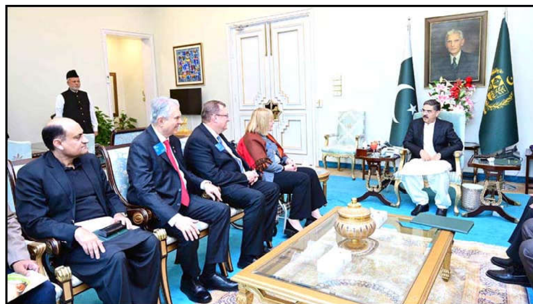
ISLAMABAD: A delegation of Rotary International calls on Caretaker Prime Minister Anwaar-ul-Haq Kakar.

The Foreign Office in a statement said that the ICJ had ordered Israel to urgently undertake a series of measures in relation to Palestinians in Gaza to prevent the commission of acts prohibited by the Genocide Convention, including killing members of the group; causing serious bodily or mental harm to members of the group.