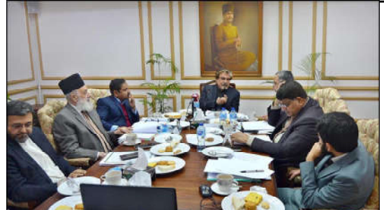
LAHORE: Caretaker Federal Minister for National Heritage and Culture Jamal Shah presiding over the Governing Body meeting of Iqbal Academy Pakistan at Aiwan-e-Iqbal.

underpasses in the city, criticising the unconventional lighting that malfunctioned on the first day. The court also stressed the urgency for water conservation and observed that there were predictions about water scarcity by 2026-2027, envisioning a future where water tankers become a common sight in Lahore. The court addressed the provincial law officer and asked what steps had been taken by the Water and Sanitation Agency for installing water meters. To which, a member of the Judicial Water and Environment Commission stated that a one-year timeline had been given for installing water meters.