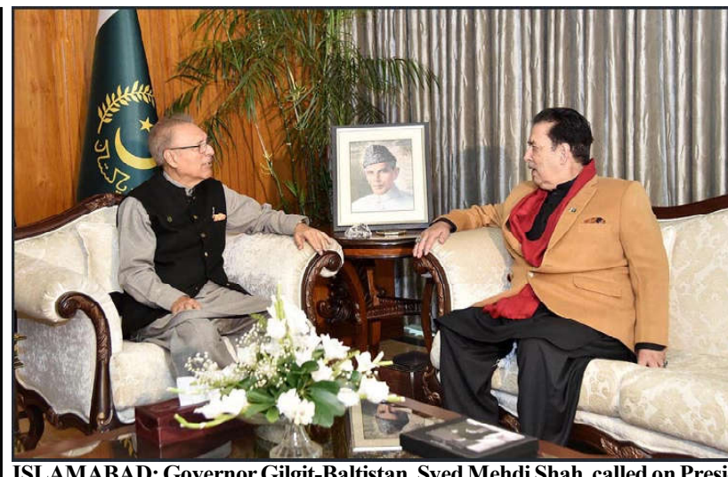
ISLAMABAD: Governor Gilgit-Baltistan, Syed Mehdi Shah, called on President Dr Arif Alvi, at Aiwan-e-Sadr.

ISLAMABAD (APP): After the prolonged dry period, the much-awaited rain with snowfall over the hills in upper parts of the country during the coming days, as per weather experts forecast, will weaken dense foggy conditions and provide relief to the citizens by improving air quality. According to the Pakistan Meteorological Department (PMD), rain of light to moderate intensity with snowfall over the hills will lash upper parts of the country with occasional gaps. The rain will also reduce travel hazards in the fog bearing areas of the country and prove as a sigh of relief for those suffering from viral diseases especially allergy patients. A westerly wave was likely to enter western parts of the country on January 27 (night), and may persist over upper parts till January 31. Under the influence of this weather system, light to moderate rain with snowfall over the hills is expected in Gilgit-Baltistan including Diamir, Astore, Ghizer, Skardu, Hunza, Gilgit, Ghanche, Shigar while in Kashmir including Neelum valley, Muzaffarabad, Poonch, Hattian, Bagh, Haveli, Sudhanoti, Kotli, Bhimber, Mirpur from January 27-31. In Khyber Pakhtunkhwa, light to moderate rain with snowfall over the hills is expected in Chitral, Dir, Swat, Abbottabad, Mansehra, Haripur, Kohistan, Shangla, Buner, Karak, Peshawar, Charsadda, Nowshera, Swabi, Buner, Bajaur, Kurram, Waziristan.