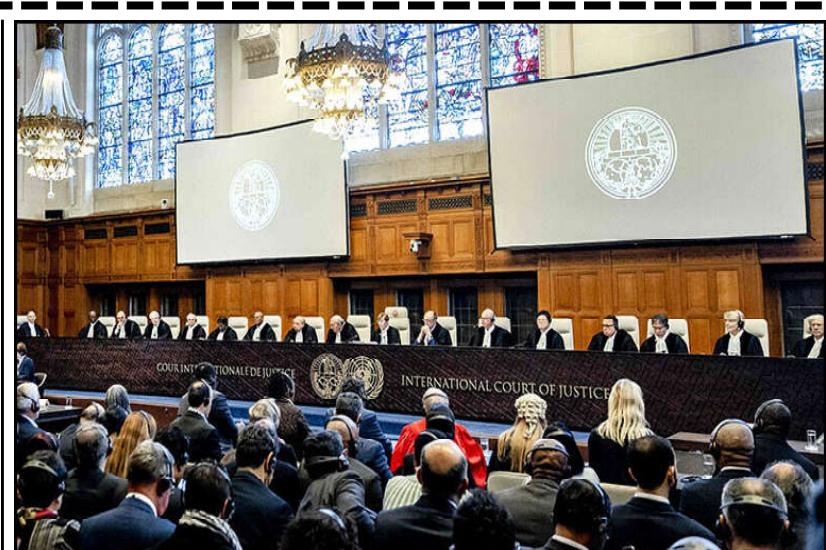
Judges at the International Court of Justice (ICJ) rule on emergency measures against Israel following accusations by South Africa that the Israeli military operation in Gaza is a state-led genocide, in The Hague, Netherlands.

other supplies in Gaza. It was not immediately known which one was operating in the area at the time of the incident. The UN refugee agency for Palestinian refugees, UNRWA, and the UN World Food Program both said they were not involved. Israeli troops and tanks pushed into Gaza City shortly after the ground invasion began in October and have been battling Palestinian militants there for nearly two months. The military says it has largely dismantled Hamas in northern Gaza but is still facing pockets of resistance, and large swaths of Gaza City and surrounding areas have been reduced to rubble by Israeli bombardment.