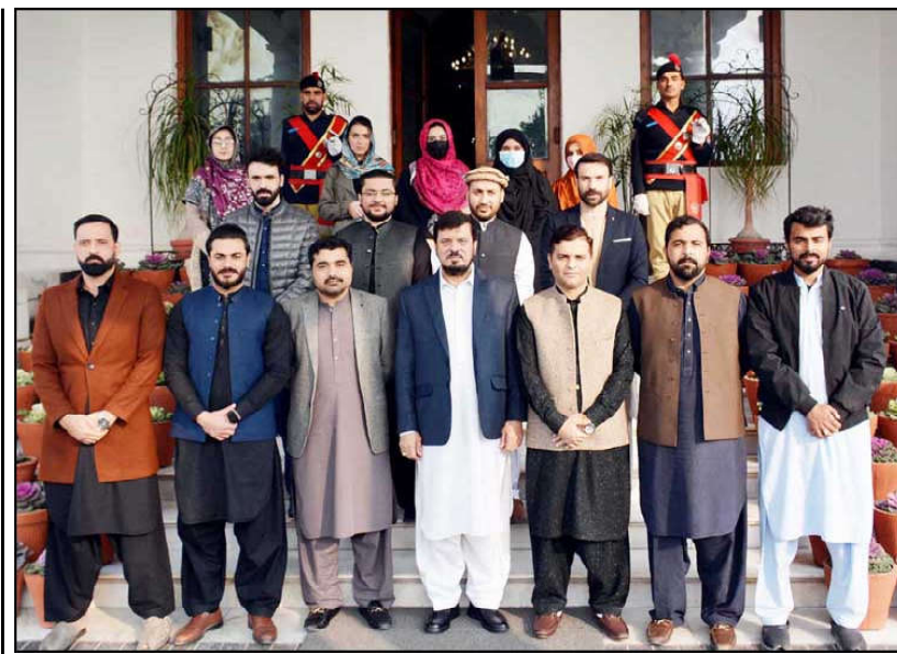
PESHAWAR: Group photo after the meeting of Khyber Pakhtunkhwa Governor Haji Ghulam Ali with the representative delegation of Young Doctors Association Khyber Pakhtunkhwa at Governor House.