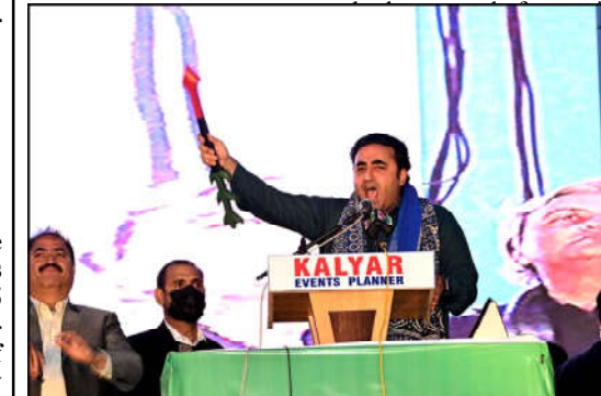
MULTAN: Peoples Party (PPP) Chairman, Bilawal Bhutto Zardari addresses to his supporters during public gathering meeting as a part of Election Campaign in connection of the General Election 2024 coming ahead, in Multan.

Justice Athar Minallah remarked people have to decide the election. Contesting election is fundamental right. People have to decide who will contest election and who will not and not the Election Commission (EC). He further remarked let people of Pakistan decide the petitioner