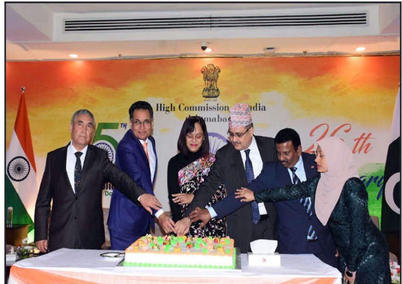
ISLAMABAD: Charge d'Affaires of Indian Embassy to Pakistan Geetika Srivastava, Dean of Diplomatic Crops CARs Ambassador of Turkmenistan Atadjan N Movlamov and others cutting the cake on the occasion of the 75th Republic Day of India, at a local hotel in Federal Capital.