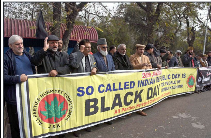
ISLAMABAD: Activists of All Parties Hurriyat Conference (APHC) holds a banner during protest as they observe Indian Republic Day as Black Day during an anti-Indian protest in front of Ministry of Foreign Affairs in the Federal Capital, to show their solidarity with people of Indian-administered Kashmir.

ISLAMABAD (APP): Special Assistant to Prime Minister (SAPM) Mushaah Hussain Mulick stated that Kashmiris across the Line of Control (LoC) marked Indian Republic Day on Friday as a Black Day, expressing their strong disapproval and resentment towards India. In her special message on Black Day here Friday, she stated that the people in Indian Illegally occupied Jammu and Kashmir (IIOJK) along with the rest of the world, marked Indian Republic Day as a Black Day. She criticized the RSS-led Indian government for celebrating the abrogation of the constitution, targeting minorities and undermining the so-called scholarly democracy. Mushaah further commented that Indian Prime Minister Narendra Modi inaugurated the idol of Lord Ram at the new temple constructed on the site where the Babri Masjid stood for centuries before being demolished by a Hindutva mob.