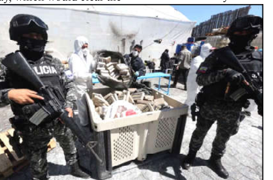
Ecuadorian authorities place drug packages in a container, as part of the more than 20 tons of seized drugs to be destroyed at an undisclosed location, in Ecuador.

way for Canada to immediately lift the export controls that it adopted in 2020, the two sources said, requesting anonymity. The agreement was reached in early January after months of talks, said one person familiar with the process. A second person familiar with the plan said the sides agreed it would take effect after Sweden's ratification was complete. Turkey's foreign ministry declined to comment. Canadian Foreign Ministry spokesperson Charlotte MacLeod told Reuters that while the export controls currently remained in place, Ottawa aimed to resolve the issue with Turkey given its status as a NATO ally.