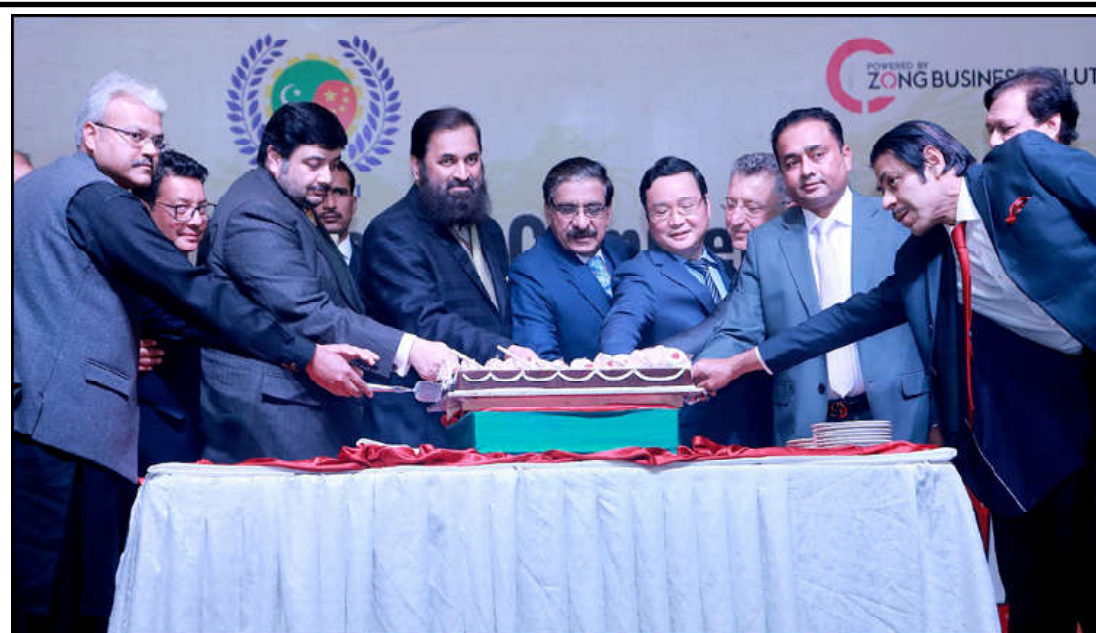
LAHORE: Governor Punjab Muhammad Baligh-ur-Rehman and others cutting cake on the eve of new Chinese year organized by Pakistan China Joint Chamber of Commerce and Industry.