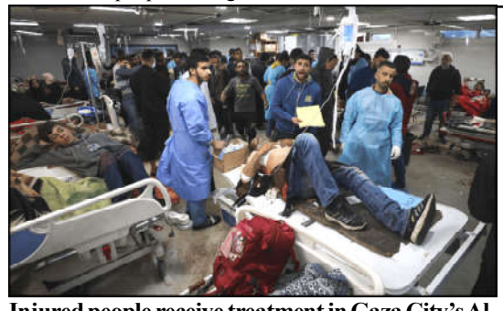
Injured people receive treatment in Gaza City's Al-Shifa hospital, following a reported Israeli strike, that according to Gaza's Health Ministry, killed at least 20 and wounded more than 150 as they waited for humanitarian aid.

Reuters/Ipsos poll conducted earlier this month showed him and Biden tied, though a nationwide survey does not capture the subtleties of the electoral college contest that will be decided this fall in just a handful of competitive states. As Trump handily beat his sole remaining primary challenger, Nikki Haley in New Hampshire on Tuesday, some 67% of respondents polled Monday through Wednesday said they were "tired of seeing the same candidates in presidential elections and want someone new."