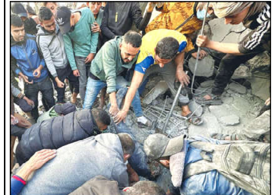
RAFAH: Palestinians inspect the site of an Israeli strike on a mosque, amid the ongoing agression in the southern Gaza Strip.

border crossings between them. One of those gates, between the Gurbulak-Bazergan regions, has been under construction since 2021. "While we have left behind the pandemic, the restrictive effect of sanctions lingers," Erdogan said, adding that Turkey would not cut its economic ties with cording to Turkish Trade Minister Omer Bolat, down Iran because of the international measures