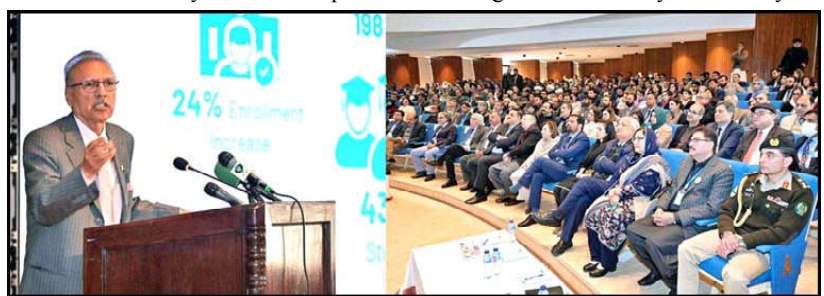
ISLAMABAD: President Dr Arif Alvi addressing a ceremony to commemorate the International Day of Education.

He said Pakistan Army could fight against terrorists, but the cooperation of the entire nation was imperative in that regard. The COAS said that the main objective of social media and propaganda was to spread uncertainty, chaos and despair, whereas social media news verification was critical as without research and positive thinking, society remained chaotic. Citing verses of the Holy Quran on disinformation, he said: "Allah Almighty says: 'O believers! If a transgressor brings news, you should firstly confirm it.'" The establishment of Pakistan was just like the Tayyaba state (referring to Islamic State of Medina), that were founded under the sublime banner of Kalima-e-Tayyaba, the Army Chief said. "Allah Almighty has blessed Pakistan with abundant natural resources, agriculture and young manpower," he added.