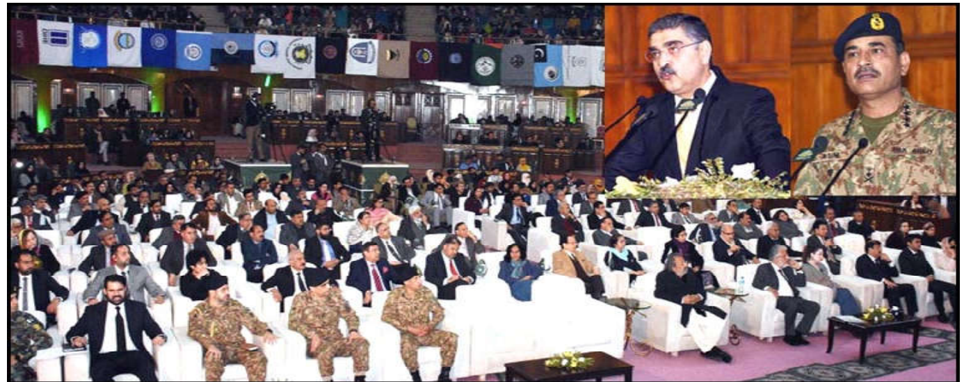
ISLAMABAD: Caretaker Prime Minister Anwaar-ul-Haq Kakar and Chief of the Army Staff General Syed Asim Munir addressing the participants of Pakistan National Youth Conference.

(COAS) General Asim Munir, NI (M), was the guest of honour. "We, as a nation, have fought the menace of terrorism most valiantly, offering unparalleled sacrifices," he said. Prime Minister Kakar appreciated the role of armed forces in the fight against the menace of terrorism with full commitment and professional excellence. "Pakistan's successes in the war against terrorism would not have been possible without the participation and support of the youth who make 65% of our population," he added. Addressing the conference, the COAS underscored that the youth were Pakistan's biggest asset, and all optimism of a brighter future was associated with them. Conveying the message of hope, the COAS asked the youth to shun despondency. He referred to the historic role played by the youth in creation and development of Pakistan and exhorted them to partake in building the nation through discipline, honest toil and a genuine quest for knowledge. He highlighted the power potential of Pakistan, the demographic dividend, immense mineral wealth, a creative corpus of IT literate workforce, and great prospects in agriculture. The COAS emphasized upon the importance of national unity and harmony to overcome multifarious challenges confronted by the country.