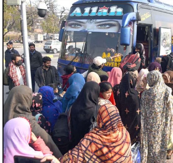
ISLAMABAD: Relatives of Baluchistan missing persons stands in a queue waiting for boarding in a bus after the finish sitting protest (Dharna) in front of National Press Club in Federal Capital.

self handcuffed, jailed and convicted. He deplored that five judges had deposed him from the PM's Office for not taking a salary from his son. The former premier wondered why the people of Pakistan faced distress after his removal, expressing his deep concern for their plight. Nawaz stated that his heart would be at peace only if the people of Pakistan found relief from the prevailing crises of inflation, unemployment, energy shortfall and terrorism. The venue of the PML-N rally reverberated with the chants of "Mian Saab, We love you", as the former three-time premier walked up to the stage. Nawaz Sharif appreciated the enthusiasm of the party workers, supporters and constituents, saying that he had never seen such a sight on a very cold day.