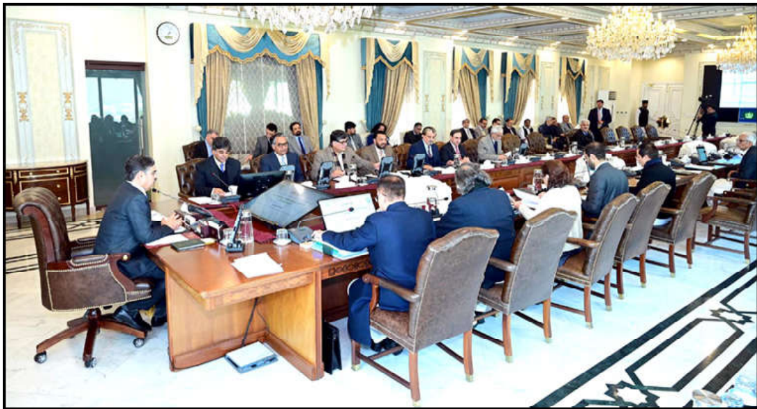
ISLAMABAD: Caretaker Prime Minister Anwaar-ul-Haq Kakar chairs a meeting of the Caretaker Federal Cabinet.

Vol. XIV No. 19 Reg. mails-B / ID-445 Wednesday January 24, 2024, Rajab 12, 1445 A.H. Ph: 2158688, 2158997 Pages 4: Rs. 12