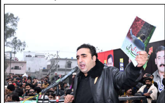
CHINIOT: Chairman PPP Bilawal Bhutto Zardari addressing a public gathering at Hockey Stadium.

According to notification issued by EC the development funds of local bodies and cantonment boards have been frozen and the local bodies will do cleanliness and sanitation work and daily routine matters. They will not be authorized to launch new scheme or offer tenders.