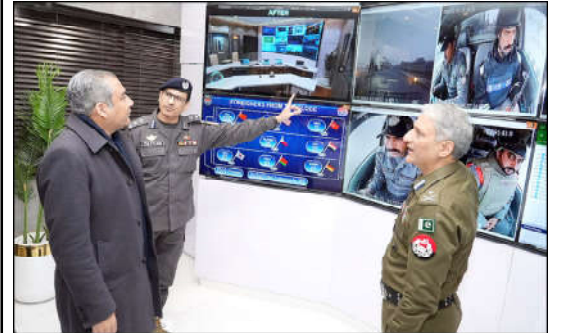
LAHORE: Caretaker Chief Minister Mohsin Raza Naqvi along with Inspector General Police Punjab inspecting latest Security Cameras after inaugurating Special Protection Unit (Special Operation Room) at city traffic Police Lines Manawa.

tolerance policy of the government against corruption and warned of strict action against officials involved in corrupt practices. Meanwhile, Caretaker Chief Minister Khyber Pakhtunkhwa, Justice (Retd) Syed Arshad Hussain Shah formally launched the Bannu Economic Zone here on Tuesday. The launching ceremony was held here in the Chief Minister's Secretariat wherein the Caretaker Chief Minister also distributed plot allotment letters among intending investors. Bannu Economic Zone is 14 th zone of the Khyber Pakhtunkhwa.