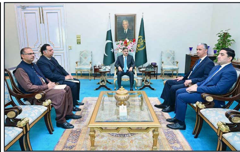
ISLAMABAD: The outgoing Ambassador of Tajikistan in Pakistan, Ismatullo Naserdin calls on Caretaker Prime Minister Anwaar-ul-Haq Kakar.

In these circumstances, the number of people complaining of cold-related ailments has also shot up over the last few days.