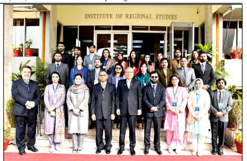
ISLAMABAD: President Dr Arif Alvi in a group photo with the participants of the inaugural session of the Regional Dialogue 2024 on "Climate Crisis: Shaping South Asia's Resilience" organized by the Institute of Regional Studies.

The president exemplified the Netherlands which was the second largest food supplier on earth despite being 19 times smaller in size than Pakistan and not having such an abundance of water similar to Pakista