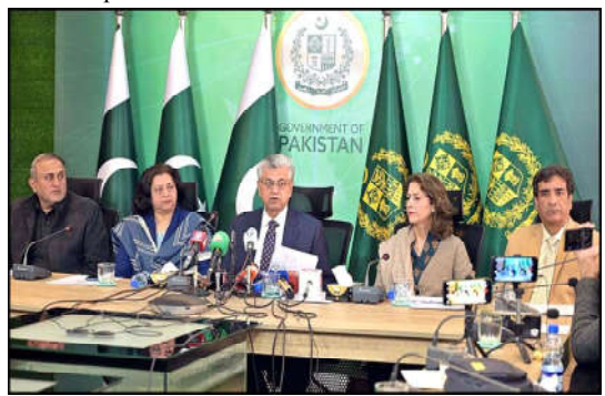
ISLAMABAD: Caretaker Federal Minister for Information and Broadcasting Murtaza Solangi addressing a press conference at PTV Headquarters.