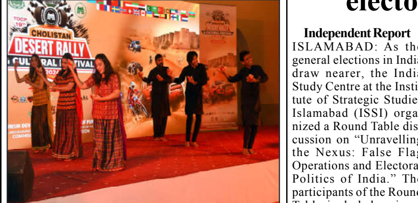
ISLAMABAD: Artists performing traditional dance during TDCP 19th International Cholistan Desert Rally and Culture Festival, at a local hotel in the Federal Capital.

Over 40,000 personnel globally, in conjunction with advanced technology, are deployed to ensure user