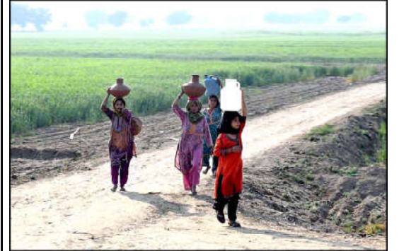
LARKANA: Women and girls on the way back to their homes after filling water in pots.