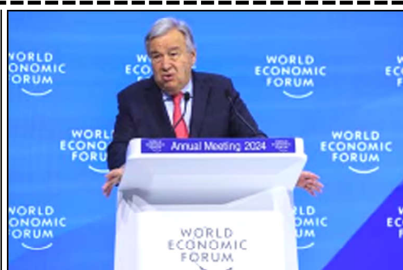
UN Secretary-General Antonio Guterres attends the 54th annual meeting of the World Economic Forum in Davos, Switzerland.

The Blue Line refers to the border demarcation between Israel and Lebanon, established by the United Nations in 2000 following the withdrawal of Israeli forces from southern Lebanon. Earlier this month, Israel carried out a drone strike across the Blue Line to kill Hamas's deputy chief Saleh Al Arouri, leading to regular clashes across the border.