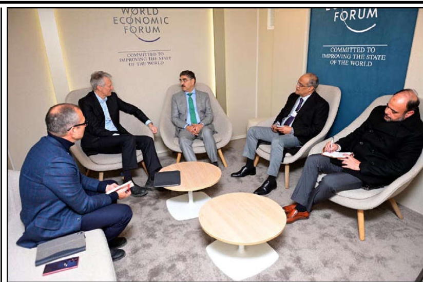
CEO of CocaCola Company, James Quincey calls on Caretaker Prime Minister Anwaar-ul-Haq Kakar on the sidelines of the World Economic Forum in Davos.

In the meeting, the Prime Minister highlighted the steps taken by the government to facilitate business and investment in Pakistan.