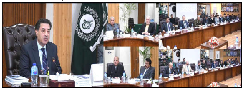
ISLAMABAD: Chief Election Commissioner, Mr. Sultan Raja, presiding over a meeting on General Elections at ECP Secretariat.

He highlighted that the caretaker government would publish a white paper on its 4.5 months performance. "We did introduce and revamp the programme within taxation system, we brought structural changes that would be passed through the Cabinet formerly by the end of the month, after that it would be in place as policy." Further, he said the caretaker government opted for aggressive privatization, it cut its expenditures at the federal level and it was also carrying out talks with the provinces so they could rationalize their expenditures.