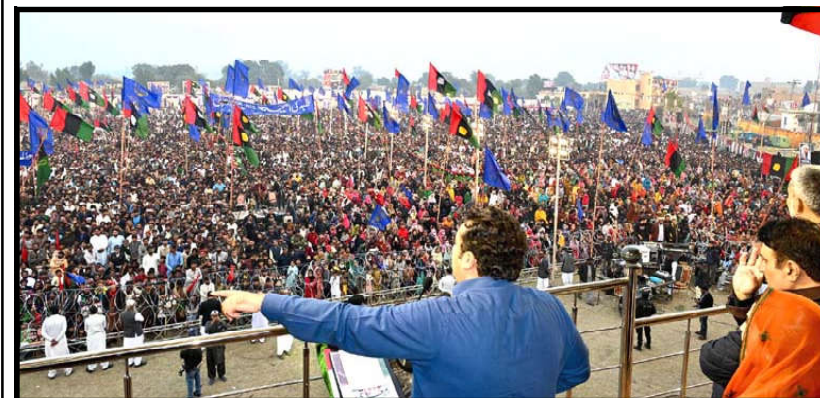
SANGHAR: Peoples Party (PPP) Chairman, Bilawal Bhutto Zardari addresses to his supporters during public gathering meeting in connection of General Election 2024 coming ahead, in Sanghar.

The CJP remarked if IG is giving papers of Kalashnikov this way then as to why action should not be taken against him. We write to interior secretary all should return Kalashnikov and their licenses.