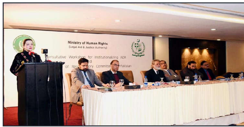
Special Assistant to Prime Minister for Human Rights and Women Empowerment, Mushaal Hussein Mullick addressing a workshop on Alternative Dispute Resolution (ADR) organized by Legal Aid and Justice Authority (LAJA), Ministry of Human Rights, in Islamabad.

Efforts include rigorous data registration, verification of identification documents, and systematic searches of individuals entering the high-security zone on a regular basis. In the past week alone, police spokesperson said the Islamabad Capital Police took action by removing tinted glasses and improper number plates from 1,511 vehicles, impounding 109 vehicles without proper documentation at various checkpoints within the high-security zone. Police officers and