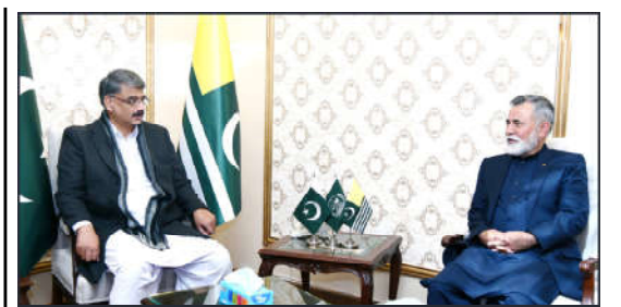
ISLAMABAD: Chairman Public Service Commission Lt. General (Retd) Hidayat-ur-Rehman meeting with Prime Minister Azad Kashmir Chaudhary Anwar-ul-Haq.

Senator Rehman's statements came in response to concerns raised by the Election Commission of Pakistan (ECP) regarding potential delays in certain constituencies, as revealed in their announcement on Tuesday. While ballot paper printing for the 2024 elections has commenced, apprehensions linger over possible polling delays due to numerous pleas for a change of election symbols in related constituencies, peaking to reporters, Senator Rehman said: "The PPP is the only party in the country that adopted a proactive approach to electioneering by launching its formal campaign on December 27, 2023, while Chairman Bilawal Bhutto and Aseefa Bhutto Zardari have been actively participating in campaign activities. Moreover, President Zardari is set to inaugurate Chairman Bilawal's election office in Lahore, too. However, concerns persist regarding the allocation of electoral symbols to some PPP candidates in Punjab."