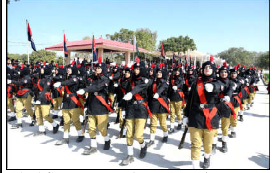
KARACHI: Female police march during the passing-out ceremony at Saeedabad Police Training Centre, in Provincial Capital.

meeting The discussed observations the mega housing scheme.