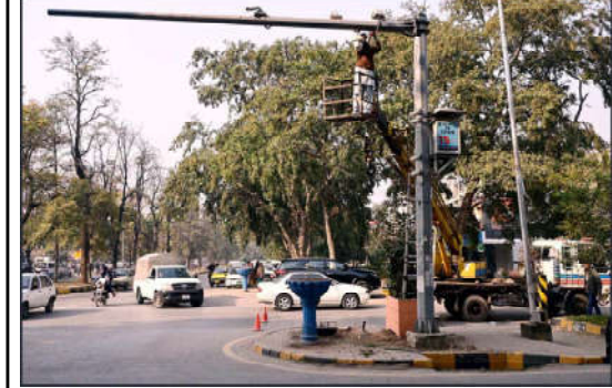
ISLAMABAD: A worker is busy in the maintenance work of CCTV cameras installed in Federal Capital.