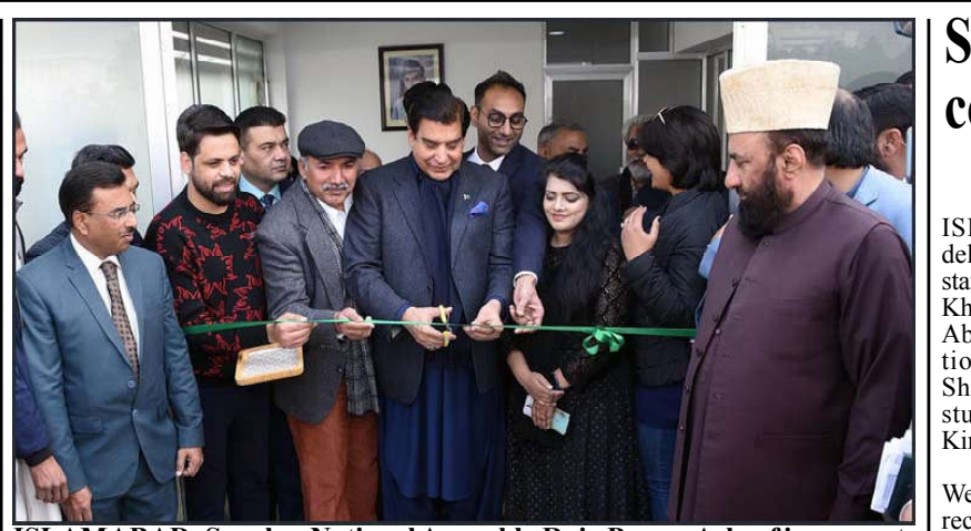
ISLAMABAD: Speaker National Assembly Raja Pervez Ashraf inaugurating the office of the Parliamentary Reporters Association at Parliament House.

The Supreme Court of Pakistan on Tuesday dis-