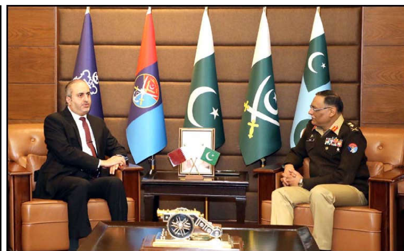
RAWALPINDI: Chairman Joint Chiefs of Staff Committee (CJSC), General Sahir Shamsah Mirza exchanging views with Ali Bin Mubarak Al Khater, Ambassador of the State of Qatar to Pakistan during meeting held in Rawalpindi.

postponement of elections. The resolution received majority support with 14 votes from senators. Meanwhile the Election Commission (ECP) tasked the Printing Corporation of Pakistan on Monday with producing 250 million watermarked ballot papers for the February 8 polls. According to sources, the ECP sanctioned the printing of ballot papers for the upcoming general elections during its meeting. Distinctive watermarks will adorn the ballot papers, which are set to be printed using three different machines. Rigorous security protocols have been ensured for the Printing Corporation premises during the ballot paper production.