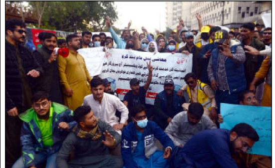
KARACHI: Lady Health Workers and vaccinators of Expanded Programme on Immunization (EPI) are holding protest demonstration for acceptance of their demands, at Karachi press club.

Court (SC) order for holding election on May 14 in Punjab. No care taker set up can stay after 90 days. The incumbent care taker government is working illegally and unconstitutionally in Punjab. The care taker government of Punjab was abolished forthwith and order was issued for establishment of new interim set up in Punjab. The counsel for federal government argued the said matter is pending hearing in Supreme Court (SC) too. SC has given order to hold election. Election schedule has been issued. The elections are going to be held on February 8.