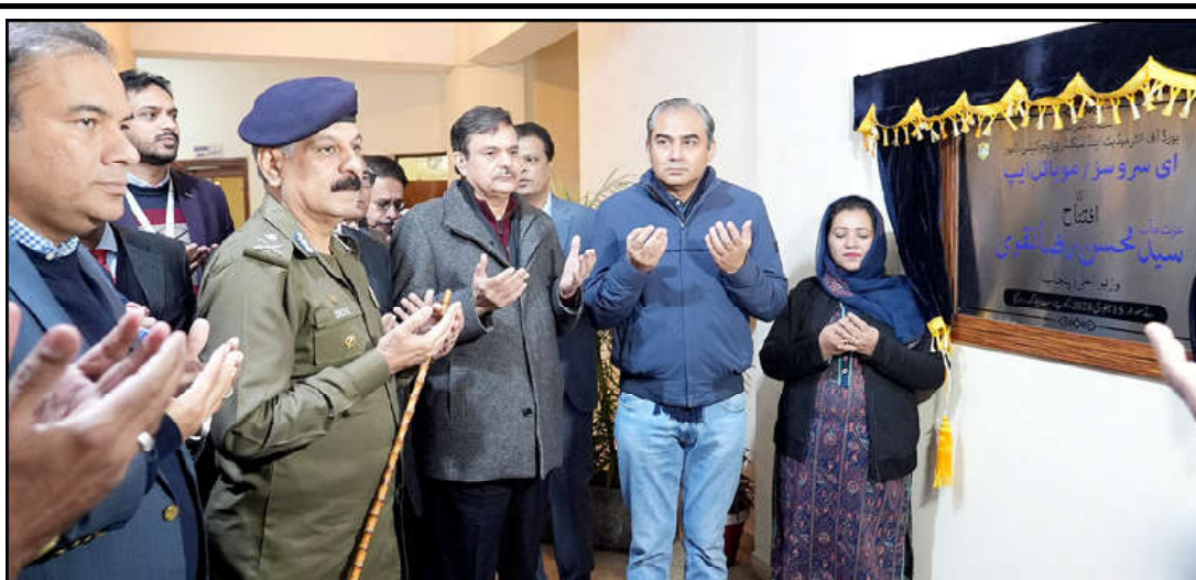
LAHORE: Caretaker Chief Minister Punjab Mohsin Raza Naqvi offering a Dua after inaugurating E-Services/Mobile App at Lahore Board of Intermediate and Secondary Education.

female competitors. The icy battlegrounds are ready to host an intense showdown of skill, speed, and teamwork as the players vie for victory. Beyond the thrill of ice hockey, the festival boasts a lineup of diverse competitions, including Ice Skating and traditional local games such as Basra, Pindok, and Baalbut. Participants from across Gilgit-Baltistan are gearing up to showcase their prowess in these unique and culturally significant contests. One of the highlights of this year's event is the active participation of female teams in various competitions.