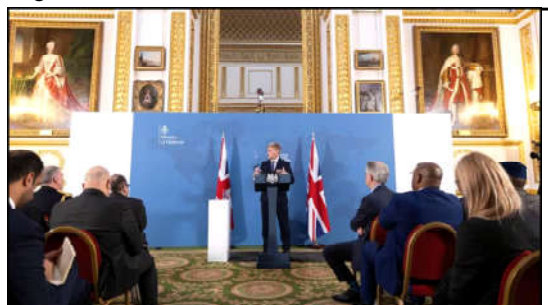
Britain's Secretary of State for Defence Grant Shapps gives a speech at Lancaster House, in London, Britain.