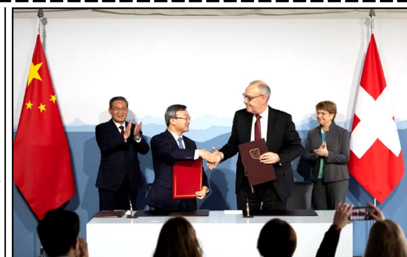
Swiss Federal Minister Guy Parmelin and Wang Shouwen, Chinese Vice Minister of the Ministry of Commerce shake hands after signing a joint statement of the free trade agreement, next to Swiss President Viola Amherd and Prime Minister of the People's Republic of China, Li Qiang during an official visit in Kehrsatz near Bern, Switzerland.

commerce as necessary." The Houthi fire on Sunday went in the direction of the USS Laboon, an Arleigh Burke-class destroyer operating in the southern reaches of the Red Sea, the U.S. military's Central Command said in a statement. The missile came from near Hodeida, a Red Sea port city long held by the Houthis, the U.S. said. "An anti-ship cruise missile was fired from Iranian-backed Houthi militant areas of Yemen toward USS Laboon," Central Command said. "There were no injuries or damage reported."