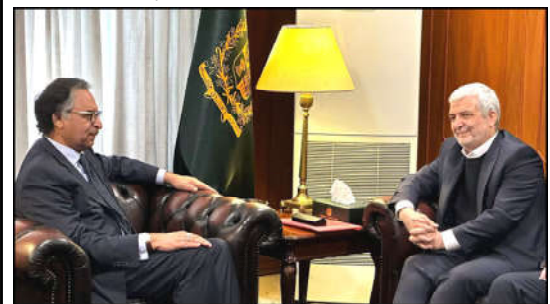
ISLAMABAD: Iran's Special Representative for Afghanistan Affairs, Hassan Kazmi Qomi called on caretaker Foreign Minister Jalil Abbas Jilani.

ISLAMABAD (APP): Caretaker Foreign Minister Jalil Abbas Jilani on Monday underscored Pakistan's commitment to a peaceful and stable Afghanistan and emphasized the need for enhanced coordination for regional stability. Here received Iran's Special Representative for Afghanistan Affairs Hassan Kazmi Qomi, Foreign Office Spokesperson posted on X account. The foreign minister also underlined the critical role of the neighbouring countries of Afghanistan to achieve the vision of a peaceful and stable region. Earlier, Ambassador Qomi held extensive talks with Pakistan's Special Representative on Afghanistan Affairs Asif Durani over the situation in Afghanistan and regional processes for peace and dialogue.