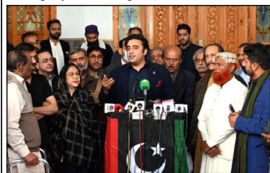
QAMBAR SHAHDADKOT: Peoples Party (PPP) Chairman, Bilawal Bhutto Zardari talking to media persons during his visit to Qambar Shahdadkot.