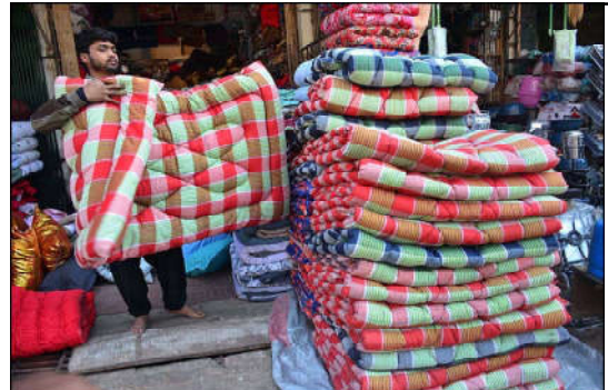
HYDERABAD: A vendor displaying quilts to attract the customers at his shop during winter season.

commitment to allocate a minimum of $14 billion of its own resources to support food security between 2022 and 2025. Additionally, it will outline ADB's forward program on food security, forging partnerships with a diverse array of stakeholders in the Asia-Pacific region. According to the ADB announcement, the Asia and the Pacific Food Security Forum 2024 will act as a platform for both public and private sector partners to showcase their thought leadership and innovative initiatives. Participants will delve into discussions focused on constructing more