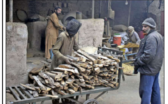
LAHORE: A vendor is unloading the woods from handcart to use as fuel at traditional mud oven at Misri Shah area of the Provincial Capital.