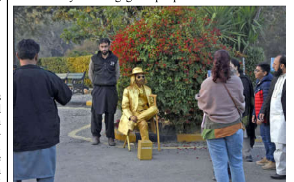
ISLAMABAD: People taking picture with Golden man at Damm-e-Koh picnic point during Sunday Holiday in the Federal Capital.

Further, he claimed that the major political leaders have been avoiding to take the names of culprits - including USA and Israel - who have killed the hapless people of Gaza.