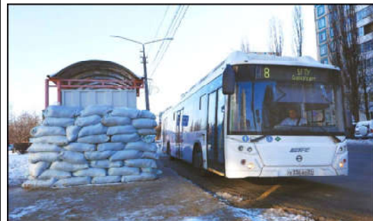
A bus stops at a place protected with sandbags in Belgorod, the main city in Russia's south-western region which has come under shelling by Ukraine over the past week.

Monitoring Desk COPENHAGEN: A volcano in southwest Iceland erupted on Sunday, the country's meteorological office said, making it the fifth eruption on the Reykjanes peninsula since 2021. A coast guard helicopter has been sent to assess the situation and the exact location, the Civil Protection agency said. The eruption began north of the fishing town of Grindavik but it was still not clear exactly where the lava.