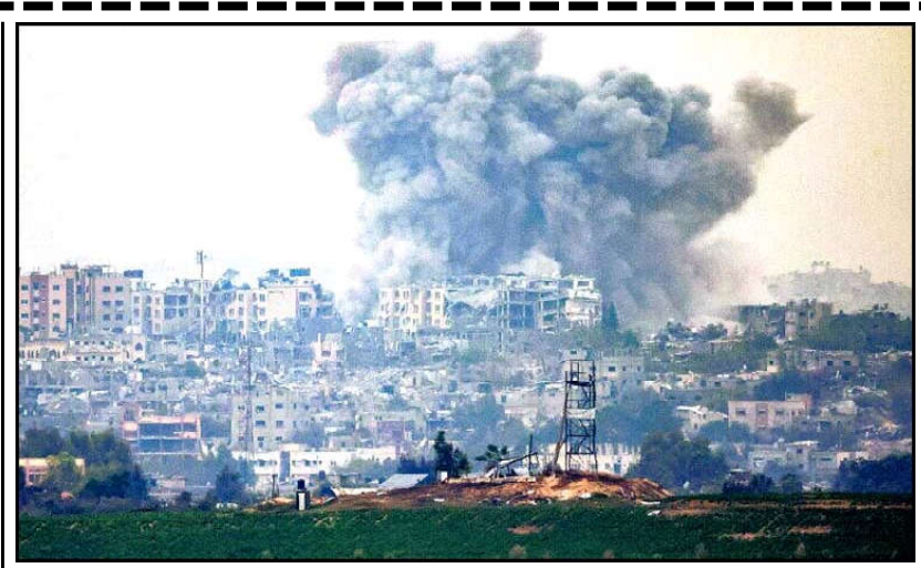
A plume of smoke ascends following Israeli bombardment over the Gaza Strip.

ing detail as to what was hit. Police in the northern region of Chernihiv posted a picture of a large crater made by a downed missile. "As a result of being hit by the debris of an enemy missile, several private homes and non-residential buildings were damaged, one building was practically destroyed," the police wrote. No people were hurt but a dog was killed, police said. France's new foreign minister Stephane Sejourne on Saturday renewed his country's support to Ukraine, choosing Kyiv for his first official visit abroad, as the war with Russia nears a second anniversary.