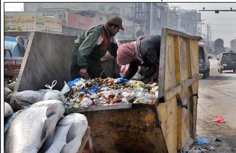
ISLAMABAD: Gypsy youngsters searching valuables from garbage.