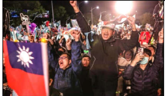
Taiwan voters elected Lai Ching-te to be their next president despite warnings from China that he would take the island closer to war.