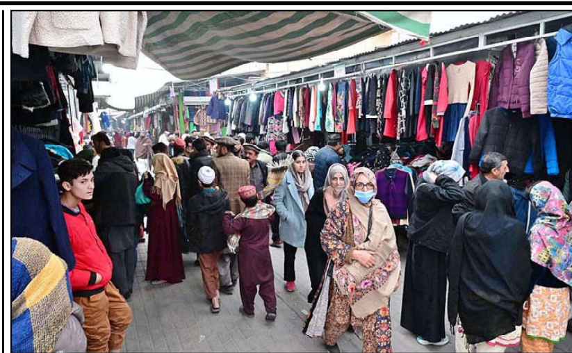
ISLAMABAD: Customers selecting and purchasing old clothes displayed by the Weekly Bazaar vendors to attract the customers.

It also noted that e-commerce logistics demand still remained at a high level in December, with the categories of winter clothing and ice-and-snow tourism equipment proving major sources of momentum.