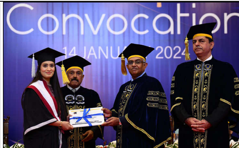
Chief Naval Staff Admiral Naveed Ashraf award certificate to a student of Bahria University Karachi Campus during 19th Convocation ceremony.