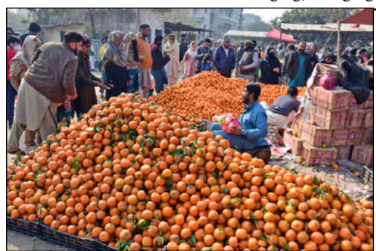
ISLAMABAD: People are busy buying Kinnow in Sunday weekly bazaar at sector G-10 in the Federal Capital.