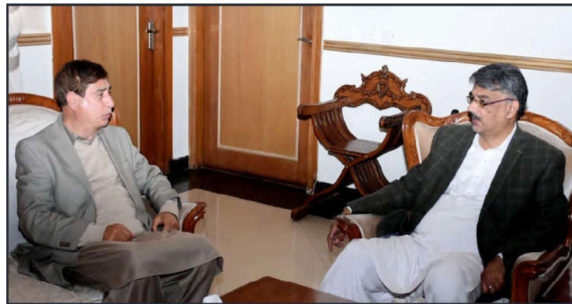
ISLAMABAD: President PML-N Azad Kashmir Shah Ghulam Qadir meeting with Prime Minister Azad Kashmir Chaudhary Anwar-ul-Haq.

Apart from his prolific acting career, he also remained associated with the field of journalism from 1970 to 1998. Even though, he went on to play a number of dramas, his talent in Hum Sub Umeed Se Hain and Wafa Ka Mausam was remarkable.