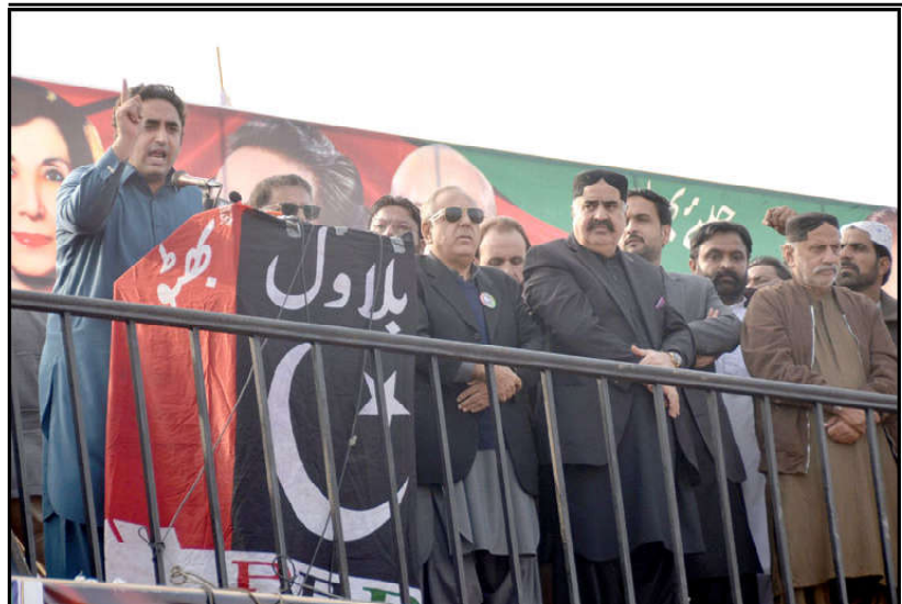
DERAALLAH YAR: Chairman of the Pakistan People's Party (PPP) Bilawal Bhutto Zardari addressing during political gathering

The PPP chief further said that he would build a university in Naseerabad besides giving youth card to the young people of the country to support them financially. While talking about the prevalent hunger in the country, he claimed that the hunger eradication program would be at the union council level so that no one sleeps hungry. "The public is no one's slave. The people of Balochistan have dignity and are brave. They do not bow down in front of anyone, they do not back down, and are not afraid either," he said. Bilawal vowed to form a PPP-led government, adding that the country needed the leadership of a party that was dedicated to serving the poor as opposed to the PML-N only served the rich.