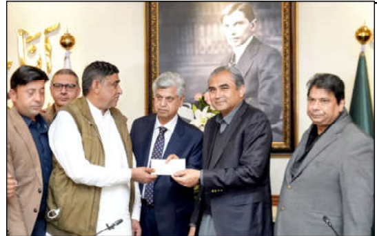
LAHORE: Caretaker Chief Minister Punjab Mohsin Naqvi presenting special grants cheques to President and General Secretaries of 44 Press Clubs.