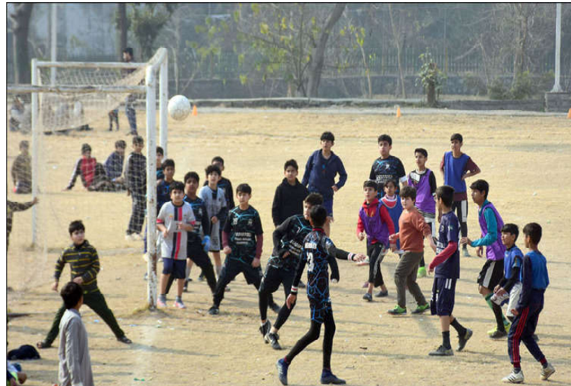
ISLAMABAD: Youngsters playing football match in a ground at sector G-10 in the Federal Capital.

They said, shielded by draconian laws, the Indian non-Kashmiri establishment, occupation forces, and bureaucracy have taken full control of the civil administration and judicial institutions in the territory, whereby people are arrested, tortured, and harassed with impunity. They denounced the inhumane behavior meted out to the Kashmiri political prisoners detained for demanding the right to self-determination, recognized by the United Nations and supported by the people of Jammu and Kashmir. Termining the ongoing resistance movement against the Indian illegal occupation as purely political and indigenous, the APHC leaders said the Indian imperialistic system of governance is dealing with the common masses with iron fists and trampling their fundamental rights through regular army.