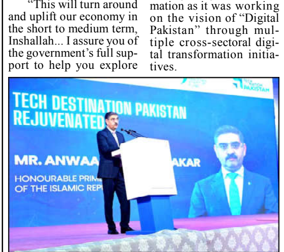
ISLAMABAD: Caretaker Prime Minister Anwaar-ul-Haq Kakar addresses the Tech Destination Pakistan Ceremony.

He said the government through its Digital Policy envisioned bringing economic prosperity and citizen empowerment through digital transformation as it was working on the vision of "Digital Pakistan" through multiple cross-sectoral digital transformation initiatives.