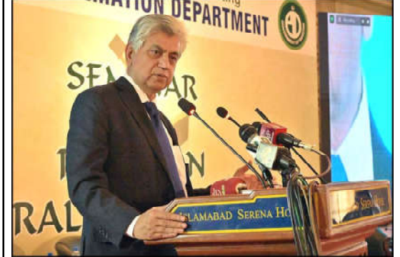
ISLAMABAD: Caretaker Federal Minister for Information & Broadcasting Murtaza Solangi addressing during a seminar on "Pakistan Election 2024: The Economic Reforms Agenda of Political Parties" organize by Press Information Department.

In a statement, he said that before leaving for his visit, Fazl ur Rehman took a briefing from various institutions.