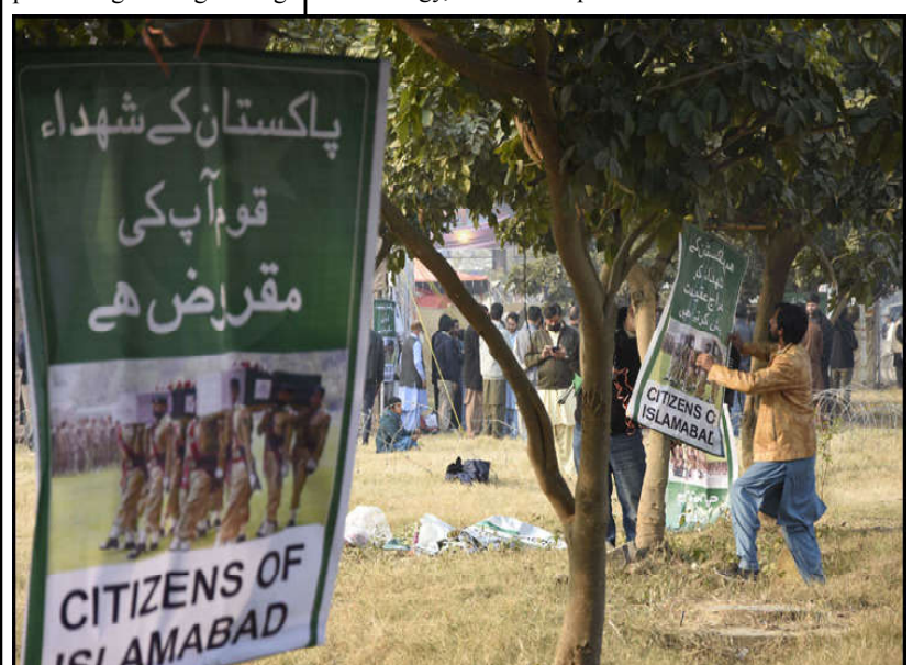
ISLAMABAD: A man is displayed banners in honor of Pak Army martyred on trees at a green belt along the road side at sector F-6 in Federal Capital.

ing points, waste collection points, water treatment, segregation of waste, and the pressing demands of a growing population. The consequences of these issues are profound, stressing the urgency of a united effort to secure energy, water, eco-tourism, agriculture & forestry and liquid & solid waste management resources and ensure sustainability for present and future generations.