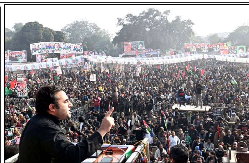
FAISALABAD: Peoples Party (PPP) Chairman, Bilawal Bhutto Zardari addresses to his supporters during public gathering meeting held at Hockey Stadium Tandlianwala in Faisalabad.