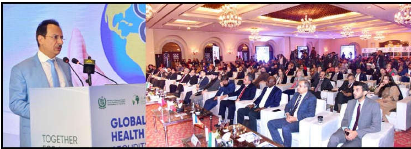
Caretaker Federal Minister for Health Dr. Nadeem Jan addressing closing ceremony of Global Health Security Summit in Islamabad.