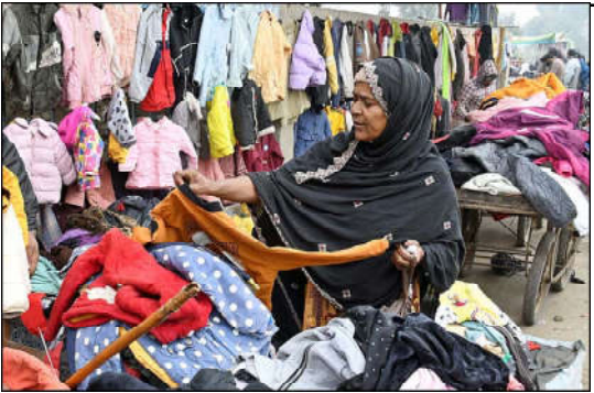
LARKANA: A woman busy is selecting used warm clothes at Old Bus Stand Road.