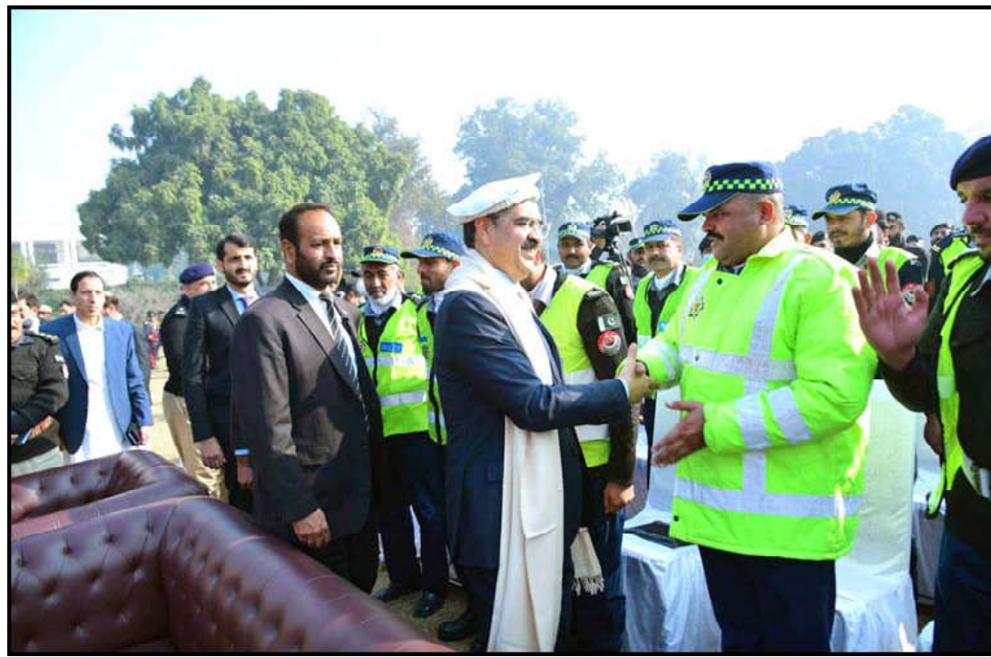
PESHAWAR: Caretaker Prime Minister Anwaar-ul-Haq Kakar interacts with KP Police officials after the Police Darbar Ceremony.