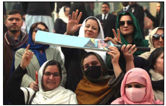
PESHAWAR: Tehreek-e-Insaf (PTI) Lawyers are celebrating after the Peshawar High Court verdict in favor of the party intra-party elections and electoral symbol of bat, at High Court in Peshawar.

He said that Ministry of Foreign Affairs and the ECP would provide information regarding the foreign media teams' arrival in Pakistan for election coverage.