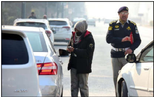
ISLAMABAD: A female traffic police officer is busy in issuing E-challan ticket to a driver for violating traffic rules at Jinnah Avenue.

by the users to get authentic information about its programmes. The BISP said, "The fake messages claim that the stipends of the beneficiaries have been approved, seek contact details for transferring amount or promise inclusion in the BISP programme and issuance of the stipends. "While the real messages from the BISP do not promise provision of any financial assistance without verification and documentation."