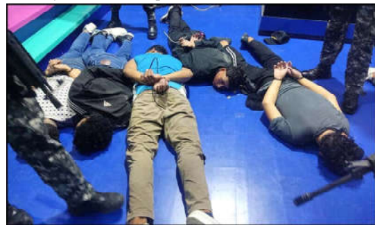
People accused of invading and taking over television station TC with weapons and forcing staff to lie and sit down, lie handcuffed on the floor in Guayaquil, Ecuador.