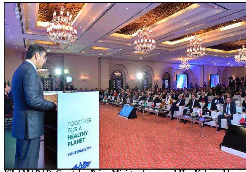
ISLAMABAD: Caretaker Prime Minister Anwaar-ul-Haq Kakar addresses the Global Health Security Summit.

and climate change could not be dealt with by a country alone. "New diseases, like COVID-19 and climate-induced incidents such as the historic floods of 2022 in Pakistan, are disrupting our citizens' health and causing social and economic impacts. While the developed world has systems in place to timely respond to such health emergencies, a similar ideal system is lacking in the developing world as health systems are relatively weak," he added. The prime minister said the COVID-19 pandemic had taught us invaluable lessons about the importance of collaboration, preparedness, and a unified response. "It is in this spirit that we convene today, not merely as representatives of our respective countries, but as overseers of global health security." He called for establishing a shared vision of the world where health security was not a privilege but a universal right and where the strength of a nation's health systems was measured not only by its capacity to respond to crises but also by its ability to prevent, detect, and mitigate health threats.