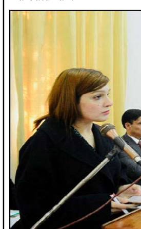
Special Assistant to Prime Minister for Human Rights and Women Empowerment Mushaal Hussein Mullick addressing a seminar on "US policies on the issues of Kashmir and Palestine" Organized by Area Study Center for Africa, North and South America, Quaid-e-Azam University in Islamabad.

During the meeting, the two leaders also agreed to increase mutual communication between Pakistan and the Islamic Emirates of Afghanistan and to bring peace and stability in the region. Maulana Fazlur Rahman is the first Pakistani leader to have met Mulla Haibatullah.