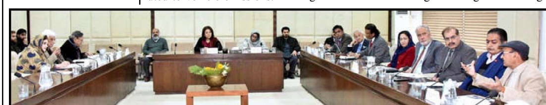
ISLAMABAD: Senator Seemee Ezdi, Chairperson Senate Standing Committee on Climate Change presiding over a meeting of the committee at Parliament House.

According to the district health officer (DHO), all four of them, who worked at the office, died due to gas leakage while they were asleep at night. Police shifted the bodies to hospital for the post-mortem.