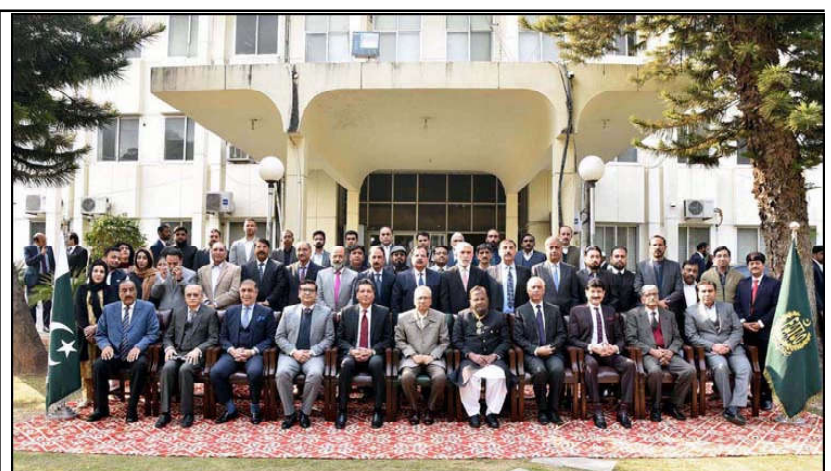
ISLAMABAD: President Dr Arif Alvi in a group photo with the officials of the Federal Tax Ombudsman (FTO) during his visit to FTO Office.

She pointed out the shifts in the United States policies towards Kashmir and Palestine, which, she said, were dictated by their own strategic interests rather than a steadfast commitment to democratic principles, human rights, and the right to self-determination.