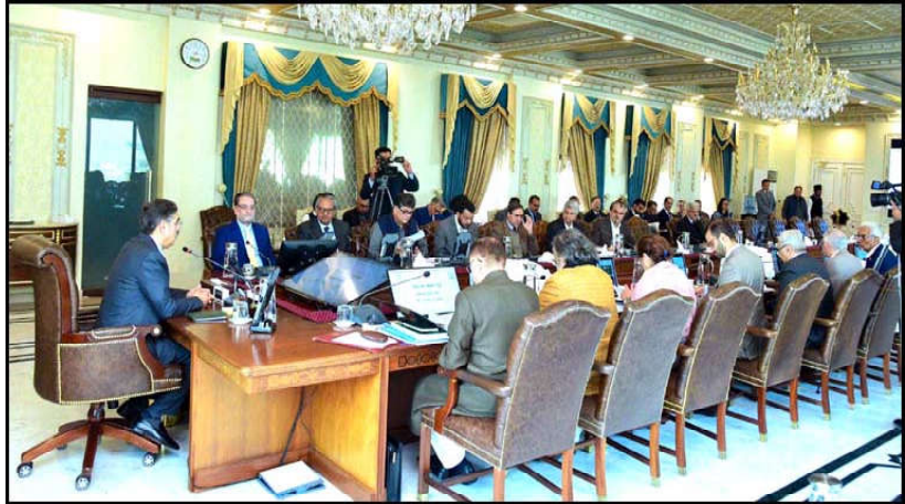
ISLAMABAD: Caretaker Prime Minister Anwaar-ul-Haq Kakar chairs a meeting of the Caretaker Federal Cabinet.

Vol. XIV No. 08 Reg. mails-B/ID-445 Thursday January 11, 2024, Jamadi-us-Sani 28, 1445 A.H. Ph: 2158688, 2158997 Pages 4: Rs. 12