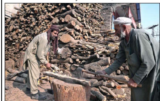
ISLAMABAD: Laborers cutting wood into pieces for selling purpose at his workplace in the Federal Capital.

After Lahore, he said, Business Facilitation Centers (BFCs) were in the final stages of completion in five major cities including Faisalabad. He said the success in election of the Federal Chambers was a manifestation of confidence of the business community in the leadership of UBG.