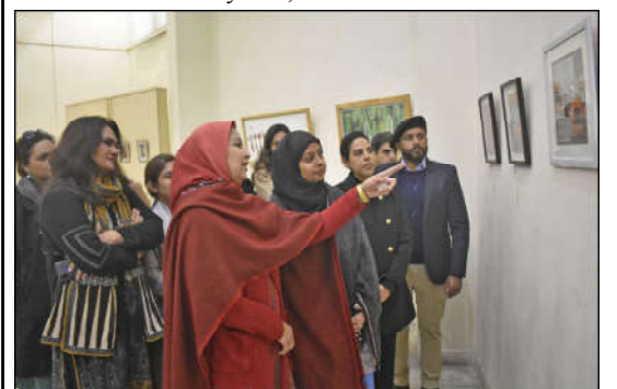
LAHORE: Visitors and staff are taking interest in the pictures during exhibition at Lahore College for Women University regarding the oppression on Palestinian people.

MIRPUR (AJK): (APP): Azad Jammu Kashmir Prime Minister Chaudhry Anwar ul Haq has taken strong notice of the recent cold-blooded murder of a young Kashmiri expatriate by unknown assailants near Islamabad international airport on his return from abroad. The AJK premier expressed his profound grief and sorrow over this tragic incident and extended his heartfelt condolences to the bereaved family. The Prime Minister has also directed the Chief Secretary of Azad Kashmir to contact the IG Punjab police to ensure early arrest of the absconding accused, according to an official handout issued here late Tuesday. It may be mentioned here that the slain youth, hailing from AJK's Dadyal town of expatriates in Mirpur district, was gunned down by unknown attackers near Islamabad international airport on his return from abroad.