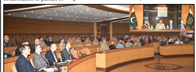
RAWALPINDI: A view of meeting of Trilateral Defence Collaboration between Pakistan, Saudi Arabia and Turkiye.

ustrial Collaboration during World Defence Show at Riyadh next month. The agreement reached at the third meeting of Pakistan-KSA Defence Collaboration at GHQ in Rawalpindi, said an Inter Services Public Relations statement Tuesday. The forum reiterated the need to explore further avenues for defence cooperation and enhancing the pace of collaboration. The meeting underscored the significance of historical relations between the two brotherly states. The participants discussed issues of bilateral interest and evolving security environment. The two sides deliberated upon rapid advancements in military technologies and the need for defence industrial cooperation between the two states.