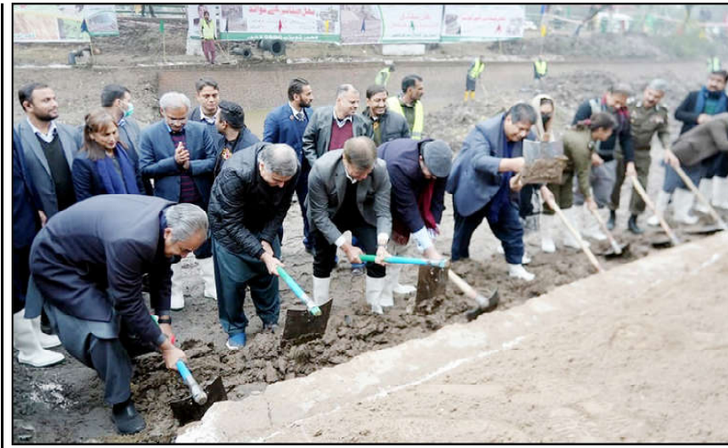
LAHORE: Caretaker Chief Minister Punjab Mohsin Naqvi along with provincial ministers and others high ups formerly inaugurates de-silting of Canals across Punjab.

been trained through LIMS as this drive would be continuously monitored through satellite images and NESPAK would also monitor it as a third party, he added. CM Naqvi mentioned that complaints have been received about the mixing of drainage water in the Lahore canal at some points, adding that a committee comprising MD WASA and DC would probe the matter, as it could not be allowed. He appealed to the citizens to avoid polluting the canal as the government could not do everything all alone.