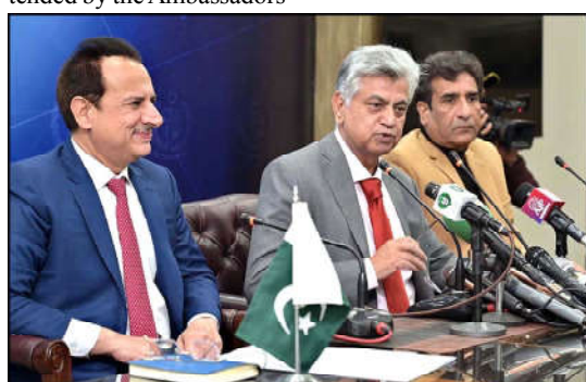
ISLAMABAD: Caretaker Federal Minister for Information and Broadcasting, Murtaza Solangi and Caretaker Federal Minister for Health Dr. Nadeem Jan addressing a press conference at PID Media Center.

PM Kakar also expressed deep appreciation for Pakistan's historic ties with the Southeast Asian countries, particularly Brunei, Indonesia and Malaysia.