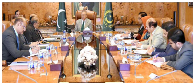
ISLAMABAD: President Dr. Arif Alvi chairing a meeting on implementing employment quota for Persons with Disabilities (PWDs) at Aiwan-e-Sadr.

The MQM-P will field its candidates on NA-231 and its provincial constitu-