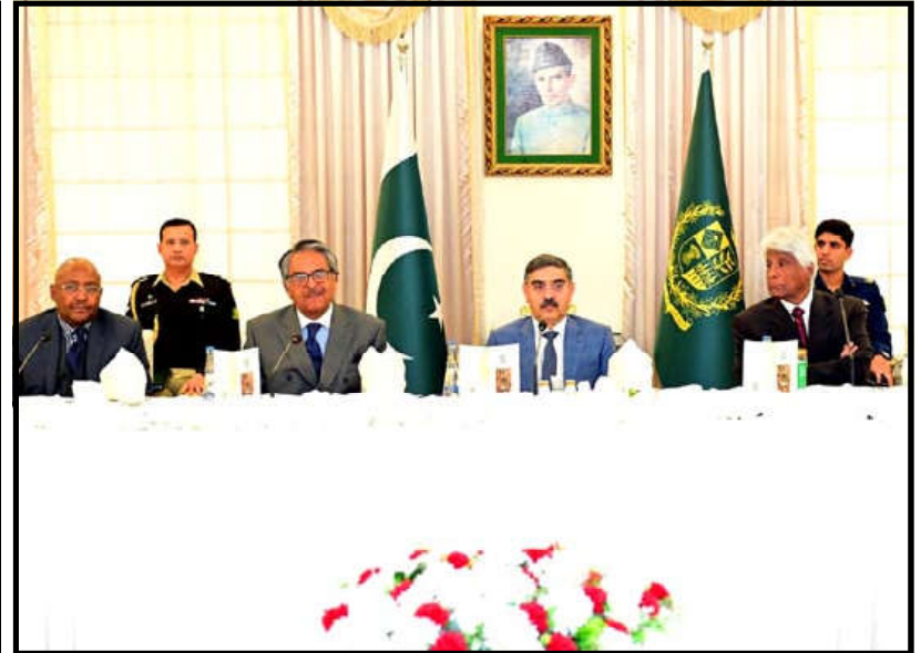
ISLAMABAD: Caretaker Prime Minister Anwaar-ul-Haq Kakar meets a group of Envoys from African and Asian Countries.

Asked about the precondition for dialogue, the prime minister referred to the abandonment of violence by militant groups and reiterated that being a nation of 240 million, Pakistan could not surrender to a few thousand individuals. Discussing the terrorist activities of TTP (Tehreek-e-Taliban Pakistan) and the Afghan government's response to Pakistan's reaction following the recent terrorist attack in D I Khan, he said communication with them was going on and some behavioral changes had been observed on the other side.