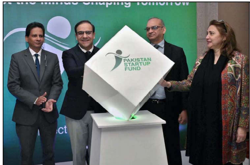
ISLAMABAD: Caretaker Federal Minister for IT & Telecommunication Dr. Umar Saif Launch Pakistan Startup Fund during ceremony organized by Ignite and Ministry of IT & Telecommunication.