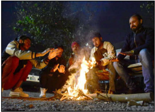
ISLAMABAD: Vendors sits around the fire along the road side to counter coldness during the extreme weather conditions of winters.

According to the details, the Federal Directorate of Education departmental promotion board meeting was held in which 509 teachers of FG and model setup have been promoted from grade 18 to 21.