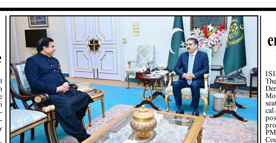
ISLAMABAD: Speaker National Assembly Raja Pervez Ashraf called on caretaker Prime Minister Anwaar-ul-Haq Kakar.

many innocent civilians mitted to its stance that it have been martyred by Iswill not accept Israel and raeli and Indian forces India until the Palestinian Israeli forces are not as well as Kashmiri people hesitant in targeting hospi- get an independent state as tals and schools, she menper UN resolutions.