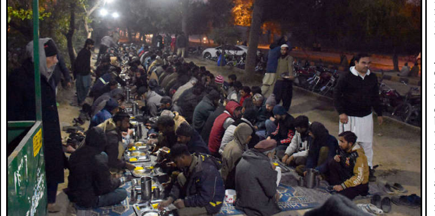
ISLAMABAD: Deserving people are eating dinner at free food distribution point at Sector G-8 as due to the extreme inflation the quantity of such deserv ing people are increasing day by day in Federal Capital.