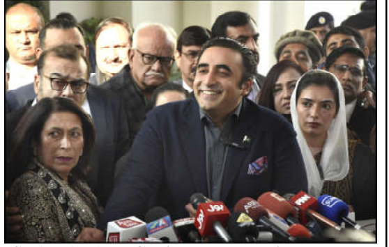
ISLAMABAD: Chairman PPP Bilwal Bhutto Zardari talking with media persons outside Supreme Court

Responding to a question, Bilawal asked if the words of a few senators have more weightage than