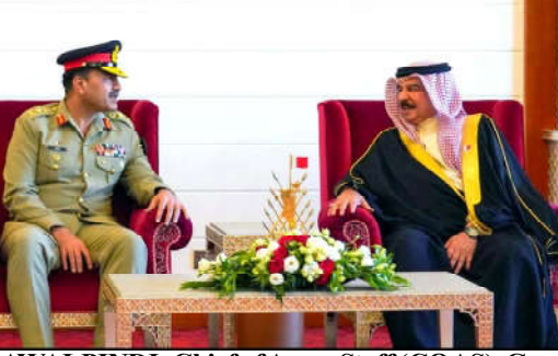
RAWALPINDI: Chief of Army Staff (COAS), General Asim Munir exchanging views with Hamad Bin Isa Bin Salman Al Khalifa, King of Bahrain during meeting held in Bahrain.

ism domains. King of Bahrain also conferred Military Medal During the meetings, matters of mutual interest Order of Bahrain First including bilateral military and security cooperation Class on COAS in recogniwere discussed. The dignition of his significant efforts taries lauded Pakistan and contributions to the Army's achievements in enhancement of bilateral fight against terrorism and ties between the two brothcontinued efforts for re- erly countries.