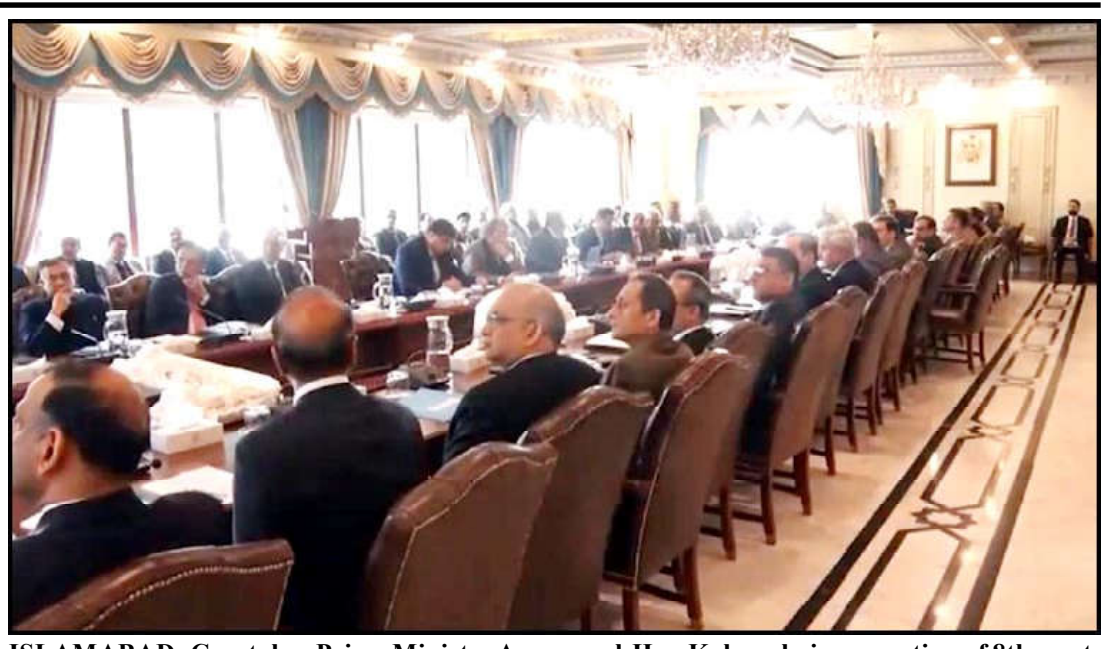
ISLAMABAD: Caretaker Prime Minister Anwaar-ul-Haq Kakar chairs a meeting of 8th meeting of Apex Committee of Special Investment Facilitation Council.

The PM directed all the stakeholders to vigorously plishment within stipulated timeframe. The COAS assured unwavering resolve of the Pakistan Army to sup-The meeting was attended by Chief of Army Staff port government's initiatives aimed at economic recov-