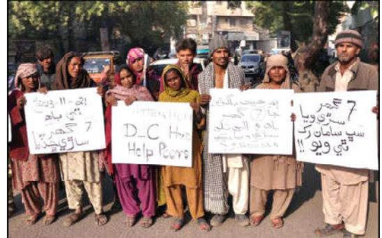
HYDERABAD: Residents of Gul Goth Muhammad Jakro are holding protest demonstration for acceptance of their demands, at Hyderabad press club.

the initiative requires skilled professionals in IT, mining engineering, and accounting. A request for relaxation in new recruitment has been sent to the Chief Minister's office. The minister highlighted the importance of digitalization for enhancing the corporation's efficiency, citing its profitability due to effective government strategies. He noted the positive impact of increased industrial salt prices on government revenue. Stressing the need for continued improvement, the minister instructed PUNJMIN to implement e-bidding and e-auction systems to curb corruption.