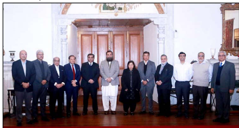
LAHORE: A delegation of the Federation of Pakistan Chambers of Commerce and Industry led by Federal Minister of Commerce and Industry, Gohar Ejaz, Federal Minister of Finance, Dr. Shamshad Akhtar and Provincial Minister of Industry and Commerce, S. M. Tanveer in a group photo with Governor Punjab Muhammad Balighur Rehman at Governor House.