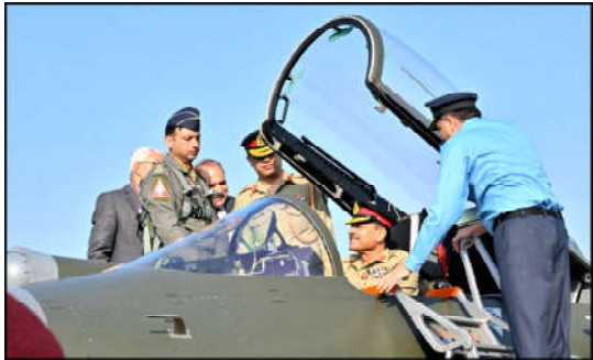
RAWALPINDI (Online): An Induction and Operationalization Ceremony was held at an operational base of Pakistan Air Force, today.

Lauds operational preparedness of PAF in incorporating state-of-the-art weapon systems