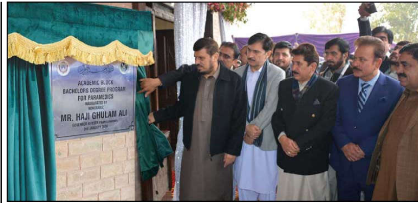
PESHAWAR: Khyber Pakhtunkhwa Governor Haji Ghulam Ali inaugurates academic block for Bachelors Degree Programme Paramedics at Zulfiqar Ali Bhutto Postgraduate Paramedical Institute.

courses, aimed at equipping them with skills beyond just information technology. Chief Minister outlined the program's definitive goal of providing training to at least five hundred thousand youth, ultimately facilitating their employment. He emphasized the clear roadmap established for the welfare of the youth, which will also serve as a helpful guide for the incoming government. As part of the programme, initially, over 0.1 million young individuals will undergo various courses, including IT, in addition to other fields.