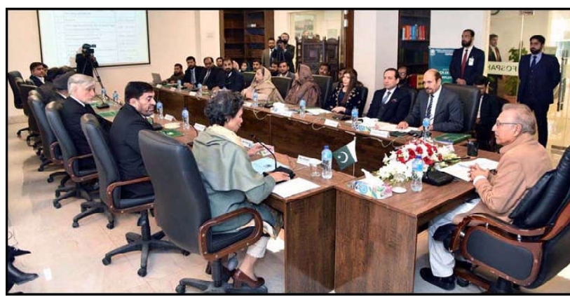
ISLAMABAD: President Dr. Arif Alvi chairing a meeting during his visit to the Federal Ombudsman Secretariat for Protection Against Harassment at Workplace (FOSPAP) Head Office.

while the rest had been decided. The President called for taking appropriate legislative measures at the federal and provincial levels to ensure the protection of women's property rights, besides discouraging the transfer of property by women to their family members due to pressures. He said that he was conducting personal hearings of the Ombudspersons' cases to expedite the process of justice. He stated that highlighting important decisions of FOSPAP in harassment and women's property cases through media would help increase awareness about the role of the Ombudsman. He said that police at the local level needed to improve their response to women's complaints in property cases, adding that police officials should be educated about the provisions of the Enforcement of Women's Property Rights Act, 2020.