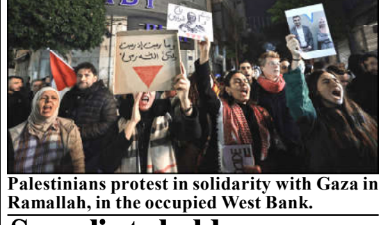
Palestinians protest in solidarity with Gaza in Ramallah, in the occupied West Bank.

Monitoring Desk DHAKA: Nobel peace laureate Muhammad Yunus was convicted on Monday of violating Bangladesh's labour laws in a case decried by his supporters as politically motivated. Yunus, 83, is credited with lifting millions out of poverty with his pioneering microfinance bank but has earned the enmity of longtime Prime Minister Sheikh Hasina, who has accused him of "sucking blood" from the poor.