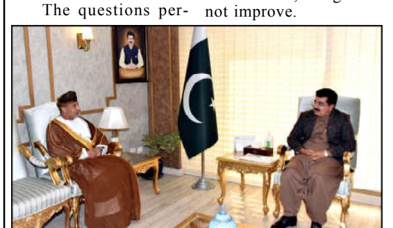
ISLAMABAD: Chairman Senate, Muhammad Sadiq Sanjrani exchanging views with Fahad Sulaiman Khalf Alkharusi, Ambassador of Sultanate of Oman during meeting held at Parliament House in Islamabad.

ISLAMABAD (APP): Caretaker Minister for Information and Broadcasting and Parliamentary Affairs Murtaza Solangi on Tuesday said that the issue of human trafficking would remain an insurmountable menace unless the overall economic situation of the country was improved benefiting the downtrodden masses who risk their lives for pursuing better future abroad through illicit means. He said that the state as per its capacity, was taking measures but the issue demanded a holistic and national approach towards it. "Unless the underlying issues are resolved, things will not improve." The questions pertaining to the government measures and their outcomes to curb the human of human trafficking were put to the floor by Senator Kamran Murtaza of Jamaat-e-Islam Pakistan (JUI-P). Senator Mushtaq Ahmed Khan of Jamaat-e-Islami Pakistan (JIP) and independent Senator Nuzhat Sadiq. Solangi noted that the Senators had raised important points, whereas the solution lied in the fact that the country had to fix its economy. He said that the state as per its capacity, was taking measures but the issue demanded a holistic and national approach towards it. "Unless the underlying issues are resolved, things will not improve."