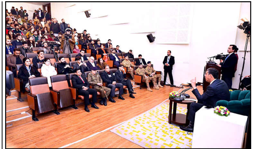
LAHORE: Caretaker Prime Minister Anwaar-ul-Haq Kakar in an interactive session with the students of Beaconhouse National University.