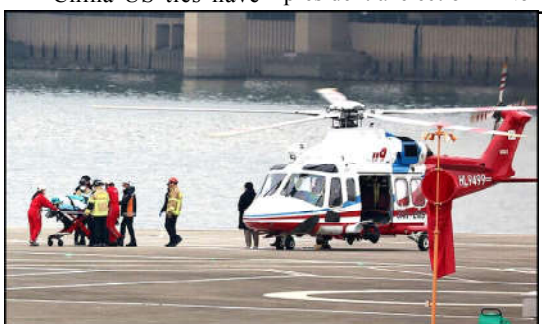
South Korean opposition party leader Lee Jae-myung, who was attacked in Busan, gets off from a helicopter on a stretcher to be transported to Seoul National University Hospital, at a heliport in Seoul.

Monitoring Desk TOKYO: A powerful earthquake that hit Japan on New Year's Day killed at least 48 people, with rescue teams struggling in freezing temperatures on Tuesday to reach isolated areas where many people are feared trapped under toppled buildings. In Suzu, a coastal town of just over 5,000 households near the quake's epicentre, 90 per cent of houses may have been destroyed, according to its mayor Masuhiro Izumiya. "The situation is catastrophic," he said. The quake with a preliminary magnitude of 7.6 struck on Monday afternoon, prompting people in western coastal areas to flee to higher ground as tsunami waves swept cars and houses into the water. Around 200 tremors were detected since the quake first hit on Monday, according to the Japan Meteorological Agency, which warned more strong shocks could hit in the coming days. A Coast Guard aircraft en route to deliver aid to the quake-hit region collided with a commercial aeroplane in Tokyo's Haneda airport on Tuesday, killing five Coast Guard crew while all 379 on board the Japan Airlines flight miraculously escaped a fire.