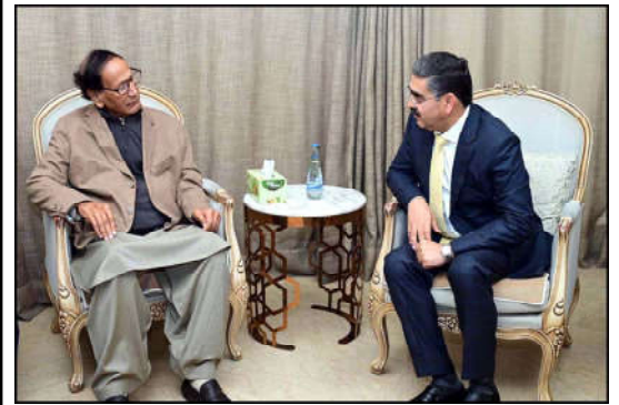
LAHORE: Caretaker Prime Minister Anwaar-ul-Haq Kakar meets with the President of Pakistan Muslim League (Q).

ISLAMABAD (APP): The Ministry of Health on Tuesday said that so far, no case of the JN.1 variant of Corona has been reported in any part of the country. According to the spokesperson of the ministry, a new variant of Corona, JN.1, Omicron, has been reported in some countries as per media reports, which is a matter of concern. The minister assured to proper implementation of the recommendations of international health regulations. Dr. Nadeem Jan said that there is an effective screening system at international airports at entry and exit routes of the country. Meanwhile, caretaker federal Minister for Health Dr. Nadeem Jan said that the government is continuously monitoring the situation as this subvariant of Omicron was found in some countries. He said that the risk of this variant spreading in Pakistan is very low, but caution is necessary. The minister assured to proper implementation of the recommendations of international health regulations. Dr. Nadeem Jan said that there is an effective screening system at international airports at entry and exit routes of the country.