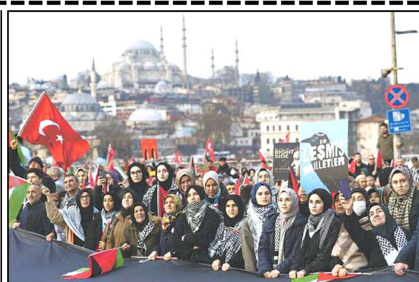
ISTANBUL: Tens of thousands of people demonstrate to show solidarity with the Palestinian people amid the Gaza crisis, at the Galata Bridge.

Monitoring Desk DHAKA: The United Nations will increase the food ration for each Rohingya refugee in Bangladesh by $2 a month, to $10 from Jan. 1, the World Food Programme (WFP) said on Tuesday, as it thanked donors for coming to the rescue of a cash-strapped effort. The United Nations had cut food aid last year to the refugees by a third, to $8 each every month, as it had raised less than half of the $876 million required to support them. Nearly a million members of the Muslim minority from Myanmar live in bamboo-and-plastic camps in Bangladesh's border district of Cox's Bazar, most of them having fled a military crackdown in 2017. The WFP cut the refugees' food entitlement to $10 from $12 in March, and further in June, to stand at $8 each a month, in the wake of a severe funding crunch.