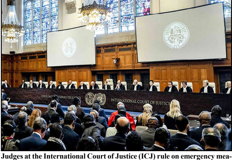
sures against Israel following accusations by South Africa that the Israeli military operation in Gaza is a state-led genocide, in The Hague, Netherlands.