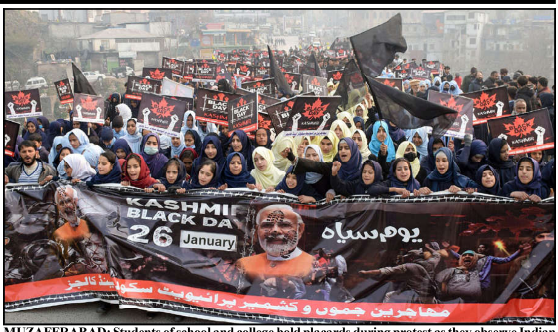
MUZAFFRABAD: Students of school and college hold placards during protest as they observe Indian Republic Day as Black Day during an anti-Indian protest in the city, to show their solidarity with people of Indian-administered Kashmir.