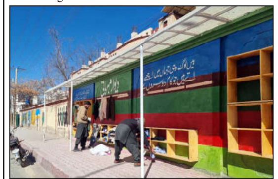
QUETTA: Needy people are taking warm clothes from Wall of Kindness (Divar-e-Meharabani), near Commissioner office in Quetta.

BEIJING (APP): China on Wednesday said it was ready to work with Pakistan to upgrade the China-Pakistan Economic Corridor (CPEC) and accelerate the building of an even closer China-Pakistan community with a shared future in the new era. "China stands ready to work with Pakistan to deliver on the important common understandings between the leaders of the two countries, deepen political mutual trust, and expand practical cooperation," Chinese Foreign Ministry Spokesperson Wang Wenbin said during his regular briefing on a question by APP correspondent.