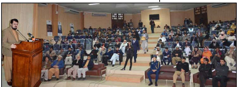
PESHAWAR: Khyber Pakhtunkhwa Governor Haji Ghulam Ali addressing the ceremony on the eve of World Education Day at Peshawar University.

The CEO said that the purpose of conducting pre-dengue season refresher training was to prepare oneself for anti-dengue measures.