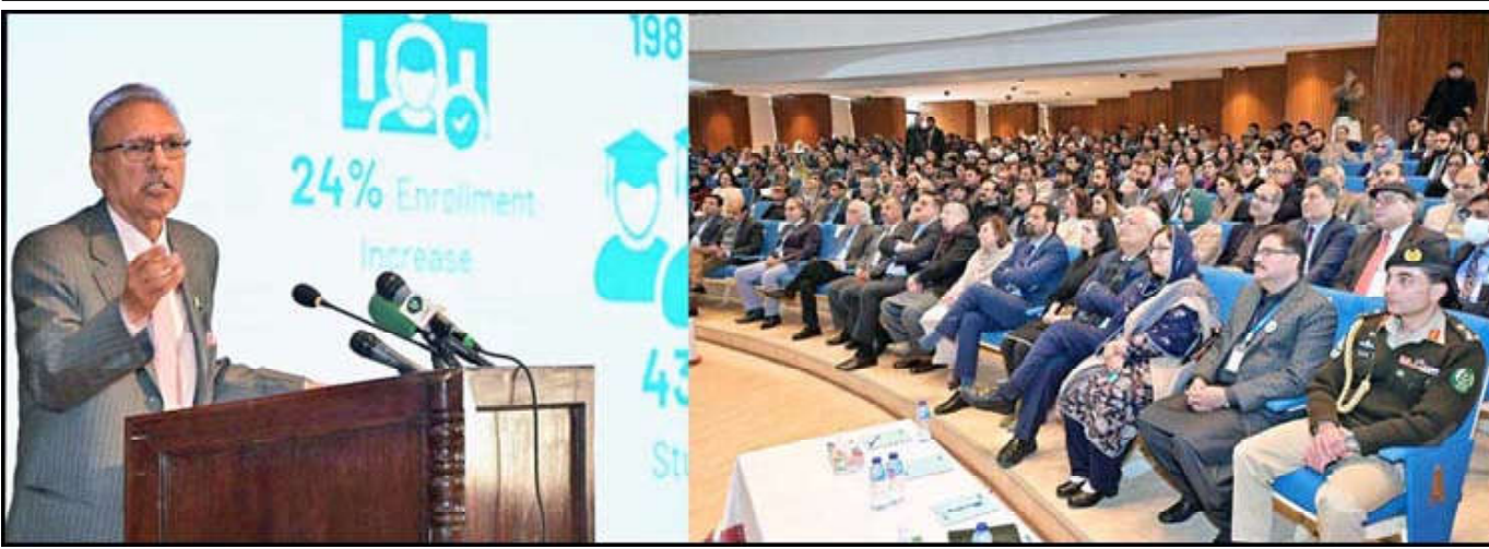
ISLAMABAD: President Dr Arif Alvi addressing a ceremony to commemorate the International Day of Education.