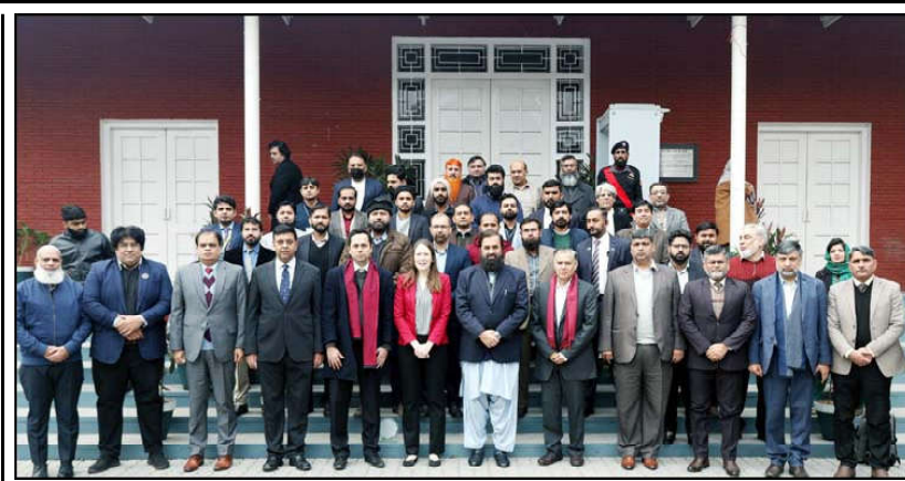
LAHORE: Governor Punjab Muhammad Balighur Rehman/Chancellor in a group photo with participants during the opening ceremony of 1 st Automotive Engineering Conference at University of Engineering and Technology.

He said that automotive industry is a flourishing industry in the world, which is providing employment opportunities to millions of people. Governor Punjab further said that electric vehicles are one of the important elements in shaping the future of the automotive sector. He said that in view of the challenges of climate change, the world is moving towards eco-friendly transport, and Pakistan is not an exception. Governor Punjab expressed hope that the researchers and experts involved in this conference will find different ways.