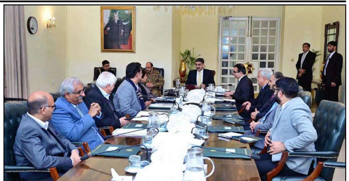
ISLAMABAD: Caretaker Prime Minister Anwaar-ul-Haq Kakar chairs a review meeting on reduction of the energy sector's circular debt.

Dr. Shamshad further stressed five critical areas of reforms essential to reducing Pakistan's vulnerabilities and fostering sustainable growth that included: