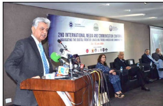
LAHORE: Caretaker Federal Minister for Information and Broadcasting, Murtaza Solangi addressing the Second International Media and Communication Conference at University of Management and Technology.

In the era of artificial intelligence, deep fake, cyber cloning, he said it had become difficult to bring the truth to people, Murtaza Solangi opined.