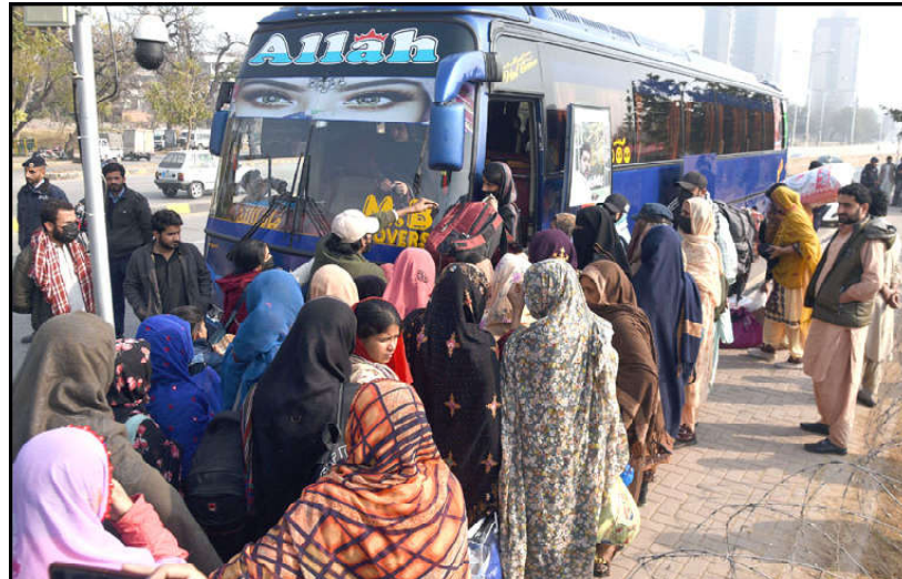
ISLAMABAD: Relatives of Baluchistan missing persons stands in a queue waiting for boarding in a bus after the finish Sitting protest (Dharna) in front of National Press Club in Federal Capital.