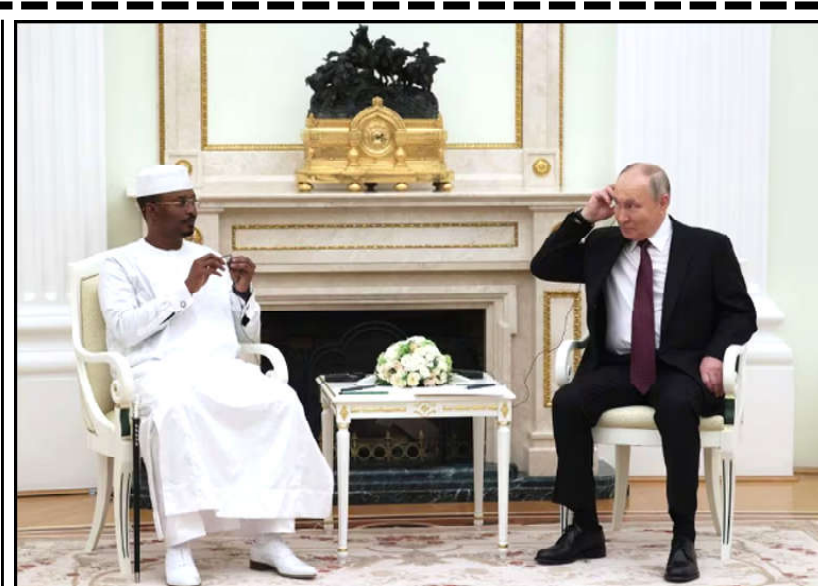
Russia's President Vladimir Putin and Chad's interim President Mahamat Idriss Deby attend a meeting at the Kremlin in Moscow, Russia.

In her speech, Haley insisted the race was "far from over" and told supporters that Democrats actually want to run against her former boss.