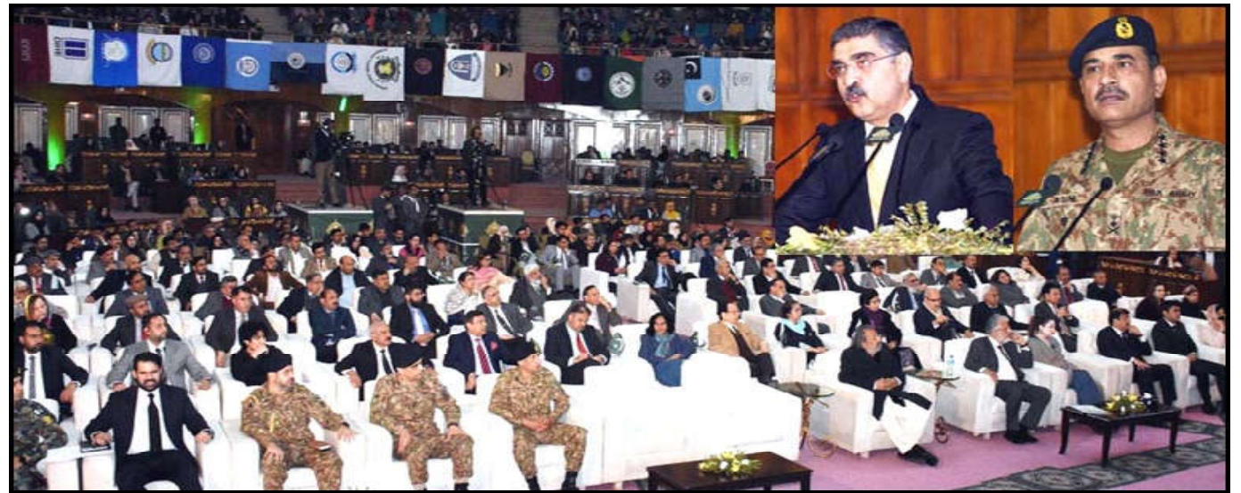
ISLAMABAD: Caretaker Prime Minister Anwaar-ul-Haq Kakar and Chief of the Army Staff General Syed Asim Munir addressing the participants of Pakistan National Youth Conference.

The COAS emphasized upon the importance of national unity and harmony to overcome multifarious challenges confronted by the country.