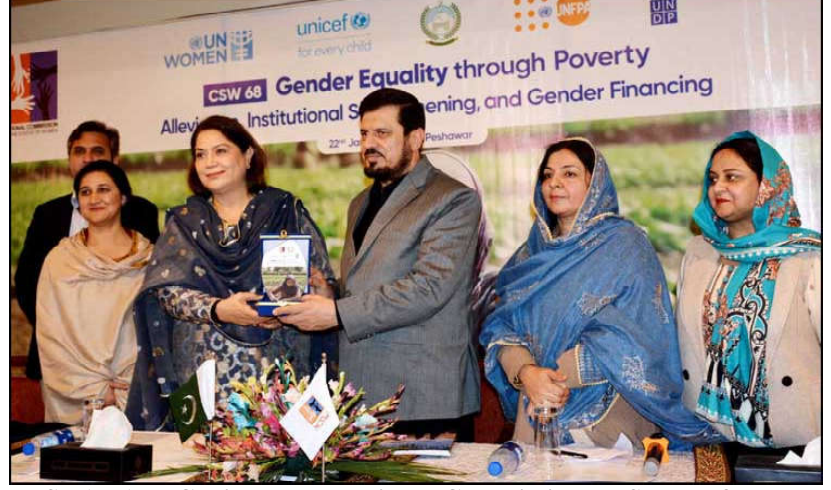
PESHAWAR: Chairperson, National Commission on Status of Women presenting shield to Khyber Pakthunkhwa Governor, Haji Ghulam during a function organized by the National Commission on Status of Women.

Khalid, Haji Tahir Sharif, Johar Town, Plot No. 71 in Wapda town and Plot