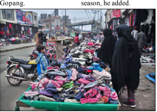
SARGODHA: Vendors displaying old shoes to attract the customers at his roadside setup.

Monday. During the period The wheat under review, wheat cultivation targets fixed for sowing had been completed over 23.69 the period under review were achieved by 107 per million acres as against the set targets of 22.22 cent as crop sowing in two major grain-producing provinces Sindh and Punjab gained momentum million acres, said Food Security Commissioner In the Ministry of as both the provinces National Food Security surpassed their assigned and Research Imtiaz Ali targets for the current season, he added