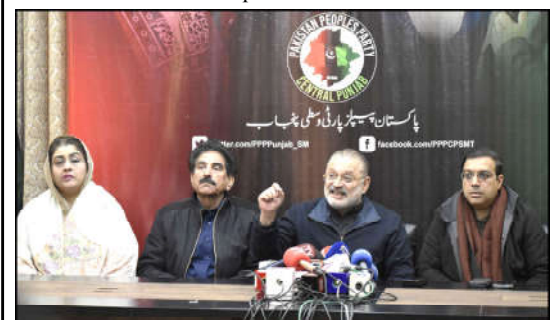
LAHORE: Leader of Pakistan People's Party Sharjeel Inam Memon addressing a press conference in Provincial Capital.

During the inspection, Chief Minister Naqvi project's status