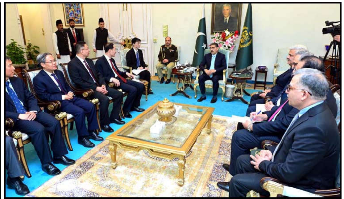
ISLAMABAD: Caretaker Prime Minister, Anwaar-ul-Haq Kakar exchanging views with Sun Weidong, Vice Foreign Minister of the Peoples Republic of China during meeting held in Islamabad.

(ISPR) news release, during the meeting matters of mutual interest and measures to further enhance bilateral defence cooperation were discussed