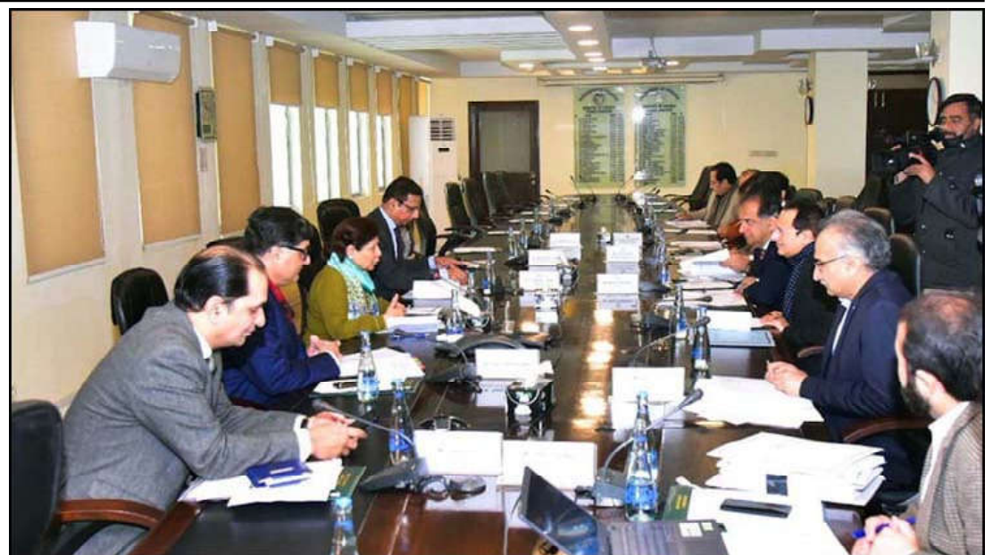
ISLAMABAD: Minister for Finance, Revenue and Economic Affairs, Dr. Shamshad Akhtar chairing a meeting on drugs pricing mechanism.

agriculture, and other sectors crucial for economic growth. The minister noted a monthly increase of one billion dollars in exports over the past three months, and with revised tariffs, he anticipated a doubling of the country's export figures. During his visit to various stalls at the Expo, Minister Gohar engaged with representatives from different companies who briefed him on their manufacturing processes. Gohar concluded his address by expressing optimism about Pakistan's promising economic