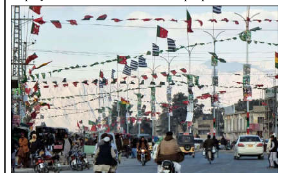
QUETTA: Banners and flags of different political parties has been placed on Sariyab road in connection of upcoming General Election 2024.

ISLAMABAD (APP): Three coal miners were reported trapped and unconscious on Friday due to purported gas emissions in a coal mine in the Dukki area of Quetta. According to a private news channel, a coordinated rescue operation led by the Chief Mines Inspector was underway to rescue the trapped coalminers. Rescue and District Administration officials have also reached the spot to facilitate the rescue operation.