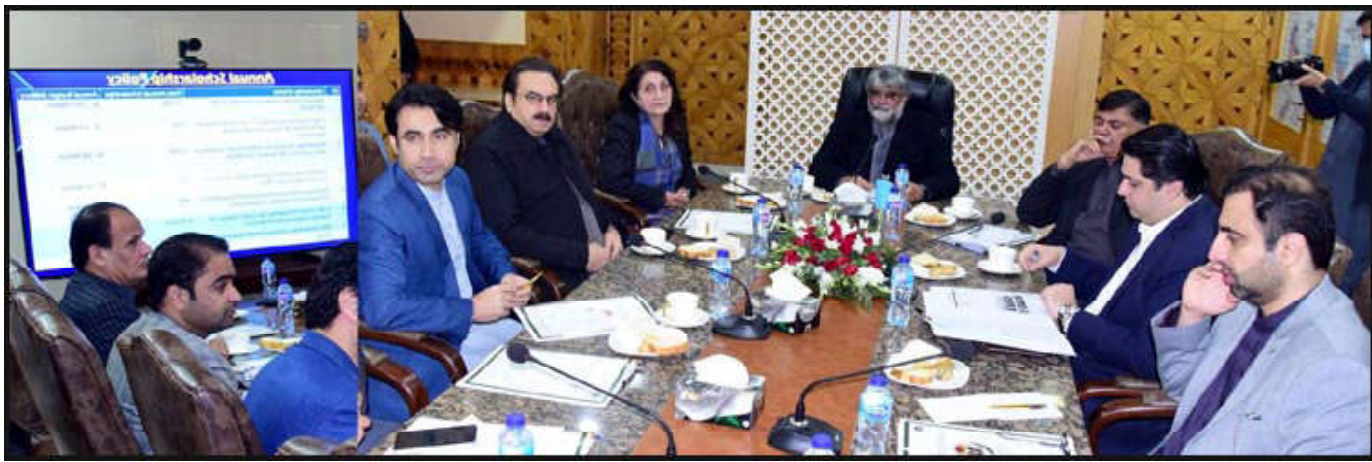
QUETTA: Caretaker Chief Minister Balochistan Mir Ali Mardan Khan Domki being briefed about Balochistan Education Endowment Fund