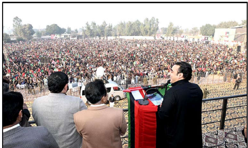
RAHIM YAR KHAN: Chairman PPP Bilawal Bhutto Zardari addressing the public gathering in in Liaquatpur.

The ECP specified any violation of code will be treated seriously and allegations made by one candidate against another will require confirmation from both sides before prosecution can commence.