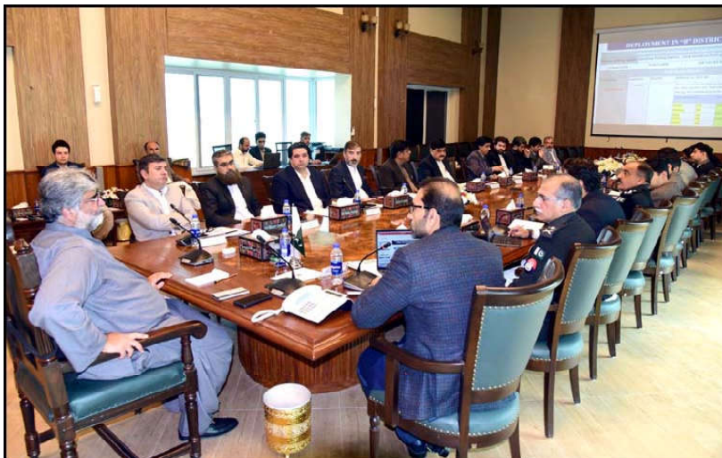
QUETTA: Caretaker Chief Minister Balochistan Mir Ali Mardan Khan Domki presiding over a high level meeting to review steps taken for holding of peaceful elections in the province

Antonio Guterres underlines that all security concerns between the two countries must be addressed by peaceful means in accordance with the principles of sovereignty, territorial integrity and good neighbourly relations.