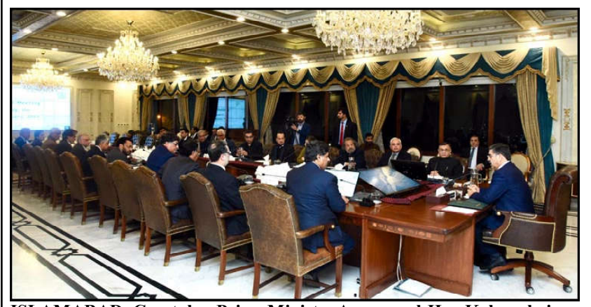
ISLAMABAD: Caretaker Prime Minister Anwaar-ul-Haq Kakar chairs a meeting of the Caretaker Federal Cabinet.