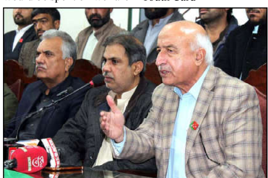
QUETTA: National Party's Chief Dr. Abdul Malik Baloch addressing press conference regarding upcoming election in Quetta Press Club.

He said that Rs300 billion being wasted on unnecessary ministries would be spent on welfare