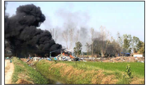
Smoke rising after an explosion at a fireworks factory near Sala Khao township in Thailand's Suphan Buri province.

It comes as Biden's re-election campaign, launched nearly nine months ago, revs up into general-election mode with hires across a series of the states where voting preferences can swing to either party. Since 1980, North Carolina has only backed one Democrat in a presidential election: Barack Obama in 2008. But Biden's loss there in 2020 was narrower than Obama's in 2012 and Hillary Clinton's in 2016.