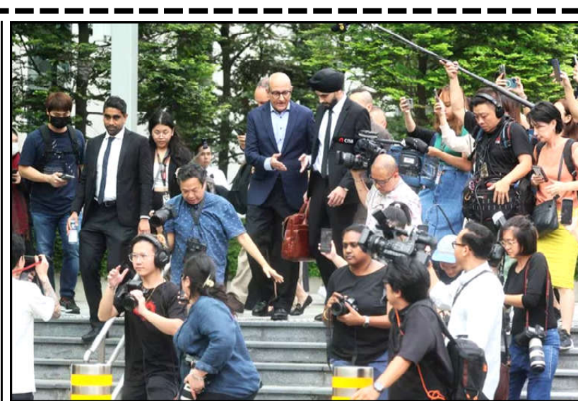
S. Iswaran, Singapore's former transport minister, arrives at the State Courts in Singapore.

SINGAPORE (AFP/APP): Singapore's transport minister has resigned his post after being charged with 27 offences in a corruption probe that has also ensnared a billionaire hotel tycoon. S. Iswaran was arrested in July of 2023 and released on bail in connection with a rare top-level graft investigation in the city-state.