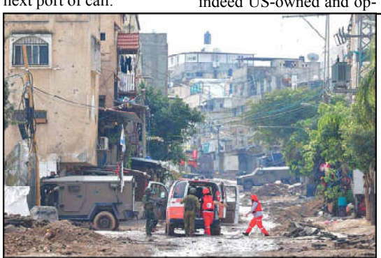
Israeli forces search a Red Crescent ambulance during a raid in Tulkarm, occupied West Bank.

Houthi spokesman Brigadier General Yahya Saree claimed responsibility for the attack in a televised address, naming the vessel as the US-owned Genco Picardy. "The naval forces of the Yemeni Armed Forces carried out a targeting operation against the American ship... in the Gulf of Aden... leaving direct hits," Saree said. He reiterated that Yemeni armed forces "will not hesitate to target all sources of threat in the Arab and Red Seas within the legitimate right to defend dear Yemen and to continue supporting the oppressed Palestinian people."