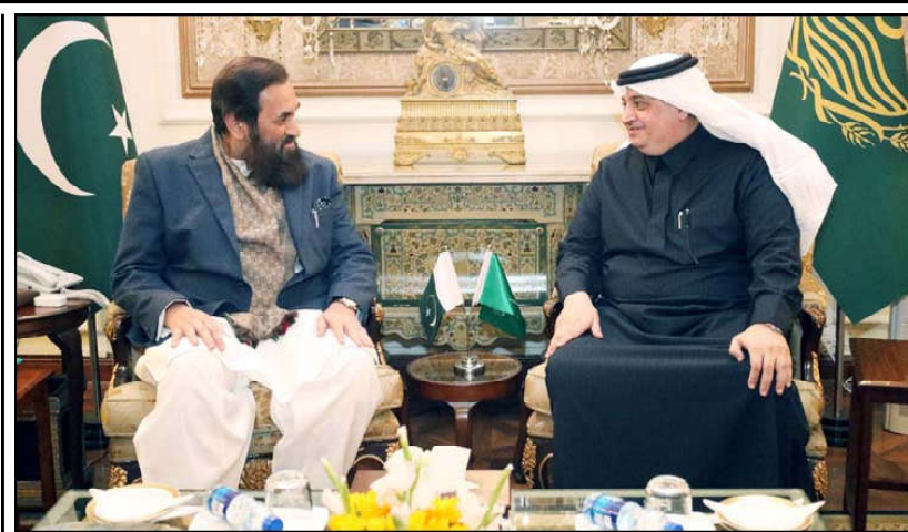
LAHORE: Saudi Ambassador Nawaf Bin Saeed Ahmad Al-Malki called on Governor Punjab Muhammad Balighur Rahman at Governor House.