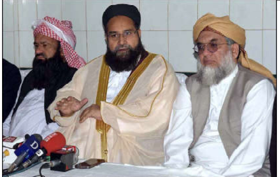
LAHORE: Special Assistant to Prime Minister Allama Tahir Ashrafi talking to the media at Jamia Islamia Manzoor Cantt.

On this occasion, Punjab Governor Muhammad Balighur Rehman and the Saudi Ambassador also discussed the situation in Pakistan and Saudi Arabia. He said that Saudi companies are also investing in semiconductors, which are the basis of all technologies. He said that Pakistani universities are providing quality education in medical and various other disciplines. He said that Pakistani doctors are known for professional competence all over the world. He said that Saudi students should come to study in Pakistani universities.