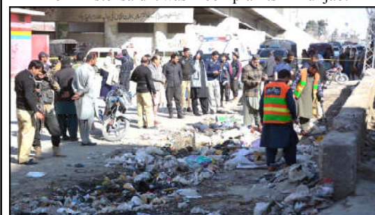
QUETTA: Security personal examine blast site. Nine people, including a traffic policeman and three children, were injured in a blast on Quetta's Zarghoon Road. Explosive material was planted in a heap of trash that had been lying for some time.

He said that many political parties had complaints about the level playing field. The Pakistan Muslim League-Nawaz was complaining of a lack of level playing field in Sindh and the Pakistan Peoples Party had same complaints in Punjab.