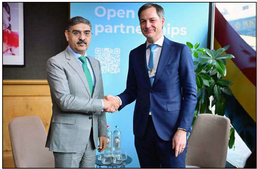
DAVOS: Caretaker Prime Minister Anwaar-ul-Haq Kakar meets the Prime Minister of Belgium Alexander De Croo on the sidelines of the World Economic Forum.