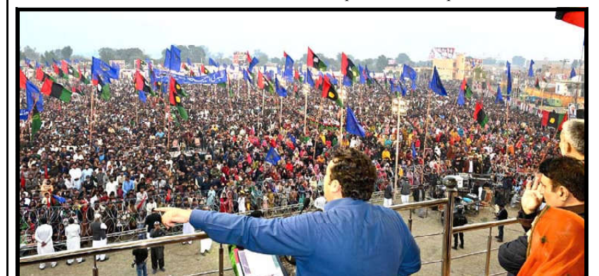
SANGHAR: Peoples Party (PPP) Chairman, Bilawal Bhutto Zardari addresses to his supporters during public gathering meeting in connection of General Election 2024 coming ahead, in Sanghar.