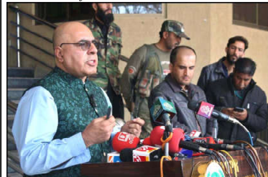
QUETTA: Caretaker Information Minister of Balochistan Jan Achakzai addresses press conference.

He also referred to the dharna being staged by the heirs of martyrs who embraced martyrdom for the cause of country in Islamabad and said that he witnessed lot of love for people of Balochistan and Balochs in Islamabad.