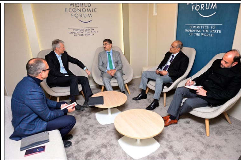
CEO of CocaCola Company, James Quincey calls on Caretaker Prime Minister Anwaar-ul-Haq Kakar on the sidelines of the World Economic Forum in Davos.

In the meeting, the Prime Minister highlighted the steps taken by the government to facilitate business and investment in Pakistan.