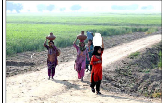
LARKANA: Women and girls on the way back to their homes after filling water in pots.

that under the Urban Transport Package-II, consultancy services are under process to develop Sustainable Urban Mobility Plans (SUMPS) for three major cities of the province including Peshawar, Abbottabad and Mingora. Sustainable Urban Mobility Plans (SUMPS) will have concept designs of priority urban mobility projects for aforementioned cities. The participants were also informed about different options for Bus Rapid Transit (BRT) service in Abbottabad on the model of BRT project of Peshawar.