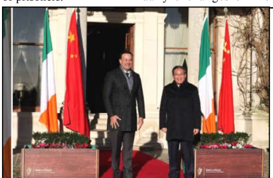
Chinese Premier Li Qiang and Ireland's Taoiseach, Leo Varadkar meet at Farnleigh House, in Phoenix Park, Dublin, Ireland.

shire later in the day, Trump said he planned to attend daily court proceedings in the "phony" case in New York over the next several days, while continuing campaigning. "Early in the morning I go to a Biden witch hunt," Trump said in the northeastern state, which will hold the nation's second presidential nomination contest next Tuesday. "And then I come here in the afternoon, and I stop, we make speeches and we get the votes." The shocking defamation case, which would likely once have been enough to wreck any politician's career, has had no visible impact on Trump's bid to retake the White House—and if anything is boosting his standing with his party's right wing. Carroll, 80, is seeking more than $10 million in damages in the civil trial.