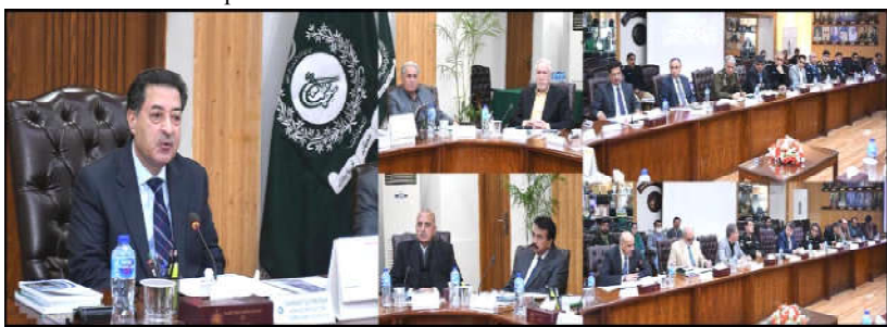
ISLAMABAD: Chief Election Commissioner, Mr. Sultan Raja, presiding over a meeting on General Elections at ECP Secretariat.

He highlighted that the caretaker government would publish a white paper on its 4.5 months performance. "We did introduce and revamp the programme within taxation system, we brought structural changes that would be passed through the Cabinet formerly by the end of the month, after that it would be in place as policy." Further, he said the caretaker government opted for aggressive privatization, it cut its expenditures at the federal level and it was also carrying out talks with the provinces so they could rationalize their expenditures.