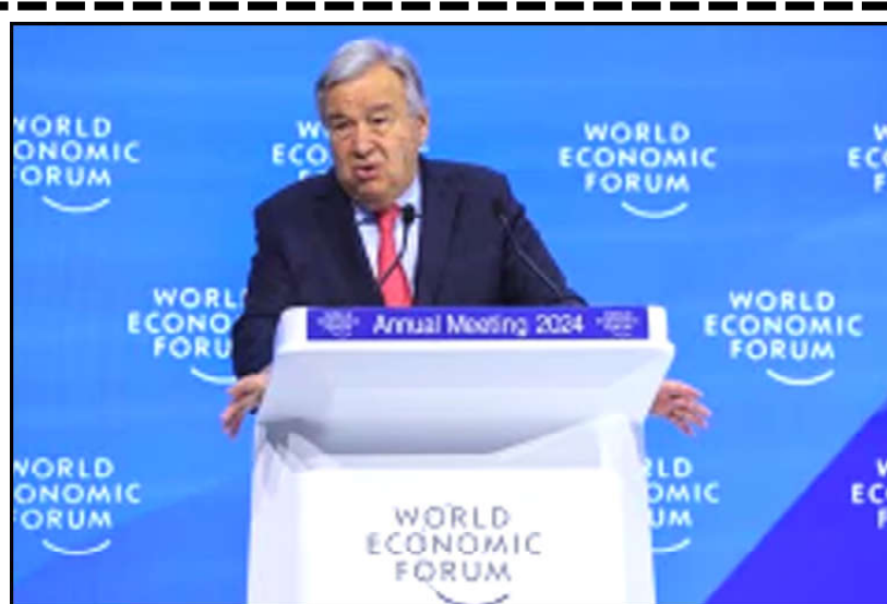
UN Secretary-General Antonio Guterres attends the 54th annual meeting of the World Economic Forum in Davos, Switzerland.

across the Blue Line as well, warning of potential broader escalation affecting regional stability. "Stop playing with fire across the Blue Line, de-escalate, and bring hostilities to an end in accordance with (relevant) Security Council resolutions," he said. The Blue Line refers to the border demarcation between Israel and Lebanon, established by the United Nations in 2000 following the withdrawal of Israeli forces from southern Lebanon. Earlier this month, Israel carried out a drone strike across the Blue Line to kill Hamas's deputy chief Saleh Al Arouri, leading to regular clashes across the border.