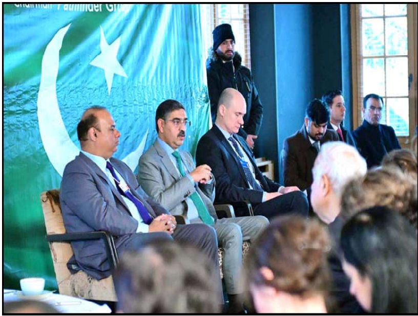
DAVOS: Caretaker Prime Minister Anwaar-ul-Haq Kakar addressing the Pathfinder's Pakistan Breakfast meeting held on the sidelines of the World Economic Forum.

Ph: 2841470/2841473 Vol: XIX No. 07, Rajab 06, 1445 AH Thursday January 18, 2024, Pages 04, Price Rs.15