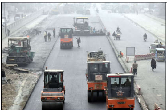
LAHORE: Labourers are busy in construction work of Sagian Road with the help of heavy machinery in the Provincial Capital.

It was said that 1750 kanal land has been acquired for phase I and allotment of 3434 plots has been done. The meeting was informed that appropriate measures have been taken to prevent flooding and private sector has been involved for investment in the mega housing scheme.