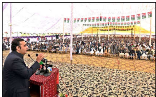
LARKANA: Chairman Pakistan People's Party Bilawal Bhutto Zardari addressing to Party workers Gathering at Bhutto House Naudero.

"No one has any sense or concern about the worsening situation of the country," the PPP scion said, adding that terrorists were raising their heads again. "They have been invited to come and settle in Karachi," he added. Read Bilawal says only an arrow can be used to hunt a lion. Bilawal stated that the current political climate in Pakistan has proved detrimental to the wellbeing of the country, adding that political instability will damage the country, economy, the federation and also the entire governance system.