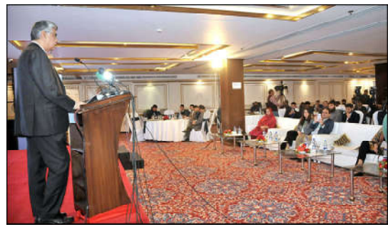
Identification". The minister opined that probably lack of a strong local government system was prohibiting innovative local solutions. However, he said that the problems were often identified in isolation by