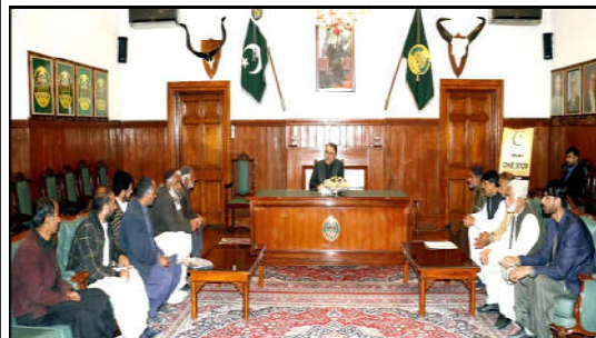
QUETTA: A delegation of BNP meeting with Governor Balochistan Malik Abdul Wali Khan Kakar

The committee is responsible for identifying and prosecuting the culprits according to relevant laws, presenting charges in appropriate courts, and recommending measures to prevent similar incidents in the future. After extensive hearings last week, a three-member bench of the Supreme Court, led by Chief Justice of Pakistan Qazi Faez Isa, upheld the Election Commission of Pakistan's decision to invalidate the PTI's electoral symbol 'bat' and declared its intra-party polls as "unconstitutional."