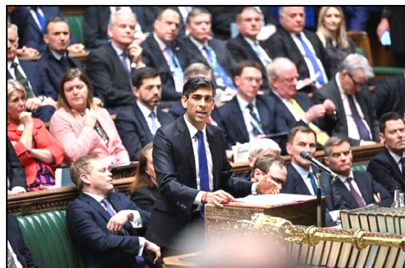
Britain's Prime Minister Rishi Sunak delivers a ministerial statement in the House of Commons, in London, Britain.

The Florida governor and Trump's other main rival — former UN ambassador Nikki Haley — were locked at 21 and 19pc respectively.