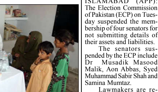
Doctor examining the patients at free medical camp established by Pakistan Navy at Kappar village

PESHAWAR (INP): Jamiat Ulema-e-Islam-Fazal leader Hafiz Hamdullah on Tuesday claimed that JUI-F is 'barred' from carrying out the election campaign in Khyber Pakhtunkhwa ahead of the general election 2024. "Pamphlets are being distributed in KP with warnings not to allow JUI-F corner meetings," Hafiz Hamdullah said while exclusively talking to a news channel. The JUI-F leader said the security situation is not ideal in KP, JUI-F candidates cannot go outside for election work in the evening.