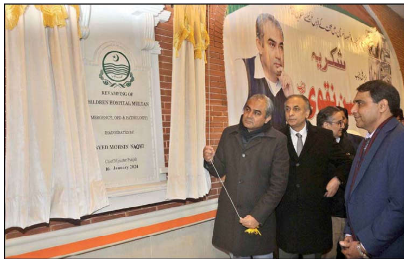
MULTAN: Caretaker Chief Minister Punjab Mohsin Naqvi unveiling the plaque to inaugurate the Revamping of Children Hospital Emergency, OPD & Pathology blocks during his visit.