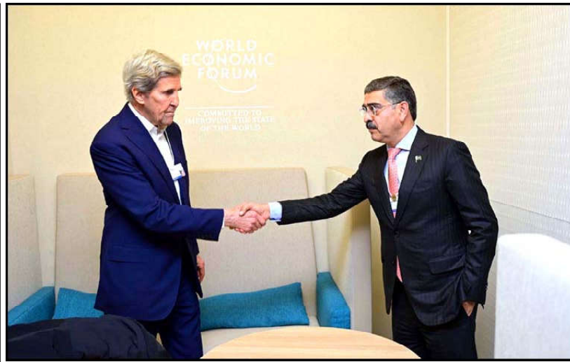
DAVOS: Caretaker Prime Minister Anwaar-ul-Haq Kakar meets U.S. Presidential special envoy on Climate John Kerry on the sidelines of the World Economic Forum.