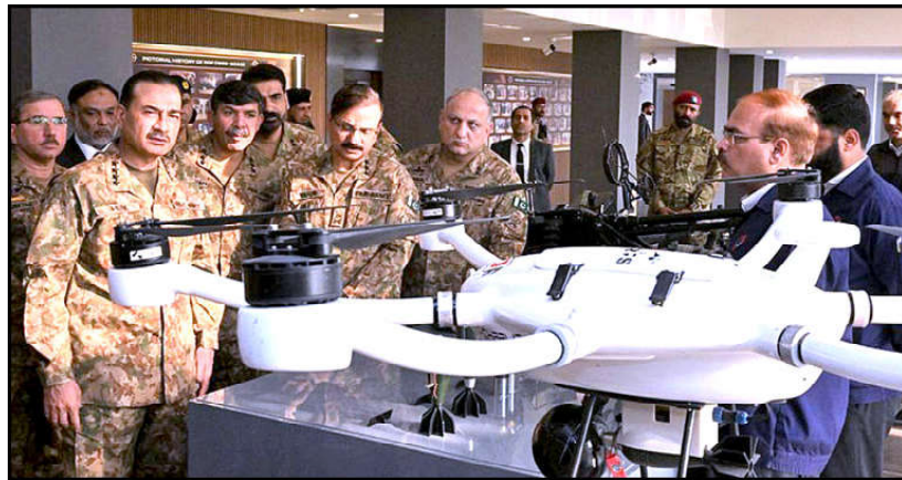
WAH: General Syed Asim Munir, NI (M), Chief of Army Staff (COAS) visits Pakistan Ordnance Factories (POF) Wah.

"The path to national progress is defined by indigenous and local industries like POF Wah. We will continue to work for self-reliance and the adoption of the latest technology, which is essential towards ensuring reliability and strengthening the defence of Pakistan," remarked the army chief. Gen Munir's visit highlighted the military's commitment to promoting self-sufficiency and technological advancement in the defence sector. The COAS emphasised the need for continuous efforts to enhance the capabilities of indigenous defence industries, aligning with the broader goal of ensuring Pakistan's defence is built on reliable and cutting-edge technology.