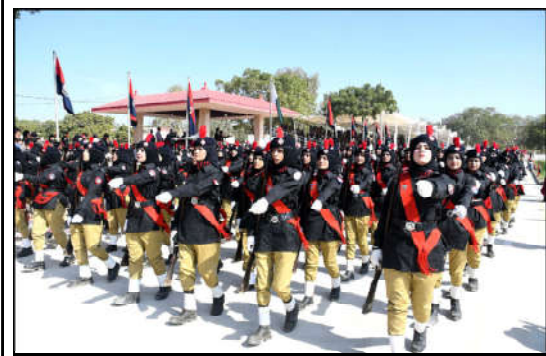
KARACHI: Female police march during the passing-out ceremony at Saeedabad Police Training Centre, in Provincial Capital.

The bench, headed by Justice Aalia Neelum, heard the post-arrest bail petition and reserved the verdict on conclusion of arguments by the parties.