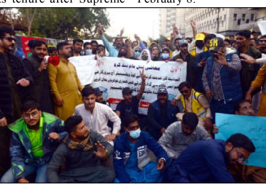
KARACHI: Lady Health Workers and vaccinators of Expanded Programme on Immunization (EPI) are holding protest demonstration for acceptance of their demands, at Karachi press club.

The counsel for federal government argued the said matter is pending hearing in Supreme Court (SC) too. SC has given order to hold election. Election schedule has been issued. The elections are going to be held on