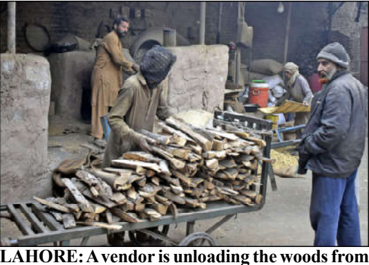
handcart to use as fuel at traditional mud oven at Misri Shah area of the Provincial Capital.