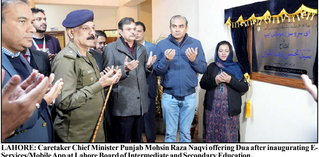
Services/Mobile App at Lahore Board of Intermediate and Secondary Education.

contests. One of the highlights of this year's event is the active participation of female teams in various