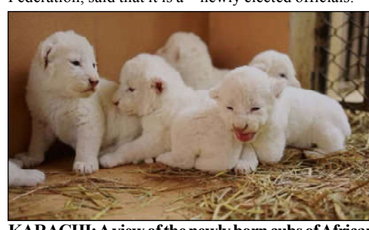
KARACHI: A view of the newly born cubs of African Lioness at Zoo in Provincial Capital.

luncheon was also organized in honor of the newly elected body of Lahore Press Club. Shields Private Nursing Colleges were also presented to the newly elected officials