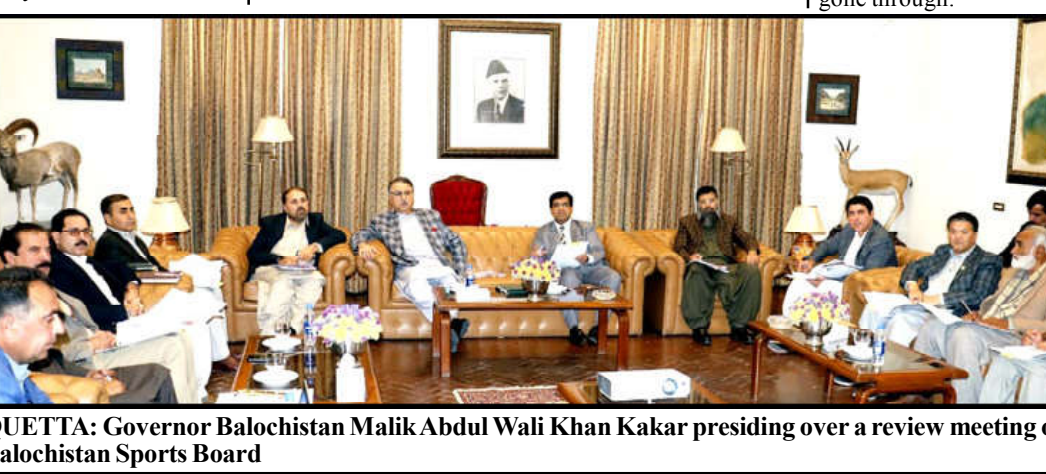
QUETTA: Governor Balochistan Malik Abdul Wali Khan Kakar presiding over a review meeting of Balochistan Sports Board

Meanwhile, certain important decisions were made following different suggestions and recommendations in the meeting