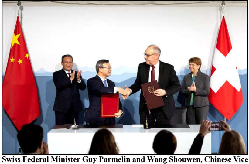
Minister of the Ministry of Commerce shake hands after signing a joint statement of the free trade agreement, next to Swiss President Viola Amherd and Prime Minister of the People's Republic of China, Li Qiang during an official visit in Kehrsatz near Bern, Switzerland.

Wang warned, "seriously threatens the well-being of Taiwan compatriots, seriously harms the fundamental interests of the Chinese nation, and seriously jeopardises peace and stability in the Taiwan Strait region". Anyone trying to split apart China's territory would be "harshly punished", he warned, after the island chose Lai Ching-te, seen as a dangerous by ruling Communist Party, as president. Beijing that claims Taiwan as its territory but has never renounced force to bring it under its control responded to Lai's election.