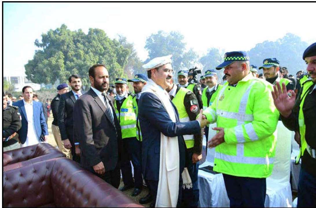
PESHAWAR: Caretaker Prime Minister Anwaar-ul-Haq Kakar interacts with KP Police officials after the Police Darbar Ceremony.

He said the PPP had already introduced Benazir Income Support Programme (BISP) for downtrodden segments of society.