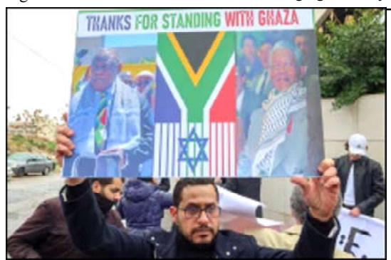
A demonstrator holds a sign during a protest as judges at The International Court of Justice (ICJ) in the Hague, hear a request for emergency measures to order Israel to stop its military actions in Gaza, in Amman Jordan.

The statement emphasized that Lula has been making efforts in the international community for a ceasefire, the liberation of Hamas-held hostages, and the creation of humanitarian corridors to protect Palestinian civilians. "The Brazilian government reiterates its defense of the two-state solution, with an economically viable Palestinian state living side by side with Israel, in peace and security, within mutually agreed and internationally recognized borders."