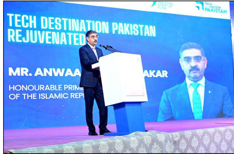
ISLAMABAD: Caretaker Prime Minister Anwaar-ul-Haq Kakar addresses the Tech Destination Pakistan Ceremony.