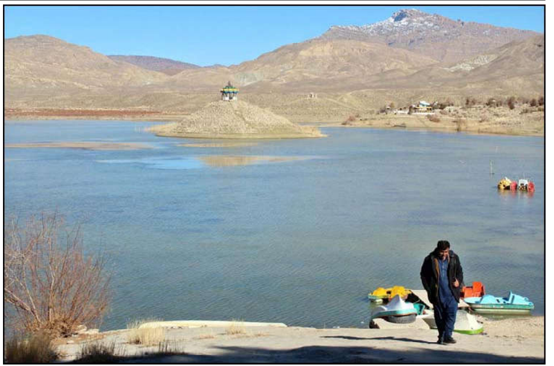
QUETTA: Hanna Lake Quetta presenting a panoramic view after refilling in recent light snowfall.

other initiatives for the IT sector. With over 90% Teledensity, Pakistan was recently ranked as the 2nd most financially attractive destination in the world for offshore outsourcing of IT and IT-enabled Services (ITeS). Pakistan was also ranked as the third most popular country for freelancing," he said. Prime Minister Kakar said the Special Investment Facilitation Council (SIFC) and its various committees had already started to deliver and perform their role in an active manner. "Among other priority sectors, the inclusion of IT Sector under the umbrella of SIFC demonstrates the commitment of our government to further promoting the ICT industry.