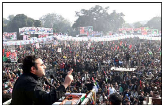
FAISALABAD: Peoples Party (PPP) Chairman, Bilawal Bhutto Zardari addresses to his supporters during public gathering meeting held at Hockey Stadium Tandlianwala in Faisalabad.