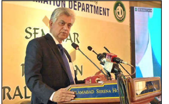
ISLAMABAD: Caretaker Federal Minister for Information & Broadcasting Murtaza Solangi addressing during a seminar on "Pakistan Election 2024: The Economic Reforms Agenda of Political Parties" organize by Press Information Department.

In a statement, he said that before leaving for his visit, Fazl ur Rehman took a briefing from various institutions.