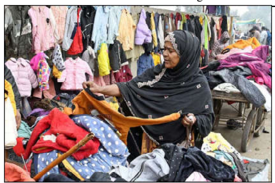
LARKANA: A woman busy is selecting used warm clothes at Old Bus Stand Road.

Responding to the points, Governor KP Haji Ghulam Ali while expressing his agreement to the call extended support for imposition of ban on these products with the purpose of protecting public health, especially youth.