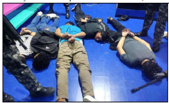
People accused of invading and taking over television station TC with weapons and forcing staff to lie and sit down, lie handcuffed on the floor in Guayaquil, Ecuador.