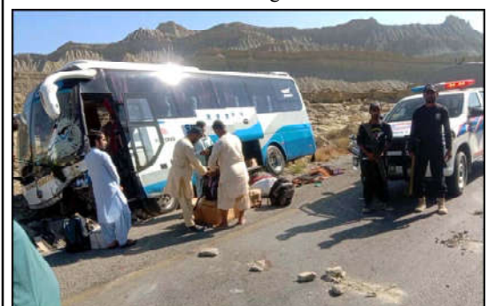
HUB: View of site after traffic accident due to over speeding and break failed, at Uthal.