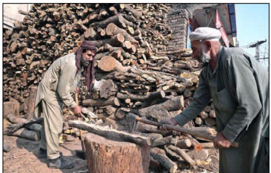
ISLAMABAD: Laborers cutting wood into pieces for selling purpose at his workplace in the Federal Capital.