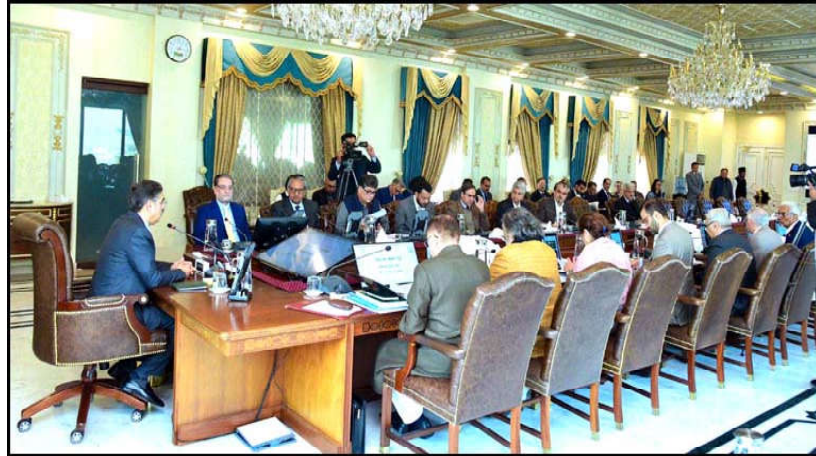
ISLAMABAD: Caretaker Prime Minister Anwaar-ul-Haq Kakar chairs a meeting of the Caretaker Federal Cabinet.

Ph: 2841470/2841473 Vol: XIX No. 01, Jamadi-us-Sani 28, 1445 AH Thursday January 11, 2024, Pages 04, Price Rs.15