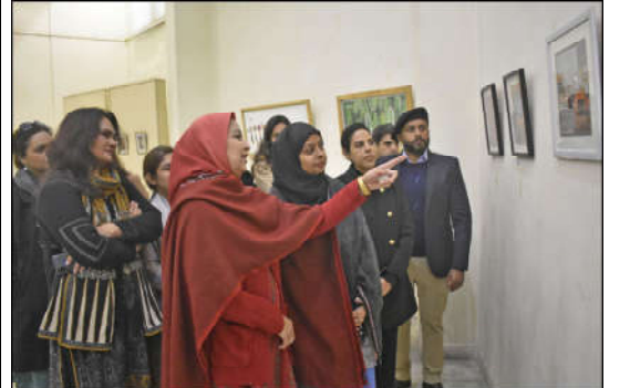
LAHORE: Visitors and staff are taking interest in the pictures during exhibition at Lahore College for Women University regarding the oppression on Palestinian people.

hailing from AJK's Dadyal town of expatriates in Mirpur district, was gunned down by unknown attackers near Islamabad international airport on his return from abroad. The AJK premier expressed his profound grief and sorrow over this tragic incident and extended his heartfelt condolences to the bereaved family. The Prime Minister has also directed the Chief Secretary of Azad Kashmir to contact the IG Punjab Police to ensure the immediate arrest of the accused and the safety of passengers on their return from foreign countries.