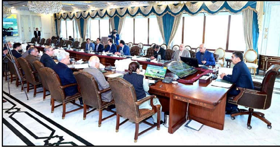
ISLAMABAD: Caretaker Prime Minister, Anwaar-ul-Haq Kakar chairs a meeting on the matters related to National Highway Authority (NHA), in Islamabad.

He made the remarks during the hearing of multiple pleas seeking timely elections within 90 days of the dissolution of the assemblies.