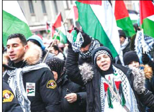
Protesters at the 'All Denmark on the Streets for Palestine Ceasefire Now!' demonstration march from Frederiksberg City Hall to Copenhagen City Hall.

An Israeli strike on south Lebanon on Monday killed a senior commander in Hezbollah's elite Radwan force, three security sources told Reuters, the latest in daily clashes across Israel's northern border.