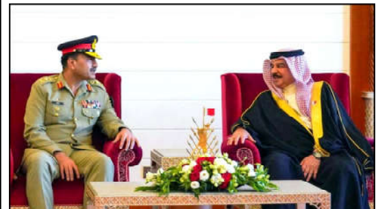
RAWALPINDI: Chief of Army Staff (COAS), General Asim Munir exchanging views with Hamad Bin Isa Bin Salman Al Khalifa, King of Bahrain during meeting held in Bahrain.

King of Bahrain also conferred Military Medal Order of Bahrain First Class on COAS in recognition of his significant efforts and contributions to the enhancement of bilateral ties between the two brotherly countries.