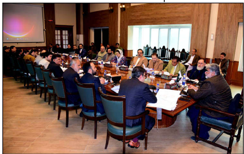
QUETTA: Caretaker Chief Minister Balochistan Mir Ali Mardan Khan Domki presiding over meeting of Provincial Cabinet

The concerned official briefed the meeting that a special seven-day anti-polio campaign was started on January 8, Monday across Balochistan saying that more than 25, 96000 children would be administered the polio vaccine, and more than 11000 teams were participating in the polio campaign.