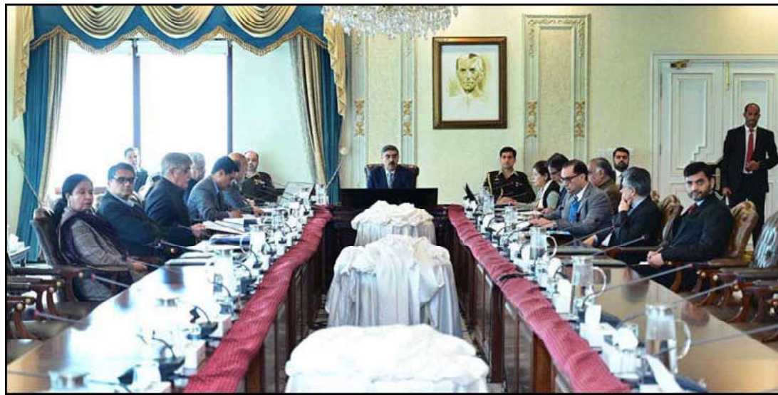
ISLAMABAD: Caretaker Prime Minister Anwaar-ul-Haq Kakar chairs a review meeting regarding Afghan Transit Trade and Anti-Smuggling operations.

He read out letter of Sharif ud Din Pirzada wherein it was written sister of Zulfiqar Ali Bhutto had filed mercy appeal before the president. Zulfiqar Ali Bhutto himself had not filed mercy appeal.