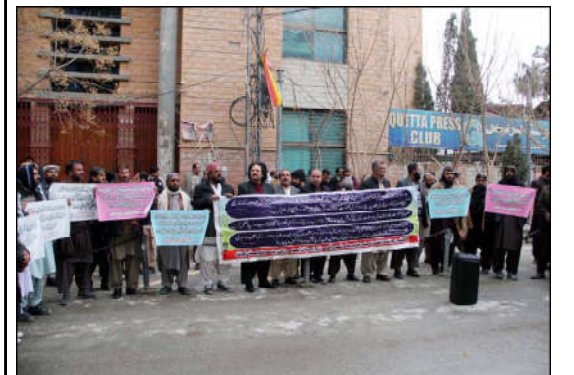
QUETTA: Members of Joint Action Committee University Teachers Officer and Employees Association are holding protest demonstration against the non-payment of their dues salaries.

The law minister said the investigation would be completed within the stipulated timeline. The committee will also bring forth the names of the masters, facilitators and all the elements who executed the plan of May 9 tragedy.