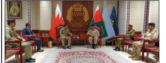
RAWALPINDI: Chief of Army Staff (COAS), General Asim Munir exchanging views with Field Marshal Khalifa Bin Ahmed Al Khalifa, Commander of Bahrain Defence Forces and General Shaikh Mohammad Bin Isa Al Khalifa, Commander of Bahrain National Guard during meeting held in Bahrain

The Governor said that it is our conscious endeavour and desire to increase the number of allocated seats for students of Balochistan in the educational institutions of other provinces.