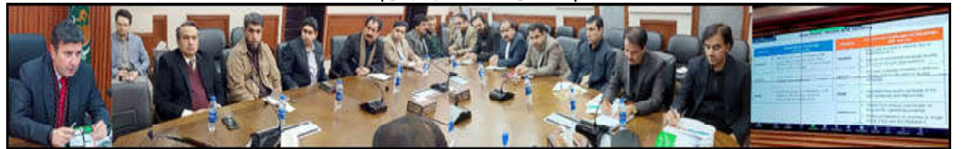
QUETTA: Chief Secretary Balochistan Shakeel Qadir Khan presiding over a meeting of Provincial Task Force for Prevention of Polio.

He further stated that the process of repatriation of illegal aliens would continue till the objectives were achieved.