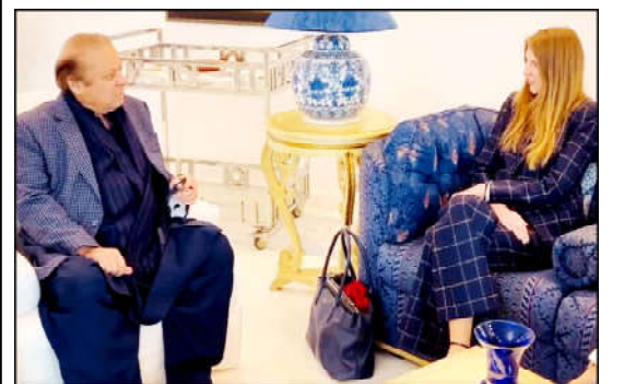
LAHORE: British High Commissioner Jane Marriot meeting with PML (N) quaid Muhammad Nawaz Sharif

Caretaker Chief Minister Khyber Pakhtunkhwa Syed Arshad Hussain Shah on Monday strongly condemned a bomb explosion near a police van in district Bajaur.