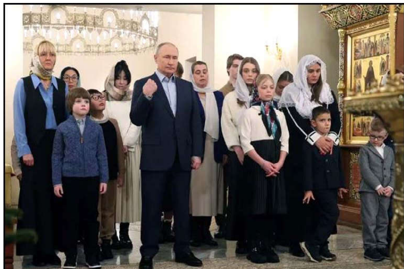
Russia's President Vladimir Putin attends the Orthodox Christmas liturgy at a cathedral on the territory of the Novo-Ogaryovo state residence outside Moscow, Russia.

State television footage showed the Russian leader attending with a small group of families of soldiers killed an intimate mid-night service, known as the Divine Liturgy, later on Saturday at a chapel at his residence in Novo-Ogaryovo outside Moscow. There was no call from Putin this year for a ceasefire in Ukraine to coincide with the holiday, which many Orthodox Christians celebrate on Jan. 6-7 - as was the case a year ago.