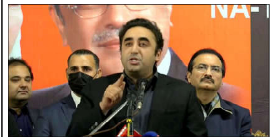
Bilawal said the city of Lahore is not the Lahore of any businessman or a cricket player, it is the Lahore of Shaheed Bhutto and it is everyone's misunderstanding to scare the PPP [leadership and workers] by martyring its Jialas (workers) and Bibi Benazir Bhutto.

LAHORE (INP): Pakistan People's Party (PPP) Chairman Bilawal Bhutto Zardari said he will take back Lahore of Zulfiqar Ali Bhutto to old politicians and Patwaris with the support of poor people of the city. Bilawal addressed a gathering of party workers in the National Assembly constituency NA-127. K Ghar Main Ghus K Marain Gey" (Now we will punish them after entering their house). He said he wanted to tell the old politicians that the victory in the elections was for Shaheed Benazir Bhutto and the people of Lahore only.