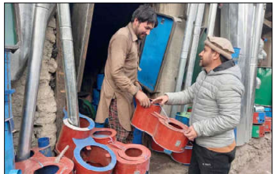
GILGIT: A vendor selling a traditional steel fire stove to the customer at his work place.

As the average annual economic growth between 2010 and 2023 has been lackluster, around 4 percent, and has been accompanied by a rise in Pakistan's total debt as a share of its GDP, from 55 percent to 76 percent.