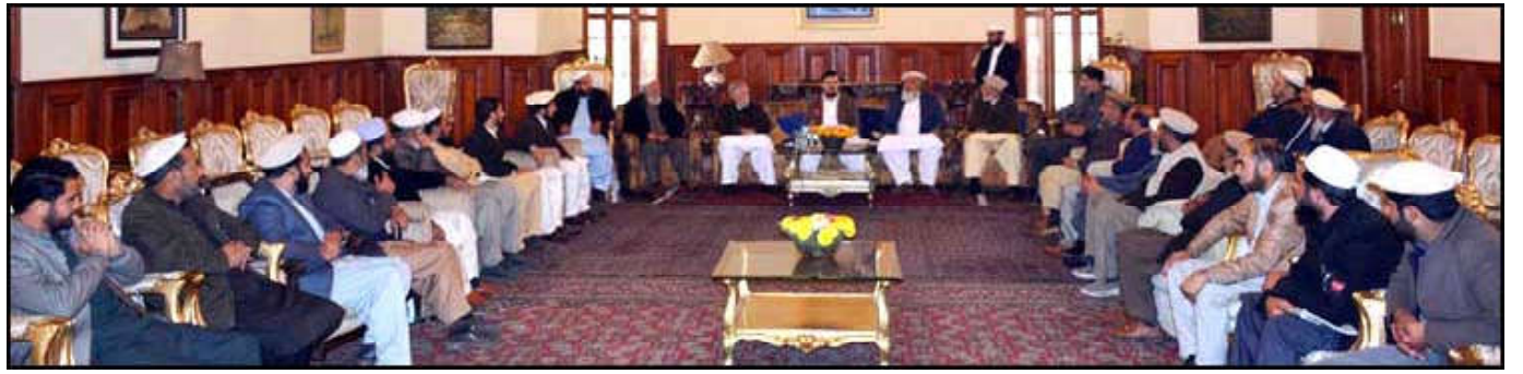
PESHAWAR: A delegation of 30-members tribal elites of merged District Mhmand meeting with Khyber Pakhtunkhwa Governor Haji Ghulam Ali.