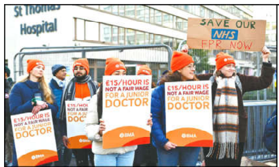
Doctors hold placards calling for better pay, as they stand on a picket line outside London's St Thomas Hospital on the first day of strike action.

The journey from Senegal to the Canaries usually takes a week of difficult upwind sailing of around 1,600 kilometres. Newscastrs regularly open with images of Red Cross officials and local doctors attending to newly arrived migrants wrapped in thermal blankets at ports in the Canaries, which has called for more help from Spain's central government and the European Union. Spain's minister for migration, Elma Saiz, said Tuesday during a visit to the Canaries that the central government was working on a law to distribute these minors across Spain.