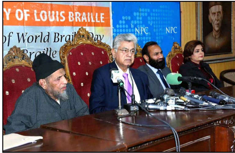
ISLAMABAD: Murtaza Solangi, Caretaker Federal Minister for Information and Broadcasting addressing an event organized by Pakistan Disabled Foundation for special persons at National Press Club.

The Envoys Conference is a regular feature for in-depth discussions on various facets of Pakistan's foreign policy, considering regional and global developments.