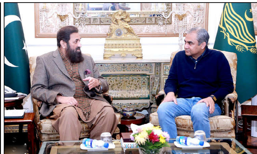
LAHORE: Caretaker Chief Minister Punjab Mohsin Naqvi in a meeting with Punjab Governor Muhammad Baligh-ur-Rehman.

A sum of Rs 13.46 million was recovered in terror financing, and in the Peshawar region, 46 cases in 2022 and 179 cases in 2023 were registered in that regard. One suspect was convicted in 179 cases of terror financing in the Peshawar region last year, and according to CTD, "Cases have also been registered for providing financial support to terrorists."