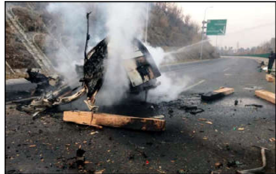
ABBOTTABAD: Smoke rising after fire broken out incident in a vehicle as the rescue 1122 workers are busy in extinguishing fire, near Qalandarabad Interchange in Abbottabad.