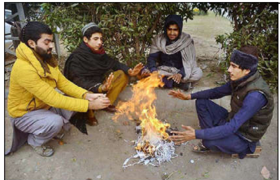
PESHAWAR: Vendors sitting around fire to keep them warm during cold weather in the city.

In schedule II, "may be arrested without warrant "non-bailable" has also been added. With regard to Section 148 the existing punishment was "up to three years or with fine, or both" has been replaced by "up to five years and shall also be liable to fine up to five hundred thousand rupees, which shall not be less than one hundred thousand rupees.