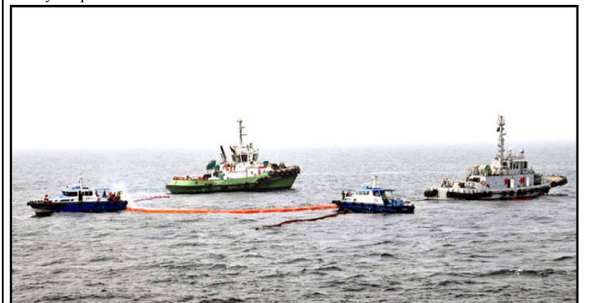
KARACHI: A view of marine oil spill exercise BARRACUDA-XII conducted in Arabian Sea held under auspices of Pakistan Navy and Pakistan Maritime Security Agency.