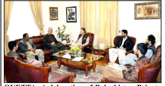
QUETTA: A delegation of Balochistan Private Schools Association Alliance meeting with Governor Balochistan Malik Abdul Wali Khan Kakar

According to the Public Relations Department of Tarbela Dam, it has been reported that only two units are currently operational, producing 271 megawatts of electricity, leading to an increase in load shedding. The closure of the majority of the power plant's production units has sparked concern about increased load shedding in the region.