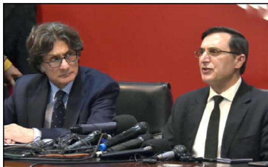
ISLAMABAD: Chairman of Pakistan Tehreek e Insaaf Barrister Gohar Ali Khan speaks during a press conference at party secretariat.

The Governor said that politics is a social responsibility and as such the political workers seem good while having close rapport with the masses.