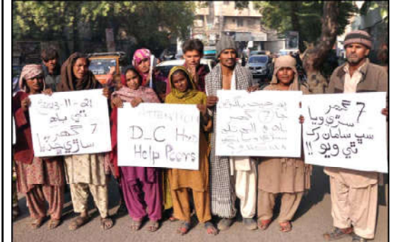
HYDERABAD: Residents of Gul Goth Muhammad Jakro are holding protest demonstration for acceptance of their demands, at Hyderabad press club.