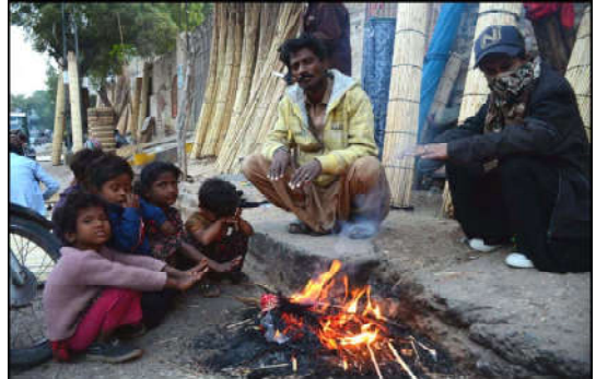
HYDERABAD: People warm their hands on bonfire to save themselves from cold waves during the winter season, in Hyderabad.

ZAFARWAL (APP): Zafarwal that I will soon build a sports complex in Zafarwal like the Narawal Sports Complex, where world-class sports and coaches are available." He said that the future of Pakistan was linked to the youth and for their bright future, the Pakistan Muslim League-Nawaz (PML-N) had taken practical steps. "More steps will be taken for their welfare in the future. More than 7,000 youths are studying in three universities in Narawal and world-class universities will also be set up in Zafarwal soon," he added.