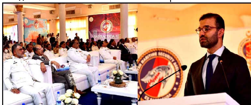
KARACHI: Caretaker Federal Minister for Climate Change, Ahmed Irfan Aslam addresses to participants during opening ceremony of the BARRACUDA XII Exercise, held at Headquarters Pakistan Maritime Security Agency (PMSA)

Pakistan has always been and will continue to be an ardent advocate of safe & secure seas for the well-being of the region and the world.