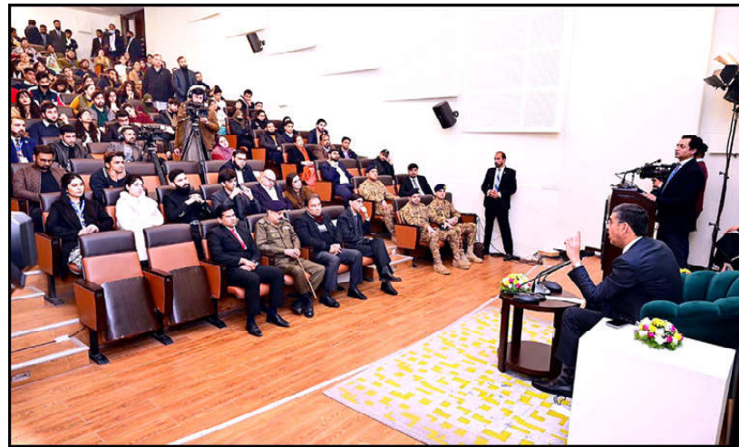
LAHORE: Caretaker Prime Minister Anwaar-ul-Haq Kakar in an interactive session with the students of Beaconhouse National University.

He shaped economic strategies that led Pakistan through pivotal periods while holding prominent posts in the Planning Commission and the Ministry of Finance.