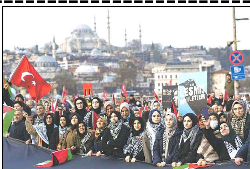
ISTANBUL: Tens of thousands of people demonstrate to show solidarity with the Palestinian people amid the Gaza crisis, at the Galata Bridge.

been frosty but Biden administration officials have visited Beijing and met with their counterparts to rebuild communications and trust in the months leading up to a high-stakes summit between Xi and Biden in San Francisco in November, deemed an opportunity to cool tensions between the world's two largest economies. Xi said the summit has pointed out the direction for both nations' ties, under a future-oriented vision. "I am willing to work with President Biden to continue to steer and navigate the China-US relationship for the benefit of China and the US and the two peoples, and to promote the cause of world peace and development," Xi said. The US is due its presidential election in November, in which former president and outspoken critic of China Donald Trump is campaigning against Biden to come back for a second term. Xi also exchanged New Year's messages with North Korea leader Kim Jong Un, and both announced 2024 to be a "friendship year" for both countries, launching a series of activities for that, the Chinese foreign ministry said separately. Xi said China is willing to work with North Korea to deepen strategic mutual trust, enhance exchanges and cooperation, promote greater bilateral ties and make new contributions to the maintenance of peace and stability in the region. On New Year's Eve, the Chinese leader exchanged greetings with Russian President Vladimir Putin as well.