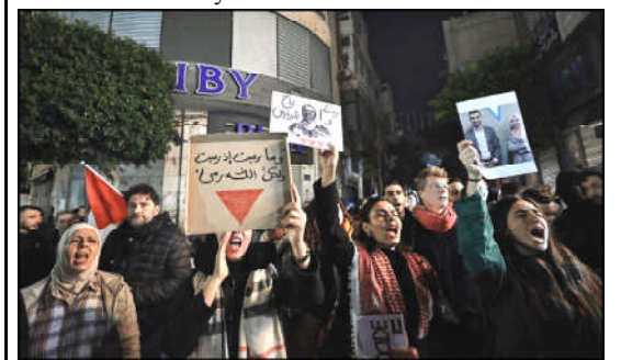
Palestinians protest in solidarity with Gaza in Ramallah, in the occupied West Bank.

Monitoring Desk TOKYO: A powerful earthquake that hit Japan on New Year's Day killed at least 48 people, with rescue teams struggling in freezing temperatures on Tuesday to reach isolated areas where many people are feared trapped under toppled buildings. In Suzu, a coastal town of just over 5,000 households near the quake's epicentre, 90 per cent of houses may have been destroyed, according to its mayor Masuhiro Izumiya. "The quake is catastrophic," he said. The quake with a preliminary magnitude of 7.6 struck on Monday afternoon, prompting people in western coastal areas to flee to higher ground as tsunami waves swept cars and houses into the water. Around 200 tremors were detected since the quake first hit on Monday, according to the Japan Meteorological Agency, which warned more strong shocks could hit in the coming days. A Coast Guard aircraft en route to deliver aid to the quake-hit region collided with a commercial aeroplane in Tokyo's Haneda airport on Tuesday, killing five Coast Guard crew while all 379 on board the Japan Airlines flight miraculously escaped a fire.