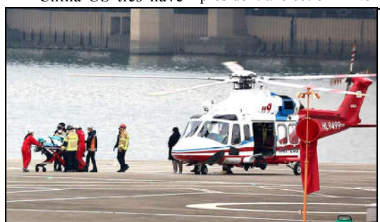
South Korean opposition party leader Lee Jae-myung, who was attacked in Busan, gets off from a helicopter on a stretcher to be transported to Seoul National University Hospital, at a heliport in Seoul.

Monitoring Desk TOKYO: A passenger plane and a Japanese coast guard aircraft collided on the runway at Tokyo's Haneda Airport on Tuesday which claimed five lives. Transport Minister Tetsuo Saito confirmed that all 379 occupants of Japan Airlines flight JAL-516 got out safely before the plane was entirely engulfed in flames. The pilot of the coast guard plane also escaped, but five crewmembers died, Saito said.