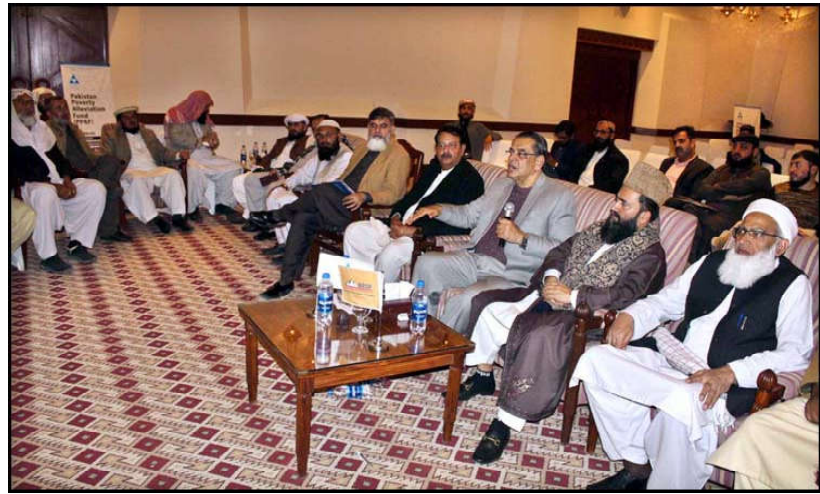
QUETTA: Federal Minister for Religious Affairs and Interfaith Harmony Aneeq Ahmed chairing a meeting with Religious Scholars of various religions.

while the rest had been decided. The President called for taking appropriate legislative measures at the federal and provincial levels to ensure the protection of women's property rights, besides discouraging the transfer of property by women to their family members due to pressures. He said that he was conducting personal hearings of the Ombudsperson's cases to expedite the process of justice. He stated that highlighting important decisions of FOSPAP in harassment and women's property cases through media would help increase awareness about the role of the Ombudsman. He said that police at the local level needed to improve their response to women's complaints in property cases, adding that police officials should be educated about the provisions of the Enforcement of Women's Property Rights Act, 2020.