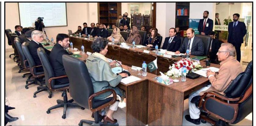
ISLAMABAD: President Dr Arif Alvi chairing a meeting during his visit to the Federal Ombudsman Secretariat for Protection Against Harassment at Workplace (FOSPAP) Head Office.

The representatives of these areas have never understood the people there what they want. What does the unemployed youth want?