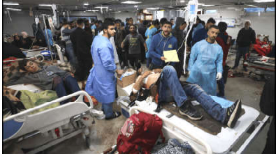
Injured people receive treatment in Gaza City's Al-Shifa hospital, following a reported Israeli strike, that according to Gaza's Health Ministry, killed at least 20 and wounded more than 150 as they waited for humanitarian aid.

Reuters/Ipsos poll conducted earlier this month showed him and Biden tied, though a nationwide survey does not capture the subtleties of the electoral college contest that will be decided this fall in just a handful of competitive states. As Trump handily beat his sole remaining primary challenger, Nikki Haley in New Hampshire on Tuesday, some 67% of respondents polled Monday through Wednesday said they were "tired of seeing the same candidates in presidential elections and want someone new."