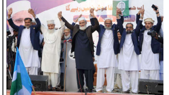
HYDERABAD: Ameer Jamaat-e-Islami Siraj ul Haq rising hands with party leaders to showing solidarity during a public meeting (Jalsa) in the city.