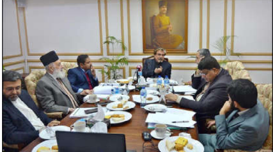
LAHORE: Caretaker Federal Minister for National Heritage and Culture Jamal Shah presiding over the Governing Body meeting of Iqbal Academy Pakistan at Aiwan-e-Iqbal.

assistance. He said that the significance of doctors could not be undermined owing to their profession adding their problems would be addressed promptly with the help of the provincial government. He also urged doctors to work compassionately to help out ailing community and treat them politely abiding by the principles of their profession.