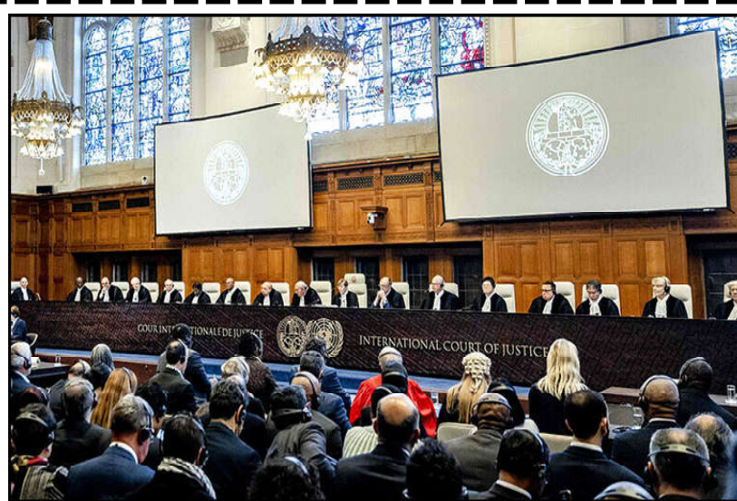
Judges at the International Court of Justice (ICJ) rule on emergency measures against Israel following accusations by South Africa that the Israeli military operation in Gaza is a state-led genocide, in The Hague, Netherlands.

other supplies in Gaza. It was not immediately known which one was operating in the area at the time of the incident. The UN refugee agency for Palestinian refugees, UNRWA, and the UN World Food Program both said they were not involved. Israeli troops and tanks pushed into Gaza City shortly after the ground invasion began in October and have been battling Palestinian militants there for nearly two months. The military says it has largely dismantled Hamas in northern Gaza but is still facing pockets of resistance, and large swaths of Gaza City and surrounding areas have been reduced to rubble by Israeli bombardment.