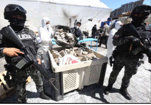
Ecuadorian authorities place drug packages in a container, as part of the more than 20 tons of seized drugs to be destroyed at an undisclosed location, in Ecuador.

Monitoring Desk WASHINGTON: The United States has condemned the Israeli assault on a UN facility in Khan Yunis, emphasising the protection of civilians and the need to respect the sanctity of UN facilities. "You've heard me say it before, you've heard [Secretary of State Antony Blinken] say it before [...]. Civilians must be protected, and the protected nature of UN facilities must be respected."