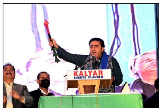
MULTAN: Peoples Party (PPP) Chairman, Bilawal Bhutto Zardari addresses to his supporters during public gathering meeting as a part of Election Campaign in connection of the General Election 2024 coming ahead, in Multan.

Tajikistan as it was Pakistan's closest Central Asian neighbour. He highlighted that there was great potential to increase bilateral trade and economic cooperation that needed to be fully exploited. He called for exploring new avenues of economic cooperation for the mutual benefit of the two brotherly countries. President Alvi expressed satisfaction over the steadily expanding bilateral relations between Pakistan and Tajikistan in all areas of mutual interest, especially in trade, energy and defence.