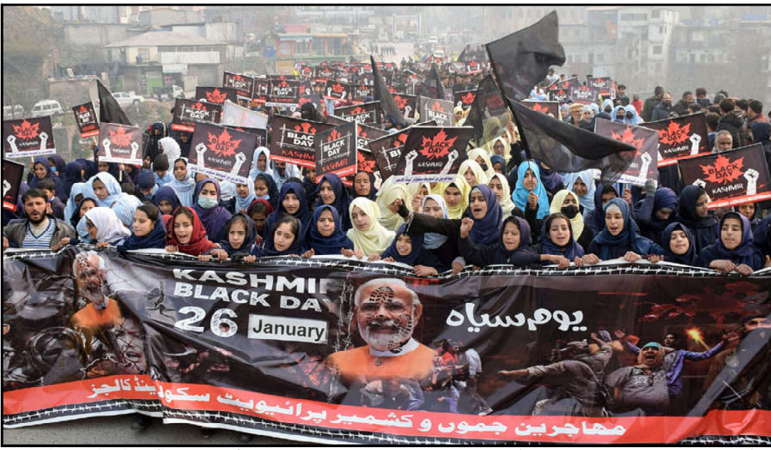
MUZAFFRABAD: Students of school and college hold placards during protest as they observe Indian Republic Day as Black Day during an anti-Indian protest in the city, to show their solidarity with people of Indian-administered Kashmir.