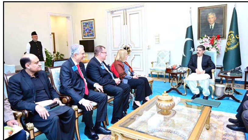
ISLAMABAD: A delegation of Rotary International calls on Caretaker Prime Minister Anwaar-ul-Haq Kakar.

plan, and our first priority upon assuming power will be their swift implementation to curb inflation and unemployment," he added. Bilawal also lauded the sacrifices made by the military and police to eradicate terrorism but pointed out, "The resurgence of terrorism today is a consequence of the social division sown by old politicians. It's time to bury the politics of hatred." The former foreign minister also said that 17 federal ministries had become redundant after the 18th Amendment, and would be abolished if his party came to power, adding that the Rs300 billion saved in this way would be utilised for the people's welfare through the kissan, mazdoor and youth cards. Bilawal Bhutto also vowed to stop the annual subsidy of Rs1,500 billion for the elite, opting to impose taxes on capitalists to ease the burden on the poor.