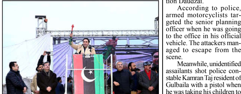
GUJRAT: Peoples Party (PPP) Chairman, Bilawal Bhutto Zardari addresses to his supporters during public gathering meeting as a part of Election Campaign in connection of the General Election 2024 coming ahead, in Gujrat.

Independent Report QUETTA: The caretaker Provincial Minister for Information, Jan Achakzai has categorically stated that there are challenges of law and order and security threats exist in different parts of the country including Balochistan, however, these threats and subversive acts can't affect the democratic process and as such the general elections would be conducted on the given time. He noted that the incidents of terrorists may occur in Balochistan, Islamabad and different other parts of the country as the security threats have been received, still the democratic process can't be affected due to these threats or terrorists' attacks. The Information Minister was addressing a hurriedly called press conference at the Civil Secretariat on Thursday. Jan Achakzai on the occasion particularly criticized the negative propaganda campaign run by Mah Rang Baloch against Pakistan and said that the people of Pakistan including Balochistan would never accept the disgusting campaign.