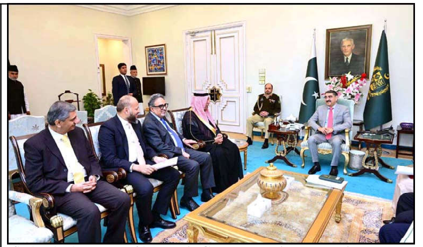
ISLAMABAD: Head of Al-Jomaih Group alongwith a delegation called on Caretaker Prime Minister Anwaar-ul-Haq Kakar.