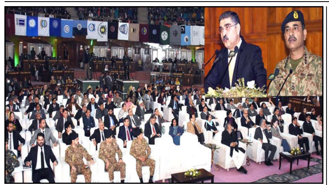
ISLAMABAD: Caretaker Prime Minister Anwaar-ul-Haq Kakar and Chief of the Army Staff General Syed Asim Munir addressing the participants of Pakistan National Youth Conference.

Ph: 2841470/2841473 Vol: XIX No. 229, Rajab 13, 1445 AH Thursday January 25, 2024, Pages 04, Price Rs. 15