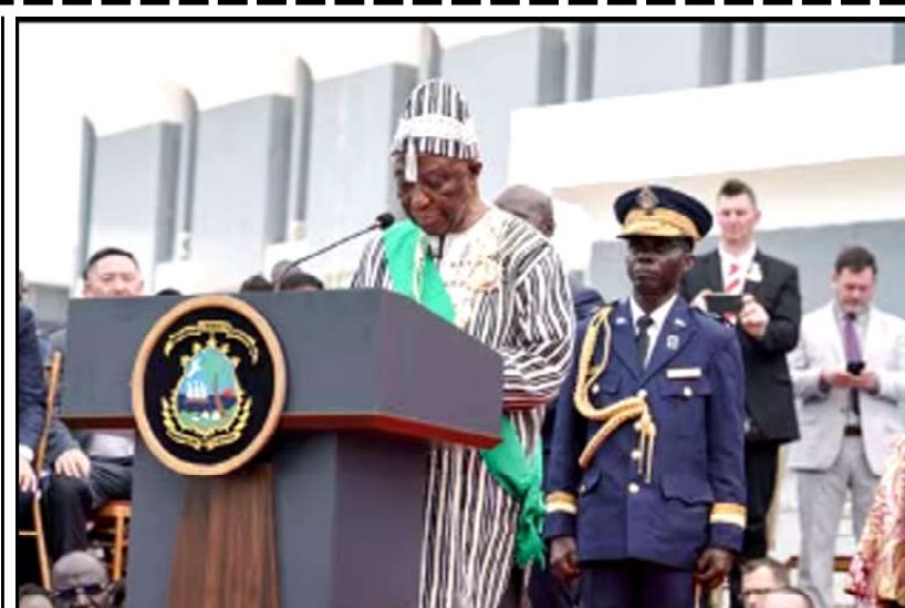
Liberia's president-elect Joseph Boakai, who defeated President George Weah in a runoff election gives a speech after he was sworn in as president during the inauguration ceremony in Monrovia, Liberia.

Eight people are confirmed dead and rescuers have extracted four, according to a report by state broadcaster CCTV at around 5:30pm (0930 GMT), though the condition of the four was not immediately clear.