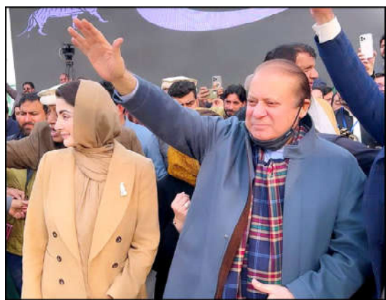
MANSEHRA: Quaid PML (N) Muhammad Nawaz Sharif waiving toward crowd during a public meeting in connection with general elections

He criticized the poor performance of the party that came into power with the slogan of 'change in Khyber Pakhtunkhwa', which had done nothing for the people of the province during its 10-year rule. The three times prime minister said putting the country again on the path to progress and prosperity would be a difficult challenge, but the PML-N had the ability to put it on road to progress and development.