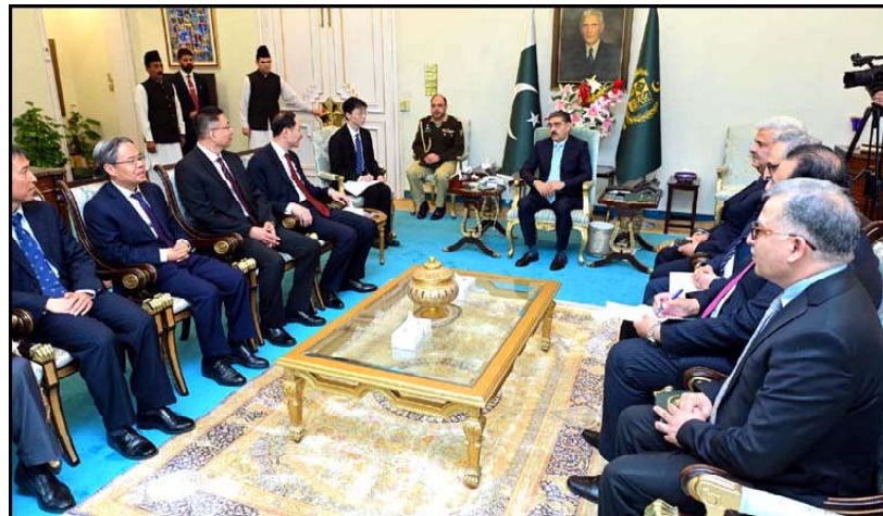
ISLAMABAD: Caretaker Prime Minister, Anwaar-ul-Haq Kakar exchanging views with Sun Weidong, Vice Foreign Minister of the Peoples Republic of China during meeting held in Islamabad.