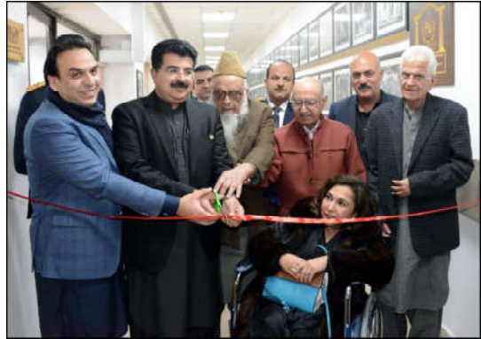
ISLAMABAD: Chairman Senate, Muhammad Sadiq Sanjrani inaugurating the Wall of Federation, at Parliament House in Islamabad.

wrongdoings. Speaking on the occasion, former prime minister and the PMLN supreme Nawaz Sharif also criticized former government for ruining the country's economy and depriving Khyber Pakhtunkhwa of development projects. "Nawaz Sharif left better Pakistan but now it is detracted", the PML-N supreme said while addressing a public gathering in Mansehra, KP ahead of the February 8 general elections. The ex-prime minister said that he not been removed from power in 2017, the people of Mansehra would have been gifted an airport and a metro project. He regretted that development work on the Sukkur-Hyderabad Motorway was stopped by the past government of Pakistan Tehreek-e-Insaf.