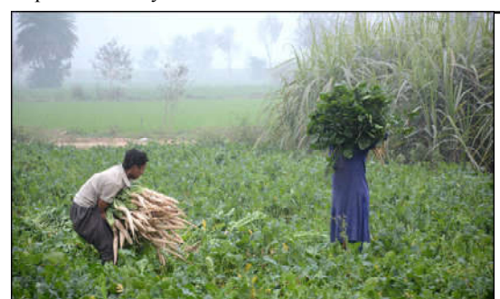
FAISALABAD: Farmers are busy harvesting raddish crop at their field.

She, however, desired to convene another meeting next week to formalize the program contours. She also desired to invite the State Bank of Pakistan (SBP) and Security and Exchange Commission of Pakistan (SECP) in the next meeting to finalize the program modalities.