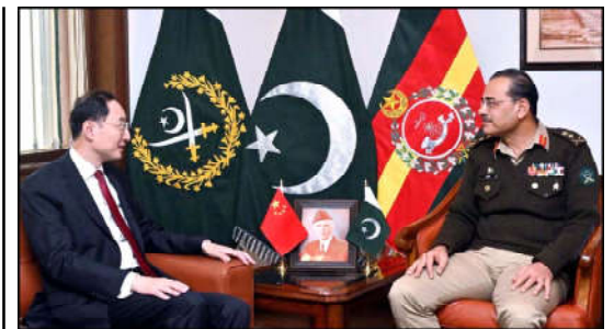
RAWALPINDI: Chief of Army Staff (COAS), General Asim Munir exchanging views with Sun Weidong, Vice Foreign Minister of the Peoples Republic of China during meeting held at General Headquarters in Rawalpindi.

RAWALPINDI: The security forces on Monday killed at least seven terrorists involved in hostile activities against the armed forces and innocent civilians during a fire exchange that took place during an intelligence-based operation in Sambaza Sector area of Zhob District, near the Pakistan-Afghan border. According to the Inter-Services Public Relations (ISPR) news release, the Army troops effectively surrounded and engaged the fleeing terrorists. The seven killed terrorists remained actively involved in terrorist activities against security forces as well as the killing of innocent civilians. Arms, ammunition, and explosives were also recovered from the killed terrorists.