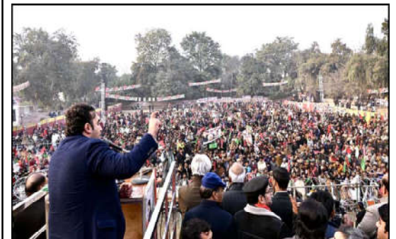
SAHIWAL: Chairman Pakistan People's Party Bilawal Bhutto Zardari addressing to public gathering during Election Campaign at Hockey Ground.

chance. If you give me a chance, I will change the fate of the country and solve all the problems [being faced by the country]." Referring to the skyrocketing inflation, unemployment, and poverty, the PPP leader claimed that his party was the sole solution to these problems. "Pakistan is going through a default time," Bilawal said, adding that there was a "division" in the society. The former foreign minister warned that hostile forces could use the "division" to fulfil their nefarious designs. "I am contesting election to bury the politics of hatred and division."