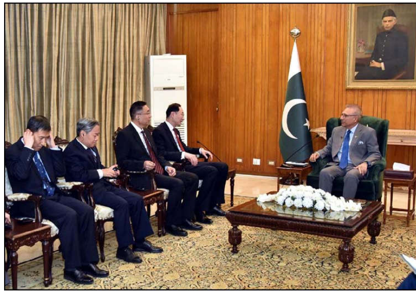
ISLAMABAD: President, Dr. Arif Alvi exchanging views with Sun Weidong, Vice Foreign Minister of the Peoples Republic of China during meeting held at Aiwan-e-Sadr in Islamabad.