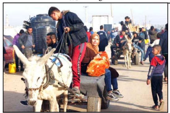
Displaced Palestinians use a donkey cart for transportation at a camp in Rafah near the border with Egypt in the southern Gaza Strip.

Borrell spoke at the monthly gathering of EU foreign ministers, attended this time by counterparts from Saudi Arabia, Egypt