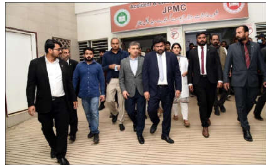
KARACHI: Governor Sindh Kamran Khan Tessori during his visit to Jinnah Hospital Emergency Department.

Meanwhile, the caretaker minister has also sought a report from the concerned authorities regarding the issue of non payment of NMDs contractual nursing staff salaries.