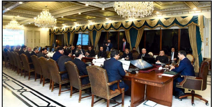
ISLAMABAD: Caretaker Prime Minister Anwaar-ul-Haq Kakar chairs a meeting of the Caretaker Federal Cabinet.