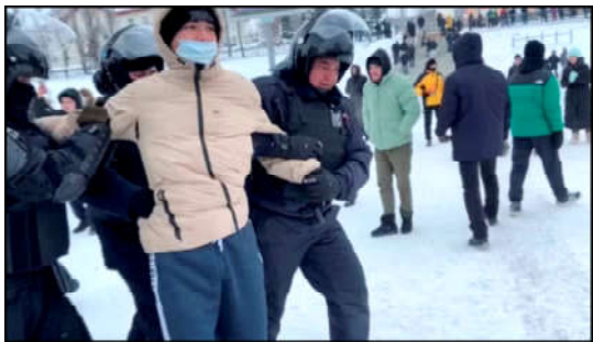
Law enforcement officers detain a demonstrator protesting the court verdict against a leading rights activist in the city of Ufa in the Republic of Bashkortostan, Russia.

Schumer and his House Republican counterpart, Mike Johnson, early this month agreed to a $1.59 trillion discretionary spending level for the year that ends on Sept. 30.