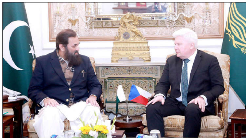
LAHORE: Newly appointed Ambassador of Czech Republic to Pakistan Ladislav Steinhübel meeting with Punjab Governor Muhammad Balighur Rehman at Governor House.

According to a spokesman of the department, stringent measures will be taken against individuals driving without a license, underage drivers, one-way violators, and those not wearing helmets. The department witnessed over 16,000 motorcyclists challans for helmet violations, 264 drivers fined for underage driving, and 1,635 vehicles impounded for emitting smoke. Additionally, 57,000 fines were issued for lane violations, while 3,455 vehicles were seized for one-way traffic violations. To ensure road safety and prevent accidents, the crackdown will persist.