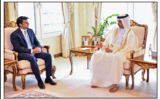
Sohrab Malik and Abdulaziz bin Faisal Al Thani, marking a momentous occasion for bilateral collaboration and economic development, said a press

The SAPM highlighted the crucial role of the Pakistani diaspora in Qatar's infrastructure de-