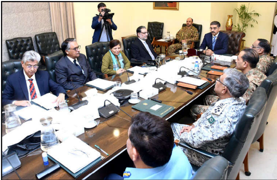
ISLAMABAD: Caretaker Prime Minister Anwaar-ul-Haq Kakar chairs a meeting of the National Security Committee, in the Federal Capital.

Ph: 2841470/2841473 Vol: XIX No. 225, Rajab 08, 1445 AH Saturday January 20, 2024, Pages 04, Price Rs.15