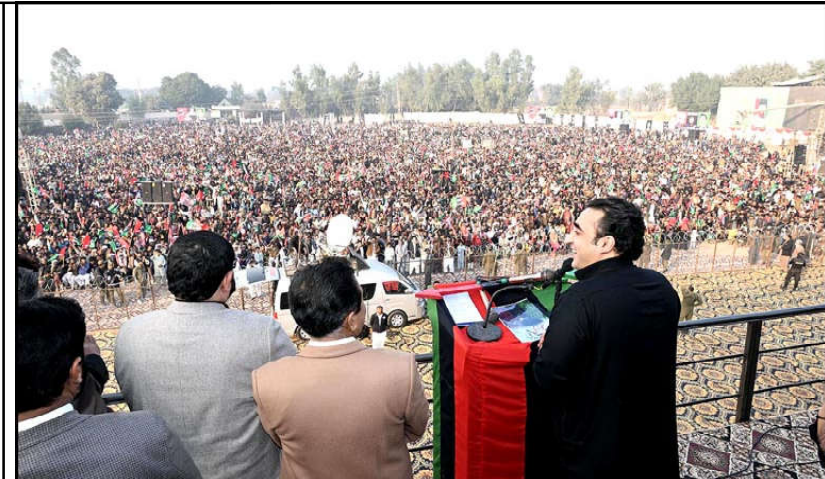
RAHIM YAR KHAN: Chairman PPP Bilawal Bhutto Zardari addressing the public gathering in in Liaquatpur.

The caretaker Minister Information was addressing a hurriedly called press conference at the Sikandar Jamali Auditorium, Civil secretariat on Friday.