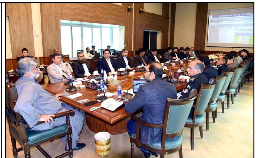
QUETTA: Caretaker Chief Minister Balochistan Mir Ali Mardan Khan Domki presiding over a high level meeting to review steps taken for holding of peaceful elections in the province

The prime minister said that, in that regard, Pakistan would welcome and reciprocate all positive measures from the Iranian side.