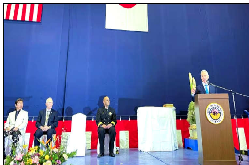
U.S. ambassador to Japan Rahm Emmanuel speaks at a U.S. naval ship repair facility in Yokosuka, Japan.

Iran has denied any role in the Hamas assault on Israel, with Iranian Foreign Ministry spokesman Nasser Kanani saying such accusations were “based on political reasons.” Netanyahu added that “Iran is the head of the oc-