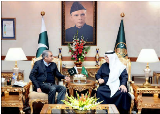
LAHORE: Ambassador of Saudi Arabia to Pakistan, H.E. Nawaf bin Saeed Ahmad Al Maliky called on Caretaker Chief Minister Punjab Mohsin Raza Naqvi.

in the right direction. He urged that unnecessary expenses should be reduced and the sources of income should be increased in such a way that fees are not increased. Previous inquiry reports of Chief Minister Inspection Team (CMIT), Higher Education Commission, and Higher Education Department were also discussed in the meeting. On this occasion, Governor Punjab issued instructions that the Punjab Government should take necessary steps in the light of these reports. Governor Punjab directed that all these reports should also be presented before the Syndicate so that the Syndicate can take correct decisions in the light of the report presented.