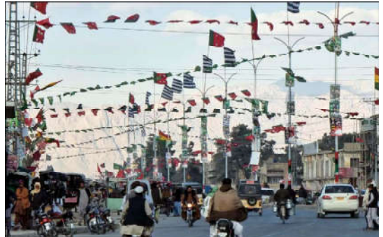
QUETTA: Banners and flags of different political parties has been placed on Sariyab road in connection of upcoming General Election 2024.

He said that the whole nation is standing by it's brave and talented armed forces.