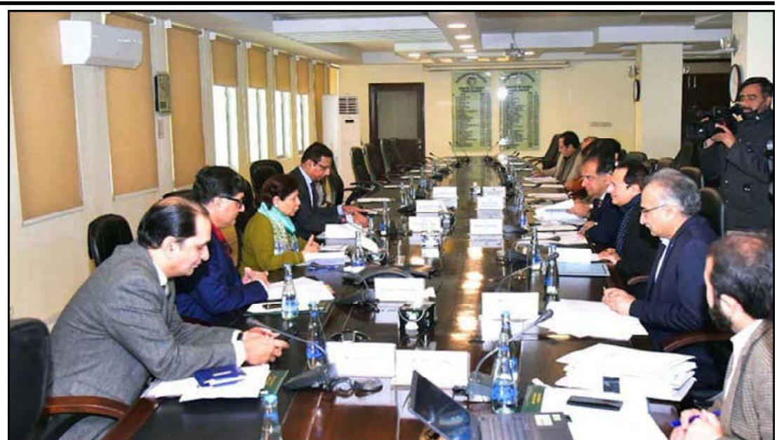
ISLAMABAD: Minister for Finance, Revenue and Economic Affairs, Dr. Shamshad Akhtar chairing a meeting on drugs pricing mechanism.

agriculture, and other sectors crucial for economic growth. The minister noted a monthly increase of one billion dollars in exports over the past three months, and with revised tariffs, he anticipated a doubling of the country's export figures. During his visit to various stalls at the Expo, Minister Gohar engaged with representatives from different companies who briefed him on their manufacturing processes. Gohar concluded his address by expressing optimism about Pakistan's promising economic