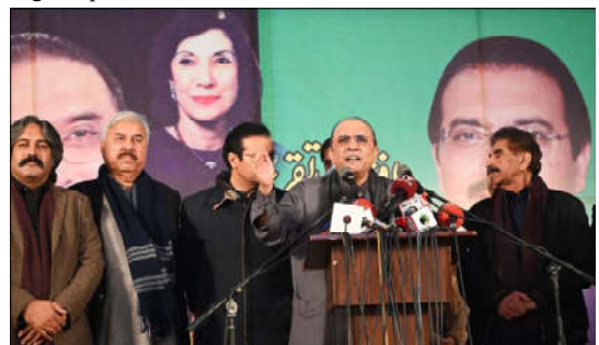
LAHORE: PPP President, Asif Ali Zardari addresses public gathering meeting regarding inauguration ceremony of Election Campaigns in connection of the General Election 2024, held at Peko Road NA-127 constituency in Lahore.

QUETTA: Vehicles have been verified by the district administration for bringing diesel from the Rotuk crossing points, but permission was not even granted to the verified vehicles to bring diesel from Rotuk crossing points along Pak-Iran border, therefore, All Zambad Union decided to block Pak-Iran national highway of Dalbandin in support of its demand. These views were expressed by speakers on Wednesday while addressing the protestors who had staged protest sit-in at Pak-Iran national highway in Dalbandin on the call of All Zambad Union. They said ban imposed on bringing diesel from Rotuk crossing point along Pak-Iran border left owners of Zambat vehicles jobless, adding that district administration Chagai had been paying lip service for the last two years instead of addressing the issue. They said that highway would remain closed for all kinds of vehicular traffic till the acceptance of the demands of All Zambad Union.