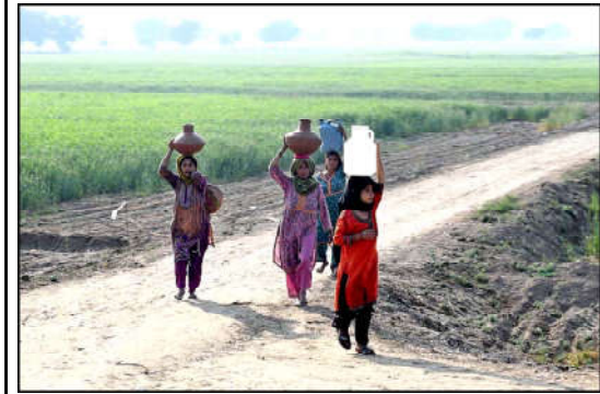
LARKANA: Women and girls on the way back to their homes after filling water in pots.