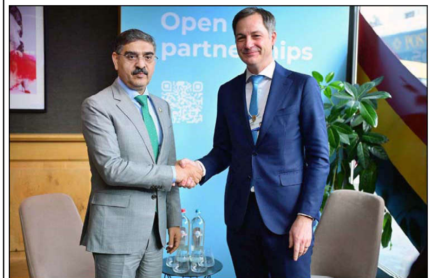
DAVOS: Caretaker Prime Minister Anwaar-ul-Haq Kakar meets the Prime Minister of Belgium Alexander De Croo on the sidelines of the World Economic Forum.