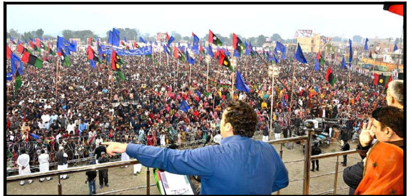
SANGHAR: Peoples Party (PPP) Chairman, Bilawal Bhutto Zardari addresses to his supporters during public gathering meeting in connection of General Election 2024 coming ahead, in Sanghar.

Expressing Pakistan's unreserved condemnation of the attack, the Foreign Minister added that the incident has caused serious damage to bilateral ties between Pakistan and Iran. The Foreign Minister added that Pakistan reserved the right to respond to this provocative act.