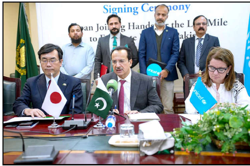
ISLAMABAD: Caretaker Federal Minister for National Health Services, Regulations and Coordination, Dr. Nadeem Jan witnesses the grant signing ceremony between Pakistan and Japan to support Pakistan's Polio Programme.

GWADAR (INP): Pakistan-China Technical and Vocational Institute (PCT&VI) has admitted 366 students from Gwadar and other parts of Balochistan in various programs. Around 500 students both male and female made their appearance in entry test to get admitted in many areas of study including Tourism, English Language, Maritime and Port Management, Software Technology, Chinese Language and Culture, Mechatronics and E-Commerce, according to a Gwadar Pro's report on Wednesday. PCT&VI official told Gwadar Pro that classes will commence on January 22 as per schedule already conveyed to admit students in their relevant subjects. He said that 15 students were admitted in Tourism Management, 127 were enrolled in English Language, 59 were admitted in Maritime and Port Management. Meanwhile, he said that 100 students were enrolled in Software Technology, 35 were admitted in Chinese Language and Culture, 5 were given admission in Mechatronics and 25 were enrolled in E-Commerce. All vocational and training programs and courses are designed in collaboration with Shandong Institute of Commerce and Technology (SICT), China, and relevant accredited institutions.