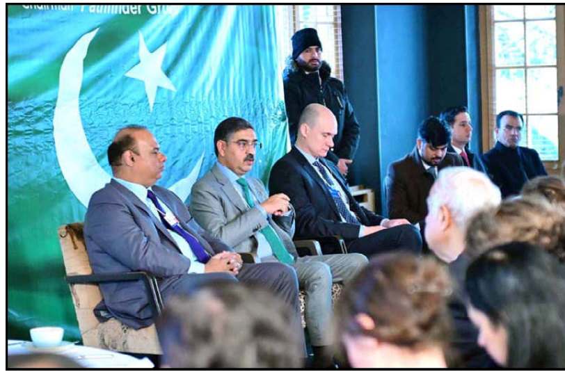
DAVOS: Caretaker Prime Minister Anwaar-ul-Haq Kakar addressing the Pathfinders' Pakistan Breakfast meeting held on the sidelines of the World Economic Forum.

He said that many political parties had complaints about the level playing field. The Pakistan Muslim League-Nawaz was complaining of a lack of level playing field in Sindh and the Pakistan Peoples Party had same complaints in Punjab.