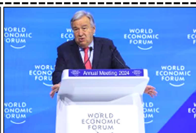
UN Secretary-General Antonio Guterres attends the 54th annual meeting of the World Economic Forum in Davos, Switzerland.