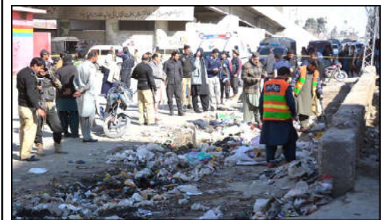
QUETTA: Security personal examine blast site. Nine people, including a traffic policeman and three children, were injured in a blast on Quetta's Zarghoon Road. Explosive material was planted in a heap of trash that had been lying for some time.

"On the other hand, 'lion' [PML-N's electoral sign] is hiding like a cat and wanting someone else to hunt for him," he said taking a dig at the Nawaz-led party. "It is a bloodsucking lion who wants blood of labourers, farmers, and the nation. PML-N has an electoral sign of 'lion' in Punjab, (and in Sindh) 'star' — election symbol of Grand Democratic Alliance — is its facilitator."