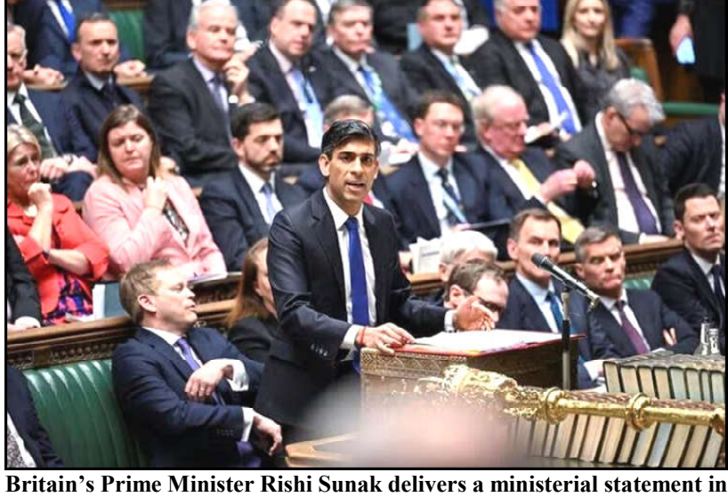
the House of Commons, in London, Britain.

The Florida governor and Trump's other main rival - former UN ambassador Nikki Haley — were locked at 21 and 19pc respectively