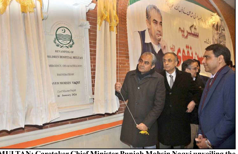
MULTAN: Caretaker Chief Minister Punjab Mohsin Naqvi unveiling the plaque to inaugurate the Revamping of Children Hospital Emergency, OPD & Pathology blocks during his visit.

The initiative, led by the Pakistan Army and Frontier Corps, aims to continue providing health facilities to remote areas through