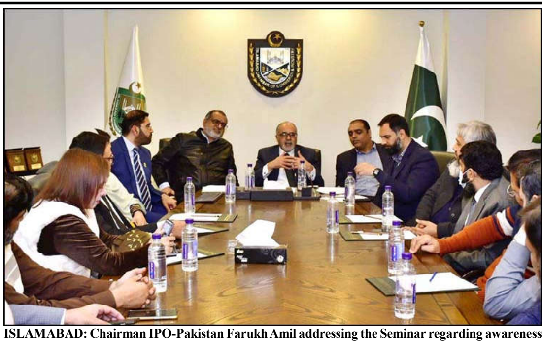
of IP rights at Islamabad Chamber of Commerce.

He assured that ICCI would work with IPO-Pakistan to raise more awareness in the business community about the importance of IPRs for better growth of their businesses.