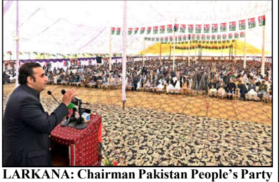
Bilawal Bhutto Zardari addressing to Party workers Gathering at Bhutto House Naudero.

Addressing the officers and staff of POF, Gen Munir applauded their dedicated efforts in bolstering the security and economy of Pakistan, emphasising the pivotal role of POF as the primary defence industry in the country. He acknowledged the significance of indigenous and local industries in the path to national