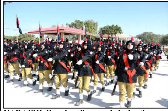
KARACHI: Female police march during the passing-out ceremony at Saeedabad Police Training Centre, in Provincial Capital.

It was said that 1750 kanal land has been acquired for phase I and allotment of 3434 plots has been done. The meeting was informed that appropriate measures have been taken to prevent flooding and private sector has been involved for investment in the mega housing scheme.