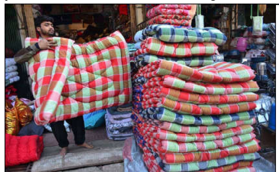
HYDERABAD: A vendor displaying quilts to attract the customers at his shop during winter season.