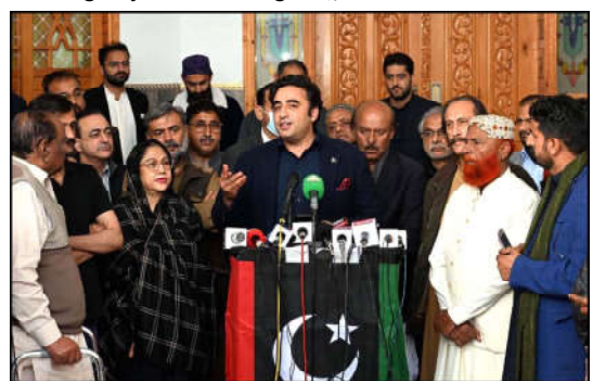
QAMBAR SHAHDAKOT: Peoples Party (PPP) Chairman, Bilawal Bhutto Zardari talking to media persons during his visit to Qambar Shahdadkot.

Prior to his media talk, Bilawal asked PPP workers to strongly resist and thwart conspiracies being hatched by PML-N.