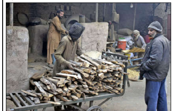
LAHORE: A vendor is unloading the woods from handcart to use as fuel at traditional mud oven at Misri Shah area of the Provincial Capital.