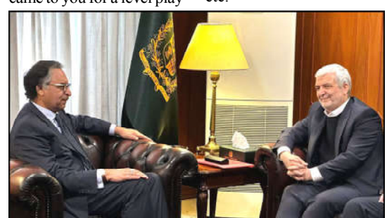
ISLAMABAD: Iran's Special Representative for Afghanistan Affairs, Hassan Kazmi Qomi called on caretaker Foreign Minister Jalil Abbas Jilani.

ing field for fair and transparent elections," he remarked, adding that people had been allotted symbols like glass, bowl etc. "We have been humiliated," the lawyer said.