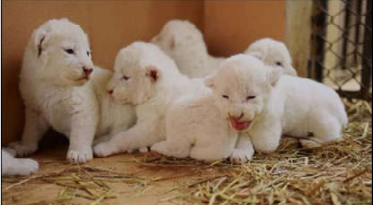
KARACHI: A view of the newly born cubs of African Lioness at Zoo in Provincial Capital.