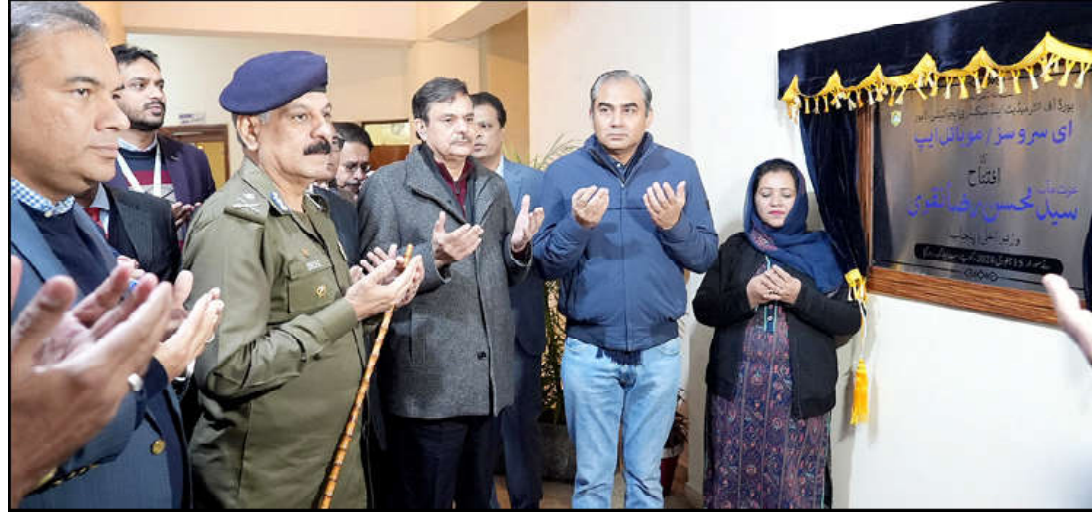
LAHORE: Caretaker Chief Minister Punjab Mohsin Raza Naqvi offering Dua after inaugurating E-Services/Mobile App at Lahore Board of Intermediate and Secondary Education.

female competitors. The icy battlegrounds are ready to host an intense showdown of skill, speed, and teamwork as the players vie for victory. Beyond the thrill of ice hockey, the festival boasts a lineup of diverse competitions, including Ice Skating and traditional local games such as Basra, Pindok, and Baalbut. Participants from across Gilgit-Baltistan are gearing up to showcase their prowess in these unique and culturally significant contests. One of the highlights of this year's event is the active participation of female teams in various competitions.