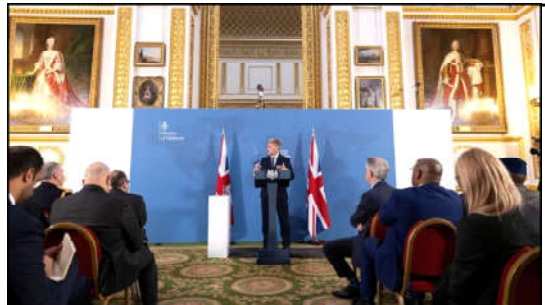
Britain's Secretary of State for Defence Grant Shapps gives a speech at Lancaster House, in London, Britain.