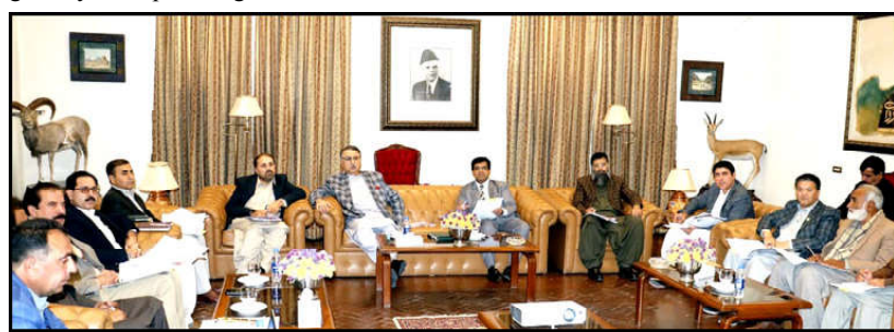
QUETTA: Governor Balochistan Malik Abdul Wali Khan Kakar presiding over a review meeting of Balochistan Sports Board

Referring the one-document regime, the Minister Information said that the one-document regime has been enforced at all entry and exit points along Afghanistan border.