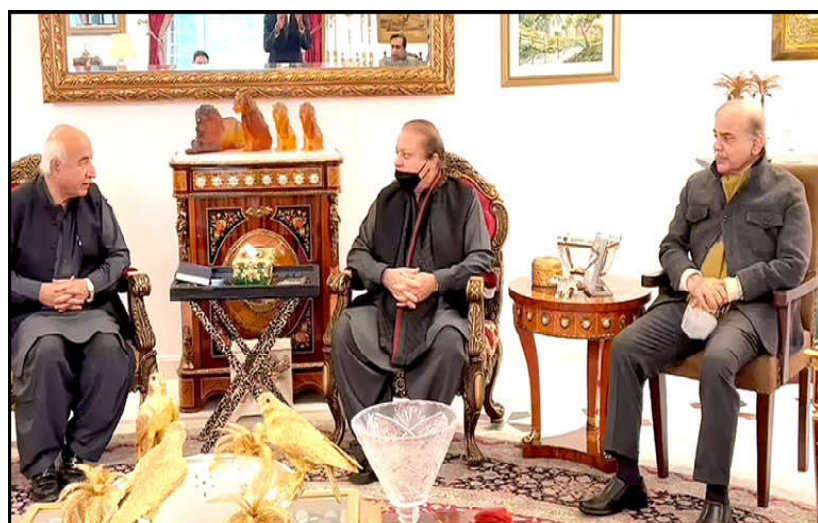
LAHORE: President National Party Dr. Abdul Malik Baloch meeting with PML(Q) Quaid Muhammad Nawaz Sharif and President Muhammad Shahbaz Sharif.

He said that every citizen should exercise their right to vote a per conscience.