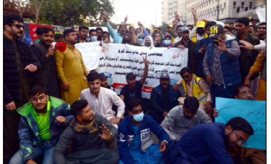
KARACHI: Lady Health Workers and vaccinators of Expanded Programme on Immunization (EPI) are holding protest demonstration for acceptance of their demands, at Karachi press club.