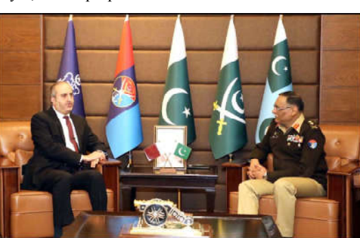
RAWALPINDI: Chairman Joint Chiefs of Staff Committee (CJCS), General Sahir Shamshad Mirza exchanging views with Ali Bin Mubarak Al Khater, Ambassador of the State of Qatar to Pakistan during meeting held in Rawalpindi.

Distinctive watermarks will adorn the ballot papers, which are set to be printed using three different machines. Rigorous security protocols have been ensured for the Printing Corporation premises during the ballot paper production.