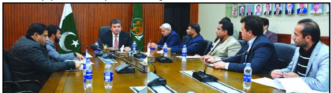
QUETTA: Chief Secretary Balochistan Shakeel Qadir Khan presiding over a meeting regarding Green Pakistan Initiative

The caretaker Chief Minister Balochistan, Mir Ali Mardan Khan Domki described the initiation of Quetta safe city project is an important development for protection of life and property of the masses. He said that the provincial government and law enforcement agencies would implement the initiatives for restoration of peace in the metropolis. It may be mentioned here that the command and control center of the Quetta safe city project is equipped with modern technology and best human resource. This is the first locally designed and prepared project of Pakistan, which has been connected with the LEAs for rapid response and action for ensuring peace.