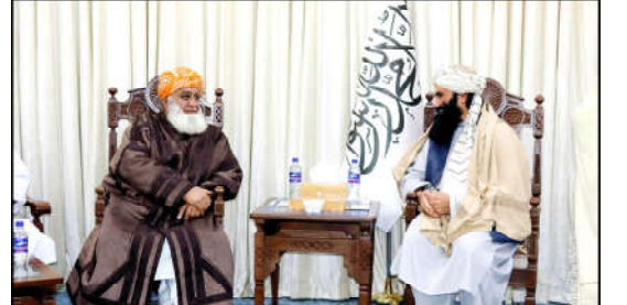
KABUL: JUI Chief Maulana Fazlur Rehman met with Afghan Interior Minister Siraj ud din Haqqani.

Bilawal says: JARANWALA (Online): Chairman of PPP Bilawal Bhutto Zardari said that PPP is contesting elections for public service. We will end unemployment and inflation. The journey of public service was started by leader of people, Zulfiqar Ali Bhutto and Bibi Shaheed laid down her life for the completion of that and we will continue this public service. While giving interview to Online after Tandlianwala visit, he said that we were given the manifesto and consciousness by Shaheed Bibi, so if we get win the PPP elections then we will change the destiny of the country and nation by implementing the 10-point agenda. He said that "Wasila Haq Wasila Rozgar" are projects of PPP and we will start such welfare projects like Benazir Income Support for every sector which will bring prosperity to every home and will end the worst inflation, poverty and unemployment. The wheel of industries will run, the workers will get employment. Agricultural revolution will come when farmer will be prosperous. New universities will be built wherever necessary, including Tandlianwala, just as 2 million houses are being built for flood victims in Sindh and Baluchistan. Similarly 3 million houses will be built in Punjab.