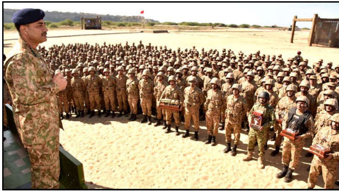
Chief of the Army Staff, General Syed Asim Munir interacting with the officers and troops at the occasion of witnessing firing of different air defence weapon systems during Exercise Al-Bayza-III, 2024 at Sonmiani.