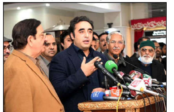
LAHORE: Peoples Party (PPP) Chairman, Bilawal Bhutto Zardari talking to media persons during his visit to Minhaj-ul-Quran Secretariat in Lahore.