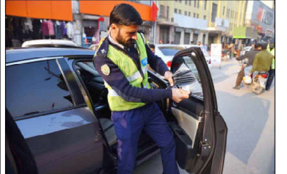
PESHAWAR: Traffic Warden Officials are removing tinted sheet from a car at Cantt Bazar.

level. While introducing technical education and skills training courses in general educational institutions, the Technical Education and Vocational Training Authority (TEVTA) has been assigned the task of conducting a feasibility study about identification of suitable institutions for the merged districts.