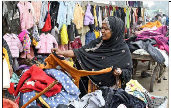
LARKANA: A woman busy selecting used warm clothes at Old Bus Stand Road.