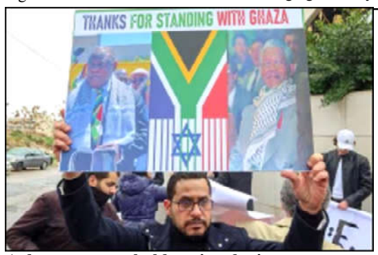
A demonstrator holds a sign during a protest as judges at The International Court of Justice (ICJ) in the Hague, hear a request for emergency measures to order Israel to stop its military actions in Gaza, in Amman Jordan.

humanitarian law," Lula expressed support for South Africa's case with the goal of ordering "Israel to immediately cease all acts and measures that may constitute genocide or related crimes under the terms of the Convention for the Prevention and Punishment of the Crime of Genocide." The statement emphasized that Lula has been making efforts in the international community for a ceasefire, the liberation of Hamas-held hostages, and the creation of humanitarian corridors to protect Palestinian civilians. "The Brazilian government reiterates its defense of the two-state solution, with an economically viable Palestinian state living side by side with Israel, in peace and security, within mutually agreed and internationally recognized borders."