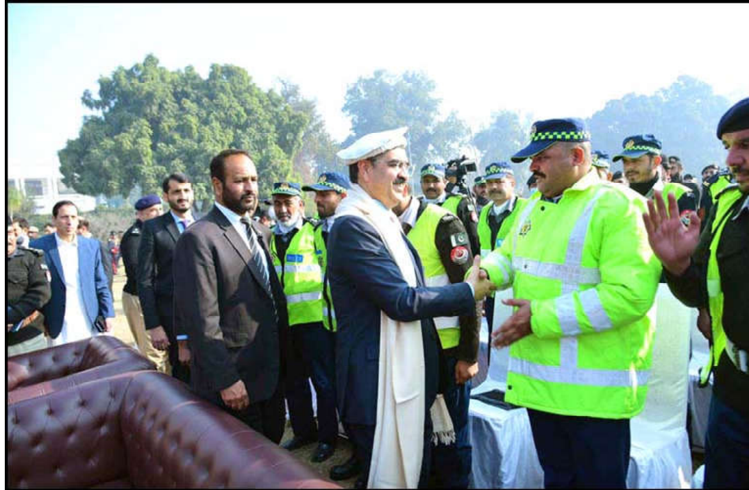
PESHAWAR: Caretaker Prime Minister Anwaar-ul-Haq Kakar interacts with KP Police officials after the Police Darbar Ceremony.

Ph: 2841470/2841473 Vol: XIX No. 218, Jamadi-us-Sani 29, 1445 AH Friday January 12, 2024, Pages 04, Price Rs.15