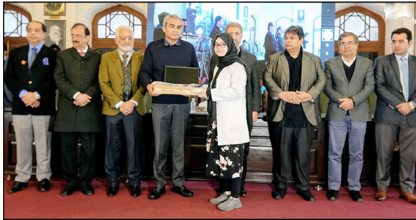
LAHORE: Caretaker Chief Minister Sindh Mohsin Naqvi distributing laptops amongst the students of King Edwards Medical College.

country, the existing laws on tobacco control cannot be enforced on the use or sale of modern smokeless tobacco products which use is increasing due to easy availability in markets and advertisement in media. The delegation members requested the Governor for measures to impose a ban on vapes and all forms of e-cigarettes. In this regard, they also suggested legislation in Khyber Pakhtunkhwa. Responding to the points, Governor KP Haji Ghulam Ali while expressing his agreement to the call extended support for imposition of ban on these products with the purpose of protecting public health, especially youth.