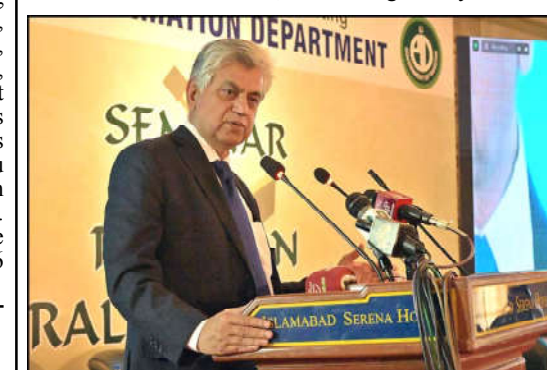
ISLAMABAD: Caretaker Federal Minister for Information & Broadcasting Murtaza Solangi addressing during a seminar on "Pakistan Election 2024: The Economic Reforms Agenda of Political Parties" organize by Press Information Department.

QUETTA (APP) Sui Southern Gas Company (SSGC)'s 12-inch diameter main pipeline supplying gas to Quetta has been severely affected near Dhadar area of Kachhi and gas supply to some areas of Quetta is likely to be affected due pipeline damage. According to Sui Southern Gas Company (SSGC)'s spokesman told APP that a technical team of Sui Southern was dispatched to repair the affected pipeline in order to maintain supply of gas soon to Quetta in winter season. The spokesperson said that we were trying to complete the repair work of the affected pipeline as soon as possible.