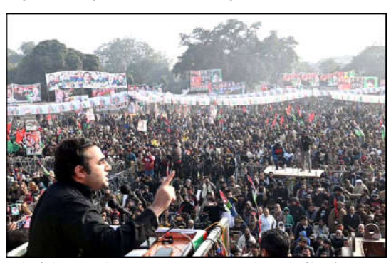
FAISALABAD: Peoples Party (PPP) Chairman, Bilawal Bhutto Zardari addresses to his supporters during public gathering meeting held at Hockey Stadium Tandlianwala in Faisalabad.