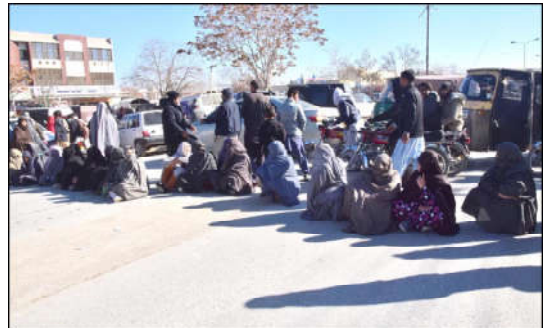
QUETTA: Women residents of Marriabad staging a sit-in against non-provision of gas in front of SSGC office.

A four-member bench, headed by Chief Justice of Pakistan Qazi Faez Isa and comprising Justice Mansoor Ali Shah, Justice Amin ud Din Khan and Justice Athar Minallah, heard the case. It may be mentioned that the LHC had terminated the special court after declaring it against the law.