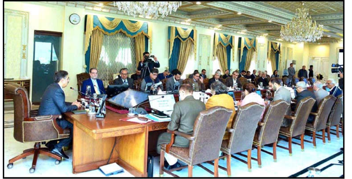
ISLAMABAD: Caretaker Prime Minister Anwaar-ul-Haq Kakar chairs a meeting of the Caretaker Federal Cabinet.

PM Kakar vowed to continue the anti-polio mission of the government till the complete eradication of the crippling disease.