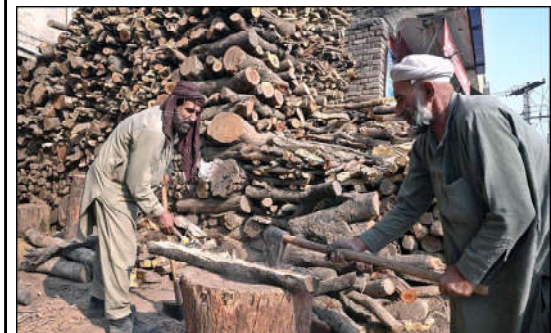
ISLAMABAD: Laborers cutting wood into pieces for selling purpose at his workplace in the Federal Capital.

After Lahore, he said, Business Facilitation Centers (BFCs) were in the final stages of completion in five major cities including Faisalabad. He said the success in election of the Federal Chambers was a manifestation of confidence of the business community in the leadership of UBG.