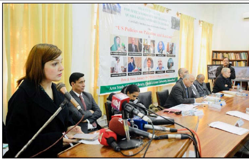
Special Assistant to Prime Minister for Human Rights and Women Empowerment Mushaal Hussein Mullick addressing a seminar on "US policies on the issues of Kashmir and Palestine" Organized by Area Study Center for Africa, North and South America, Quaid-e-Azam University in Islamabad.