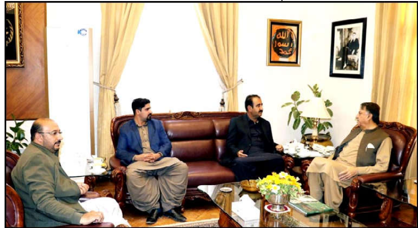
QUETTA: A delegation led by former Federal Minister Agha Hassan Baloch meeting with Governor Balochistan Malik Abdul Wali Khan Kakar

He said that the report has silenced many voices including liberals, pro-Indian journalists and foreign trolls of a political party who are always repeating the same old rhetoric.