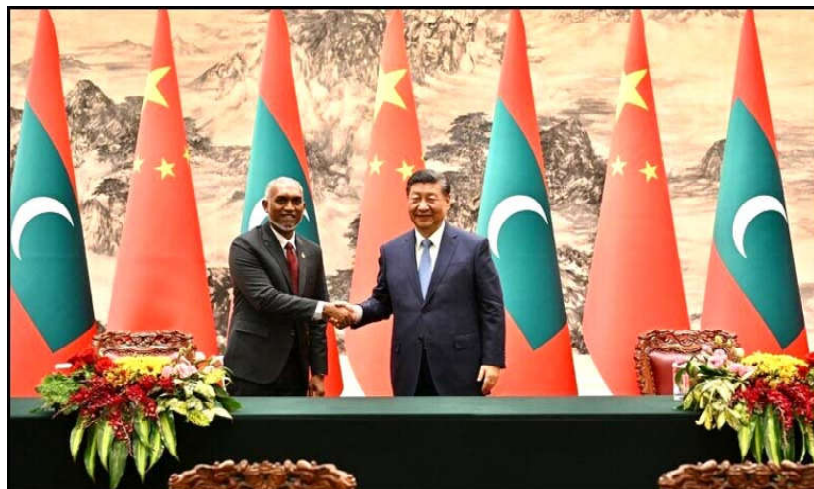
Maldives President Mohamed Muizzu and Chinese President Xi Jinping sign key agreements in Beijing, China.

By upgrading ties with the Maldives, China is setting the stage for further investment in a region where India has already seen another neighbour, Sri Lanka, gravitate towards China. "During the talks, President Dr Muizzu expressed gratitude for China's significant role in the Maldives' economic success... and infrastructure development," a statement from his presidential office read following the meeting, adding that "20 key agreements between the two countries" were signed. The Maldives owes China $1.37 billion, or around 20 per cent of its public debt, according to World Bank data, making Beijing its biggest bilateral creditor ahead of Saudi Arabia and India.