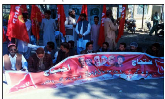
HUB: Activists of Awami National Party (ANP) are holding protest demonstration against prolong sui gas and electricity load shedding and over billing.

Further legal action is also being taken against those involved in the power pilferage, the spokesman informed.