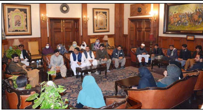
PESHAWAR: A representative delegation of Lecturers appointed under a Project in Government Colleges meeting with Governor Khyber Pakhtunkhwa Haji Ghulam Ali.

MULTAN (APP): A team of food watchdogs disposed of about 1500 liters of substandard milk after holding picket at one of the main external routes of the city. Team of food watchdogs disposed of about 1500 liters of substandard milk after holding picket at one of the main external routes of the city. The checking was conducted at different external and internal routes of the city early in the morning under the supervision of Director Operation South of Punjab Food Authority (PFA) Shahid Maggesi.