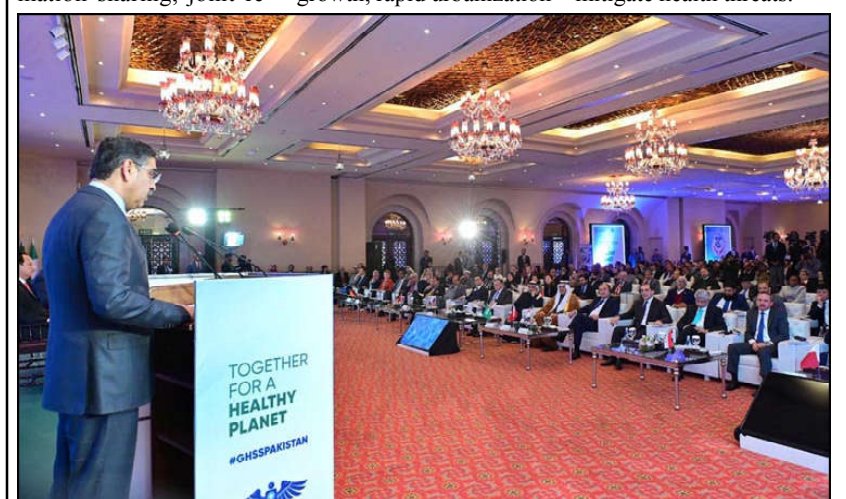
ISLAMABAD: Caretaker Prime Minister Anwaar-ul-Haq Kakar addresses the Global Health Security Summit.

He called for establishing a shared vision of the world where health security was not a privilege but a universal right and where the strength of a nation's health systems was measured not only by its capacity to respond to crises but also by its ability to prevent, detect, and mitigate health threats.