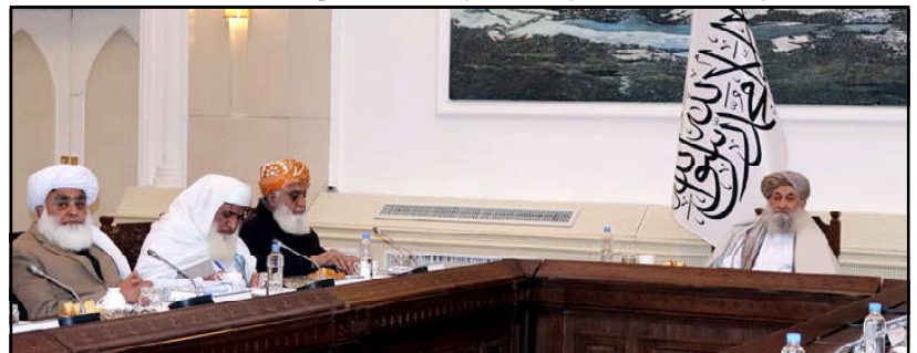
Fazl (JUI-F), that Kabul has no intention of causing harm to Pakistan or any other country. The Afghan premier's

lighted the crucial role of religious scholars in resolving issues and dispelling misunderstandings between Islamabad and Kabul. Fazl was extended an invitation by the interim