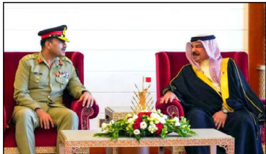
RAWALPINDI: Chief of Army Staff (COAS), General Asim Munir exchanging views with Hamad Bin Isa Bin Salman Al Khalifa, King of Bahrain during meeting held in Bahrain.

Salman bin Hamad Al Khalifa, Field Marshal Khalifa bin Ahmed Al Khalifa, Commander of Bahrain Defence Forces and H.H General Shaikh Mohammad Bin Isa Al Khalifa, Commander of Bahrain National Guard.