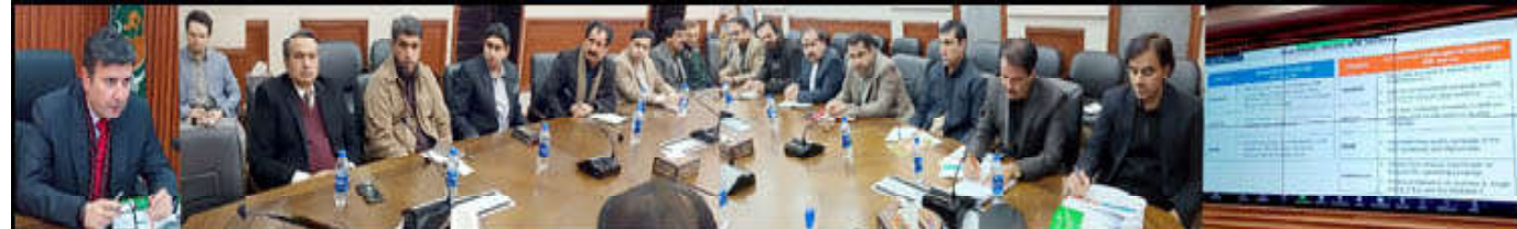
QUETTA: Chief Secretary Balochistan Shakeel Qadir Khan presiding over a meeting of Provincial Task Force for Prevention of Polio.

found, and also directed all Deputy Commissioners to improve the quality of the campaign and preside over the evening review meeting to achieve the target of the polio drive in the areas of Balochistan. He urged the parents and all schools of thought that they should also play their role in eliminating polio from the country and the province. The concerned official briefed the meeting that a special seven-day anti-polio campaign was started on January 8, Monday across Balochistan saying that during the campaign, more than 25,96,000 children would be administered the polio vaccine, and more than 1,00,000 teams were participating in the polio campaign.