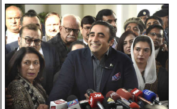
ISLAMABAD: Chairman PPP Bilwal Bhutto Zardari talking with media persons outside Supreme Court

His remarks came days after the Senate approved a non-binding resolution seeking a delay in the general elections, set to be staged next month, drawing strong criticism from mainstream political parties.