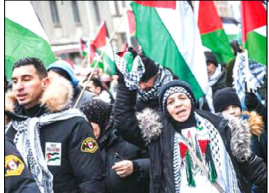
Protesters at the 'All Denmark on the Streets for Palestine Ceasefire Now!' demonstration march from Frederiksberg City Hall to Copenhagen City Hall.

US Secretary of State Antony Blinken said the journalists' deaths were an "unimaginable tragedy". "And that's also been the case for... far too many innocent Palestinian men, women and children."