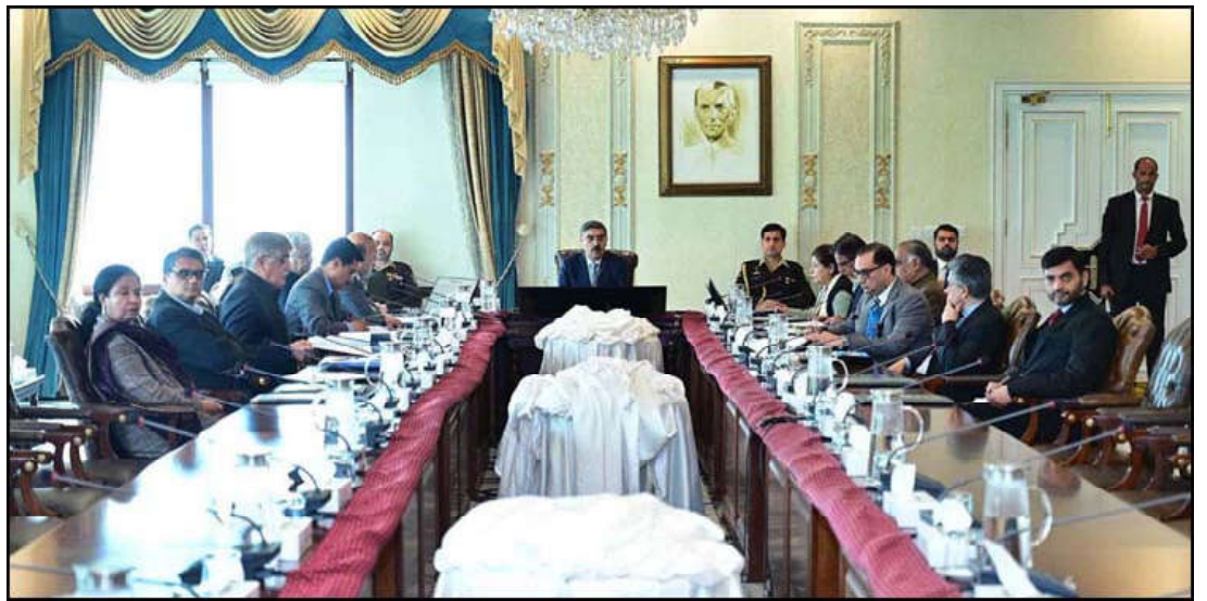
ISLAMABAD: Caretaker Prime Minister Anwaar-ul-Haq Kakar chairs a review meeting regarding Afghan Transit Trade and Anti-Smuggling operations.

caused by the millions of tonnes smuggling of illegal goods. The caretaker prime minister directed for formulation of a comprehensive mechanism for provision of employment opportunities to the local people through social safety and imparting of skill sets. He also directed the Ministry of Trade to ensure strict monitoring of the transit trade and apprise the relevant authorities about the trends over export of goods.