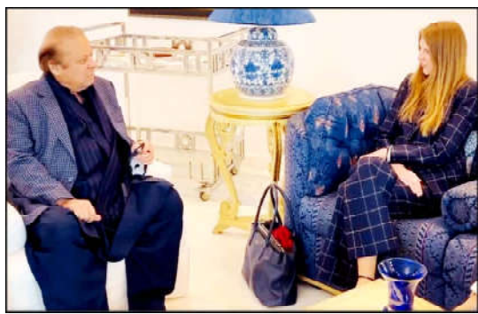
LAHORE: British High Commissioner Jane Marriot meeting with PML(N) quaid Muhammad Nawaz Sharif