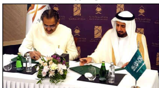
ISLAMABAD (APP): Caretaker Minister for Religious Affairs and Interfaith Harmony Aneeq Ahmed, along with Saudi Minister of Hajj and Umrah Dr. Tawfiq bin Fawzan Al-Rabiah, signed the annual Hajj agreement between Pakistan and Saudi Arabia.

According to the spokesman of the Ministry of Religious Affairs and Interfaith Harmony, Minister for Religious Affairs and Interfaith Harmony Aneeq Ahmed had unveiled the Hajj policy for 2024 in November 2023.