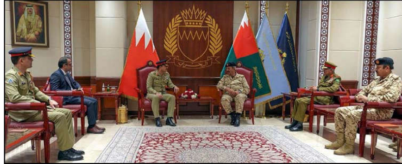
RAWALPINDI: Chief of Army Staff (COAS), General Asim Munir exchanging views with Field Marshal Khalifa Bin Ahmed Al Khalifa, Commander of Bahrain Defence Forces and General Shaikh Mohammad Bin Isa Al Khalifa, Commander of Bahrain National Guard during meeting held in Bahrain