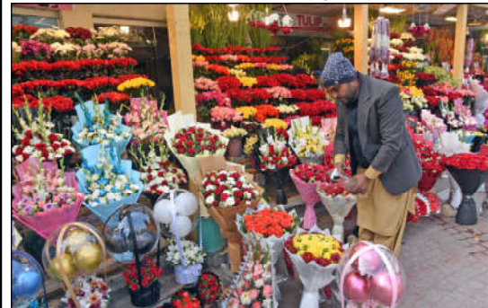
ISLAMABAD: A florist is sparing water on the flowers for preserving their freshness, F-6 Flower Market in Federal.