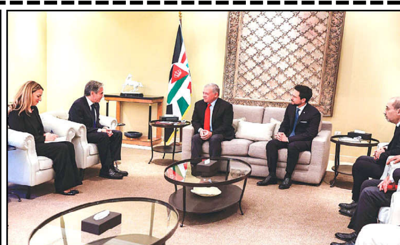
AMMAN: Jordan's King Abdullah II speaks to US Secretary of State Antony Blinken, as the latter arrived in the Middle East to ensure the violence in Gaza does not spread.

An Israeli strike on south Lebanon on Monday killed a senior commander in Hezbollah's elite Radwan force, three security sources told Reuters, the latest in daily clashes across Israel's northern border.