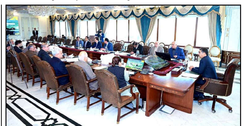
ISLAMABAD: Caretaker Prime Minister, Anwaar-ul-Haq Kakar chairs a meeting on the matters related to National Highway Authority (NHA), in Islamabad.

"The interpretation of Article 62(1)(f) in imposing a lifetime disqualification upon a person through an implied declaration of a court of civil jurisdiction while adjudicating upon some civil rights and obligations of the parties is beyond the scope of the said Article and amounts to reading into the Constitution.