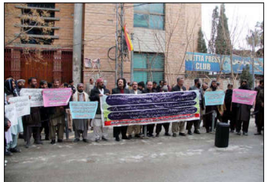
QUETTA: Members of Joint Action Committee University Teachers Officer and Employees Association are holding protest demonstration against the non-payment of their dues salaries.