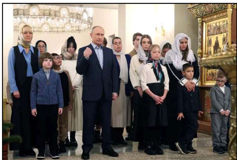
Russia's President Vladimir Putin attends the Orthodox Christmas liturgy at a cathedral on the territory of the Novo-Ogaryovo state residence outside Moscow, Russia.

State television footage showed the Russian leader attending with a small group of families of soldiers killed an intimate mid-night service, known as the Divine Liturgy, later on Saturday at a chapel at his residence in Novo-Ogaryovo outside Moscow. There was no call from Putin this year for a ceasefire in Ukraine to coincide with the holiday, which many Orthodox Christians celebrate on Jan. 6-7 - as was the case a year ago.