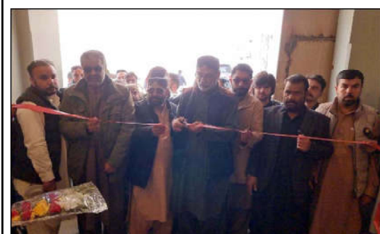
QUETTA: Senior Politician, Nawabzada Haji Lashkari Raisani cutting ribbon during the inauguration ceremony of Grand Democratic Alliance (GDA) Election Office, in Quetta.

Independent Report QUETTA: The preliminary lists of the polling stations of respective election constituencies have been published by all Returning Officers in Balochistan on Sunday. This was announced by the Provincial Election Commissioner of Balochistan, Ejaz Anwar Chohan in an official statement issued here on Sunday. The PEC said that any voter or candidate can submit the objection on the preliminary lists of polling stations to the District Returning Officers by January 11, 2024. The DROs would give judgments on the objections or suggestions by January 17, 2024. According to the PEC, the final lists of polling stations would be displayed before 15 days of the general elections.