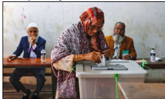
An elderly woman puts ballot paper inside a ballot box after casting her vote in the morning during the 12th general election in Dhaka, Bangladesh.