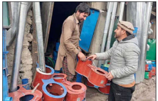
GILGIT: A vendor selling a traditional steel fire stove to the customer at his work place.

As the average annual economic growth between 2010 and 2023 has been lackluster, around 4 percent, and has been accompanied by a rise in Pakistan's total debt as a share of its GDP, from 55 percent to 76 percent.