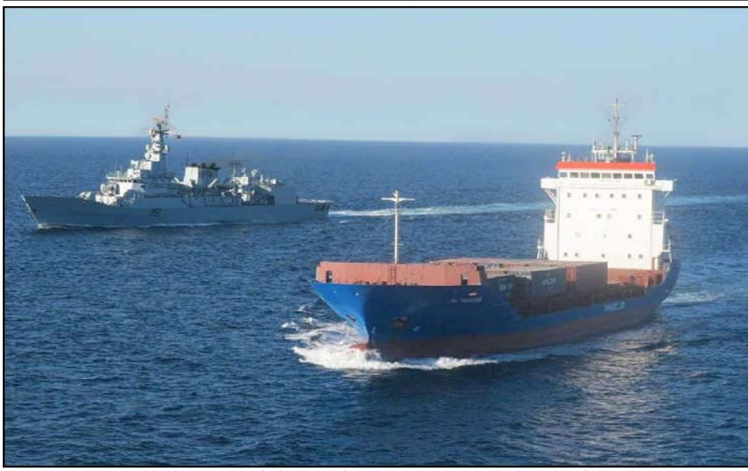
Pakistan Navy Ship escorting merchant vessel in Arabian Sea.