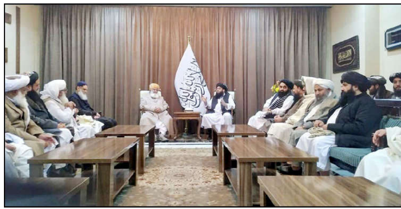
KABUL: Ameer Jamiat-e-Ulema Islam (JUI) Maulana Fazal ur Rehman along with delegation meeting with Vice Prime Minister Afghanistan Maulvi Abdul Kabeer.