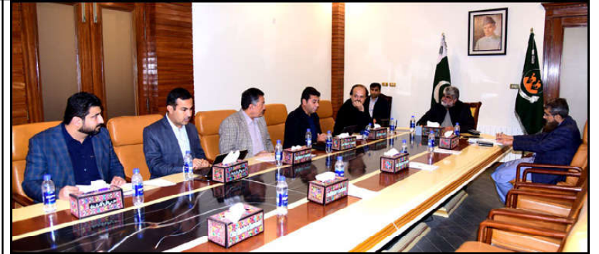
QUETTA: Caretaker Chief Minister Balochistan Mir Ali Mardan Khan Domki chaired a meeting to review ongoing projects of Irrigation Department.

Speaking on the occasion, Chief Minister directed to take steps for bringing improvement in performance of BDA by decreasing the non-development expenditures so as to create balance.