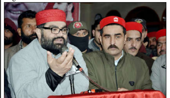
CHARSADA: President Awami National Party (ANP) Aimal Wali Khan addressing public those who joined party at NA-125 during election campaign.

He said a conspiracy had been hatched to create a rift between different ethnicities in the country. "Have we ever realized that the blood that sheds as a result of this conspiracy benefits our enemies," he added. The minister said that militant outfits like BLA exist in Balochistan.