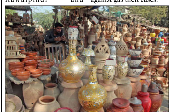
KARACHI: A vendor is displayed fancy plants pots attraction for customers at his roadside setup Kumhar Wara area in Provincial Capital.

In Peshawar and Karak, the company disconnected 93 connections on account of direct use of gas and illegal use of gas and also imposed fine of Rs 3.05 million against gas theft cases.