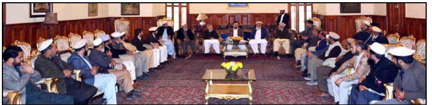
PESHAWAR: A delegation of 30-members tribal elites of merged District Mhmand meeting with Khyber Pakhtunkhwa Governor Haji Ghulam Ali.