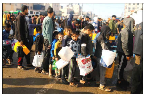
A general view of a tent camp sheltering displaced Palestinians, who fled their homes due to Israeli strikes, amid the ongoing conflict between Israel and the Palestinian Islamist group Hamas, in Rafah, southern Gaza Strip.

USV's are a key part of the Houthi maritime arsenal and were used during previous battles against the Saudi coalition forces that intervened in Yemen's war. They have regularly been used as suicide drone boats that explode upon impact. Most of the Houthi's USVs are likely assembled in Yemen but often fitted with components made in Iran, such as computerized guidance systems, Hinz said. At the United Nations, U.S. deputy ambassador Christopher Lu said at an emergency Security Council meeting on Wednesday that Iran has supplied the Houthi with money and advanced weapons systems, including drones, land attack cruise missiles and ballistic missiles. He said Iran also has been deeply involved in planning the Houthi's attacks on commercial vessels in the Red Sea.