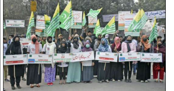
LAHORE: Activists of Youth Forum for Kashmir holds placards and shouting slogans during protest against the Indian oppression, to mark the Self-Determination Day, in Provincial Capital.

education expo. He said that the young generation is the valuable asset of the country, adding that it is important to provide them with proper guidance in the field of education. He said that the purpose of education is to impart knowledge to the youth and make them life-long learner. He said that it is very important to inculcate the habit of reading books among the students. He said that in this age of technology, e-books are also available, but there is no substitute for the satisfaction of reading books traditionally.