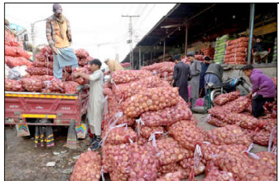
ISLAMABAD: Workers loading onion on delivery rickshaw at vegetable market.

Regarding the steps taken by the government, he informed that around 220,000 tons of urea had been recently imported by the government.