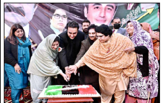
LAHORE: Chairman Pakistan People's Party Bilawal Bhutto Zardari cutting the 96th birthday cake of Shaheed Zulfiqar Ali Bhutto at NA 127 Kot Lakhpat Pindi Rajputan.