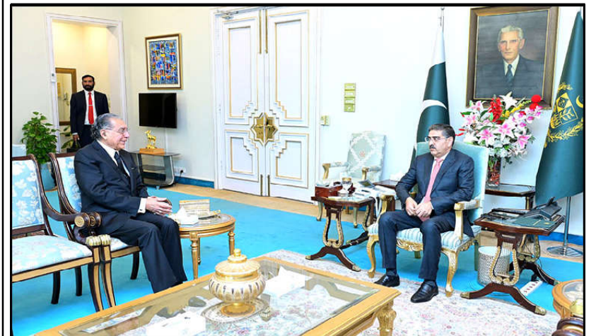
ISLAMABAD: Pakistan's Permanent Representative in UN Mr. Munir Akram calls on caretaker Prime Minister Anwaar-ul-Haq Kakar.

QUETTA: The caretaker Chief Minister Balochistan, Mir Ali Mardan Khan Domki has categorically stated that the Institute of Cardiology Quetta (ICQ) is a state-of-the-art hospital of Balochistan, and it's high standard is no less than any most expensive private hospital of the country. He said that the ICQ is determined to provide quality healthcare facilities to the poor patients of the province. The caretaker Chief Minister was on visit of the Sheikh Muhammad bin Zayed Al-Nahyan ICQ on Friday. During the visit, he visited different sections of the Institute. Speaking on the occasion, the Chief Minister assured that the grant would be ensured for purchase of the items required for the PET scan and nuclear medicines in the Institute. He also assured to release the funds already approved for construction of the road from Kach More to the Institute. Moreover, the facility of transport would also be provided to the patients for movement from and to the Institute of Cardiology. Similarly, the street lights would also be installed from Kach More to the Institute, the caretaker Chief Minister assured further. While on the other hand, the orders are being issued for mobile patrolling after establishing police check post at the Kach More. He assured that the solarization of Institute of Cardiology would also be done to resolve the electricity issues there.