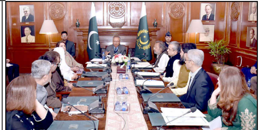
KARACHI: President Dr Arif Alvi chairing a meeting on Inclusive Education for Persons with Disabilities.

ing" that such an esteemed media outlet published an article in the name of an individual who was in jail and had been convicted. The caretaker government, he said, believed that it was critically essential to uphold ethical standards and promote responsible journalism. "We would like to know how the editorial decision was made, and what considerations were taken into account regarding the legitimacy and credibility of the content by The Economist," Solangi said while referring to the article.