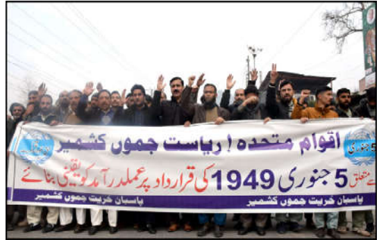
MUZAFFERABAD: Activists of Pashan-e-Hurriyat Jammu and Kashmir holds placards and shouting slogans during protest against the Indian oppression, to mark the Self-Determination Day, in City.

From Czechangez Khan-Jadoon ISLAMABAD: The Foreign Minister, Jalil Abbas Jilani, on the Occasion of Right to Self-Determination Day said that the fifth of January is annually observed as the Right to Self-Determination Day for the people of Jammu and Kashmir. On this day in 1949, the United Nations Commission for India and Pakistan (UNCIP) adopted a resolution that guarantees a free and fair plebiscite in Jammu and Kashmir, to enable the Kashmiri people to realize their right to self-determination. Following its illegal and unilateral actions of 5 August 2019, India's efforts have been aimed at engineering demographic and political changes so that the Kashmiris are reduced to a disempowered community in their own land. The Indian Supreme Court's recent verdict is yet another manifestation of India's desire to undermine the right to self-determination of the Kashmiri people. India is also subjecting the Kashmiri people to systematic human rights violations. It has created an environment of fear to crush dissent in IIOJK.