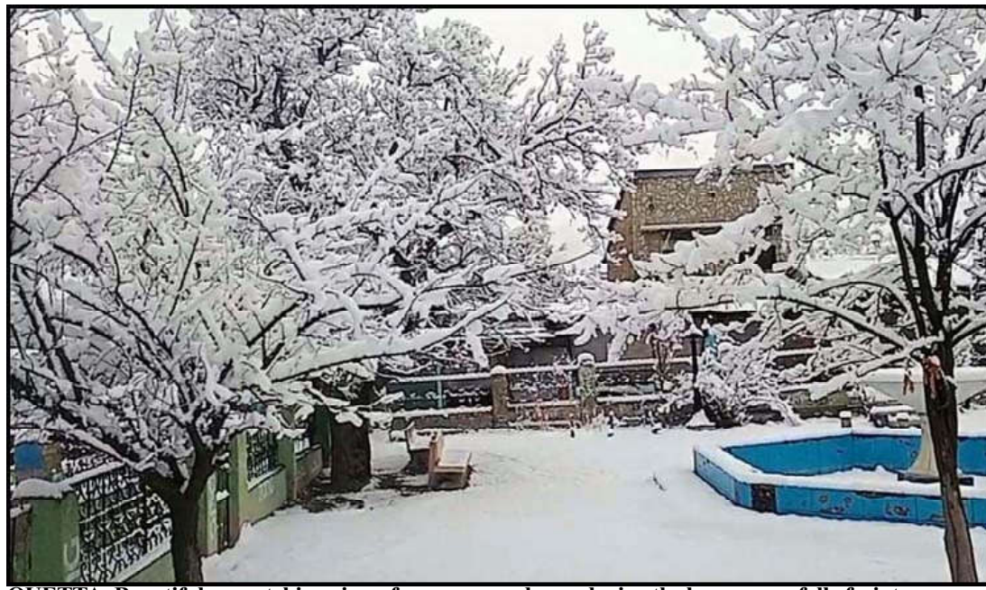
QUETTA: Beautiful eye catching view of snow covered area during the heavy snowfall of winter season, which more decreases the temperature below in minus degree Celsius, in Ziarat.