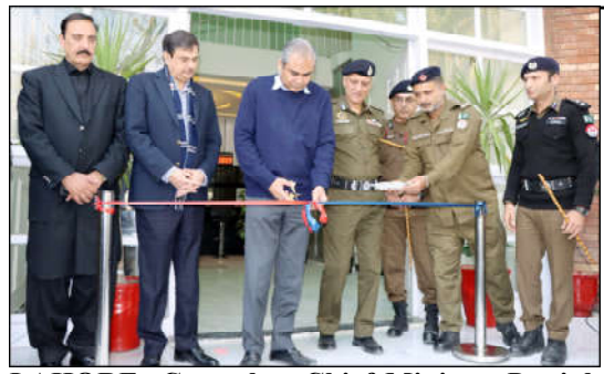
LAHORE: Caretaker Chief Minister Punjab Mohsin Naqvi cutting a ribbon of Police Station (Saddar) under Police Station up gradation project.

beauty creams and cosmetics, while experts from the PHC will assess clinical practices. This information was shared by the minister in a press conference held here on Friday. He stated that non-standard creams claiming to lighten skin are causing diseases, adding that the use of substandard beauty creams is causing severe damage to the skin of hundreds of individuals. He said that some cosmetics contain dangerous amounts of lead, toxins, and other harmful chemicals, leading to life-threatening diseases such as liver and kidney cancer.