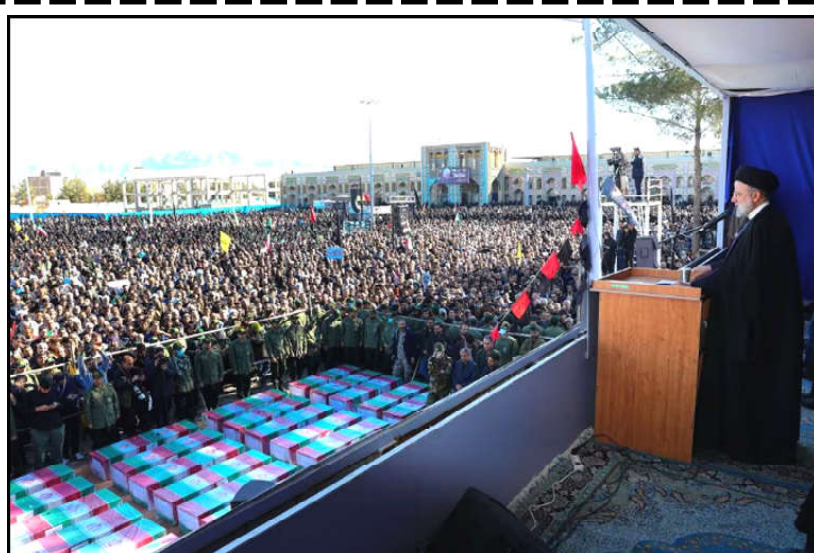
Iran's President Ebrahim Raisi speaks during a funeral ceremony in Kerman, Iran.