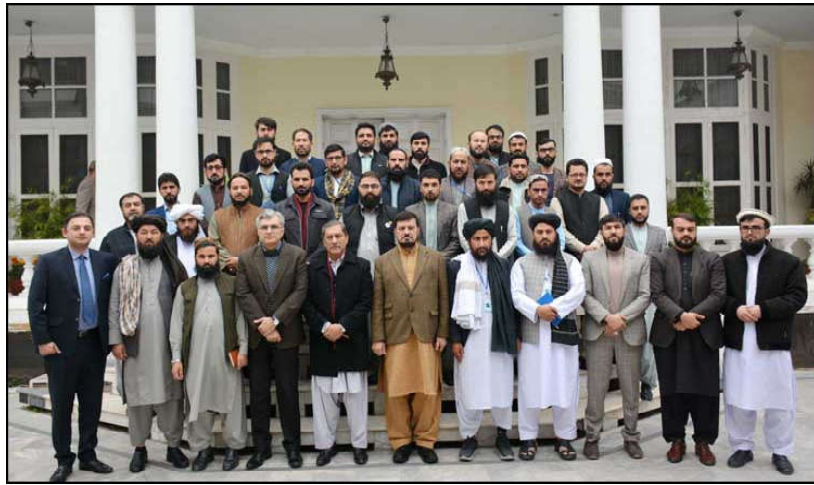
PESHAWAR: Khyber Pakhtunkhwa Governor Haji Ghulam Ali in a group photo with delegation of faculty members of Afghanistan Universities during their visit to Peshawar.

Haji Ghulam Ali said that Afghan students should be provided education and technology to remove backwardness and induce development. He also highlighted significance of higher education institutions for development of a nation. On the occasion, governor was told that one month capacity building course is underway in IM Sciences for Afghan professors, assistant professors and lecturers. He was informed that various courses would be arranged for Afghan professionals in second phase.