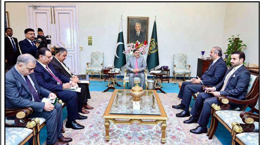
ISLAMABAD: Amb. Ali Mubarak Ali Essa Al-Khater, Ambassador of the State of Qatar in Pakistan calls on Caretaker Prime Minister Anwaar-ul-Haq Kakar.

reaffirmed by the UN General Assembly in its annual resolution on self-determination. However, the last 76 years of India's occupation of Indian Illegally Occupied Jammu and Kashmir (IIOJK) are a sad story of repression of the people of Jammu and Kashmir. "India is trying to consolidate its occupation of IIOJK. The Indian Supreme Court's judgment of 11th December 2023 on the status of this disputed territory is the latest step in this direction. India is striving to subjugate the Kashmiris through such oppressive tactics further. It continues to deny their inalienable right to self-determination and live with freedom and dignity.