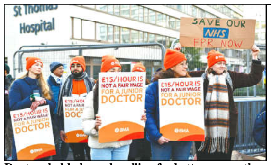
Doctors hold placards calling for better pay, as they stand on a picket line outside London's St Thomas Hospital on the first day of strike action.

tober 2022, taking over from the short-lived Liz Truss after Boris Johnson quit following a series of scandals. Speculation has been mounting about when Sunak will decide to hold the vote, as he tries to drive down inflation that peaked at nearly 11 percent and reboot economic growth. "My working assumption is we'll have a general election in the second half of this year," he told reporters. Sunak refused to rule out holding the poll on May 2 to coincide with local elections but indicated he wanted more time to get the economy back on an even keel. "I want to keep going, managing the economy well and cutting people's taxes. But I also want to keep tackling illegal migration," he said, referring to another key pledge. "So, I've got lots to get on with and I'm determined to keep delivering for the British people."