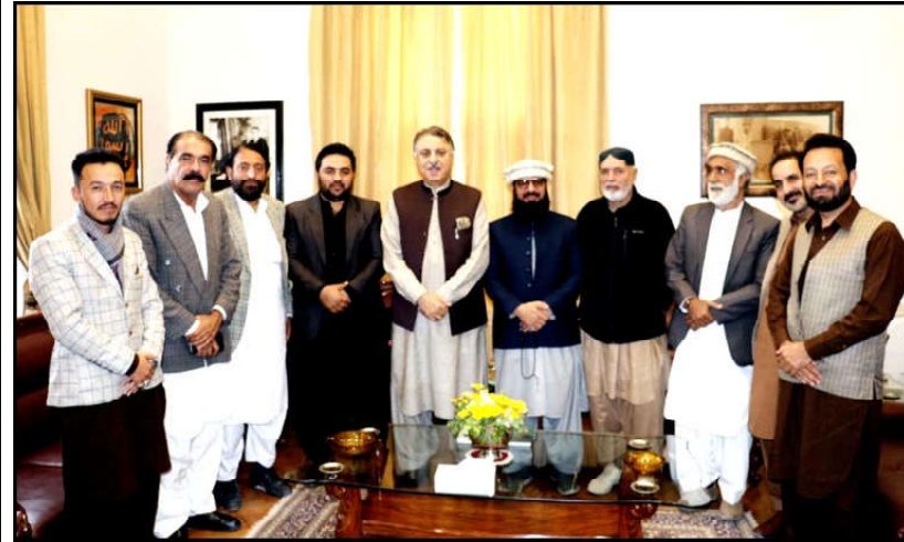
QUETTA: A delegation of Balochistan Private Schools Association Alliance meeting with Governor Balochistan Malik Abdul Wali Khan Kakar

He then added, "Unless you can show that the ECP and the election tribunal can also disqualify for life, then that power will also be with the SC, otherwise it will be an additional power given to the Supreme Court under Article 62(1)(f)."