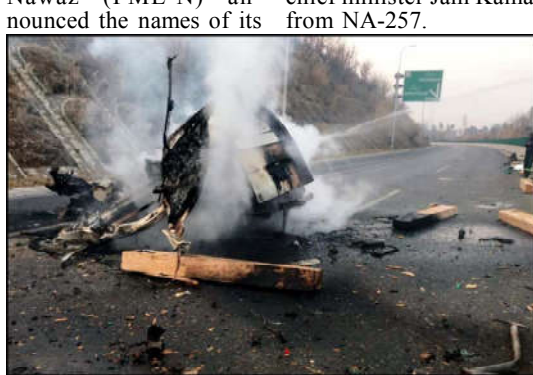
ABBOTTABAD: Smoke rising after fire broken out incident in a vehicle as the rescue 1122 workers are busy in extinguishing fire, near Qalandarabad Interchange in Abbottabad.

HARIPUR (INP): Power shortages are on the rise due to the closure of 15 production units after the reduction in water release from Tarbela Dam reported on Thursday. According to the Public Relations Department of Tarbela Dam, it has been reported that only two units are currently operational, producing 271 megawatts of electricity, leading to an increase in load shedding. The closure of the majority of the power plant's production units has sparked concern about increased load shedding in the region.