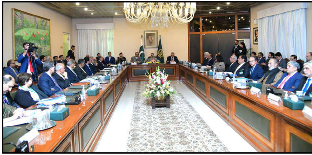
ISLAMABAD: Caretaker Prime Minister Anwaar-ul-Haq Kakar addresses the Envoys' Conference.

International Exercise Barracuda-XII is a Marine Oil Spill exercise and is aimed to enhance capacity and proficiency of National stakeholders to combat the menace of pollution at sea.