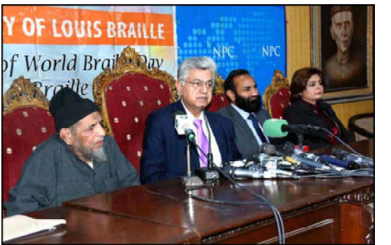
ISLAMABAD: Murtaza Solangi, Caretaker Federal Minister for Information and Broadcasting addressing an event organized by Pakistan Disabled Foundation for special persons at National Press Club.

In his key-note address, the Prime Minister shared his perspective about the pressing demands on the conduct of Pakistan's foreign policy to align it with present-day imperatives.