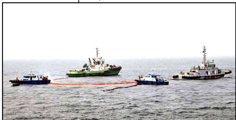
KARACHI: A view of marine oil spill exercise BARRACUDA-XII conducted in Arabian Sea held under auspices of Pakistan Navy and Pakistan Maritime Security Agency.

The operation was carried out on the directives of the District Returning Officer (DRO) Quetta, the District Monitoring Officer and Monitoring Teams. During the operation, the concerned authorities removed the Panaflex and other objectionable posters installed and displayed on highways and top of buildings.