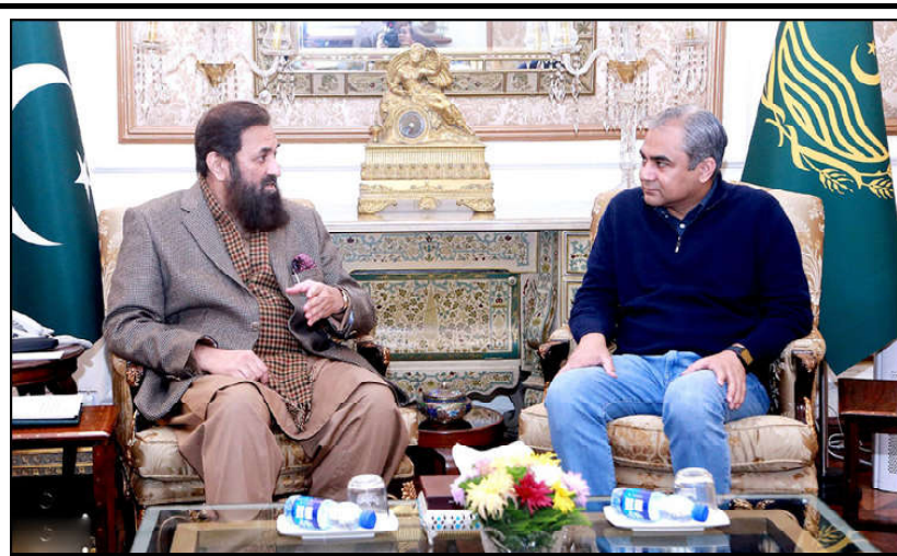
LAHORE: Caretaker Chief Minister Punjab Mohsin Naqvi in a meeting with Punjab Governor Muhammad Baligh-ur-Rehman.

PESHAWAR (APP): The number of terror financing cases has increased during the last year, according to a report by the Counter Terrorism Department Khyber Pakhtunkhwa (CTD KP) released here on Thursday. According to the report released by CTD KP, "it says that there was an increase in terror financing cases during the past six years, and 90 terror financing cases were registered in KP during 2022 and 298 in 2023." A total of 960 people were named in terror financing cases, of which 311 were arrested and 44 were killed, reports said. A sum of Rs 13.46 million was recovered in terror financing, and in the Peshawar region, 46 cases in 2022 and 179 cases in 2023 were registered in that regard. One suspect was convicted in 179 cases of terror financing in the Peshawar region last year, and according to CTD, "Cases have also been registered for providing financial support to terrorists."