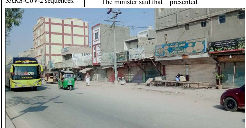
HUB: View of business activities seen closed while markets gives desert look during the shutter down strike called by Baloch Yakjehti Committee against Baloch people genocide, extrajudicial killings, and enforced disappearances