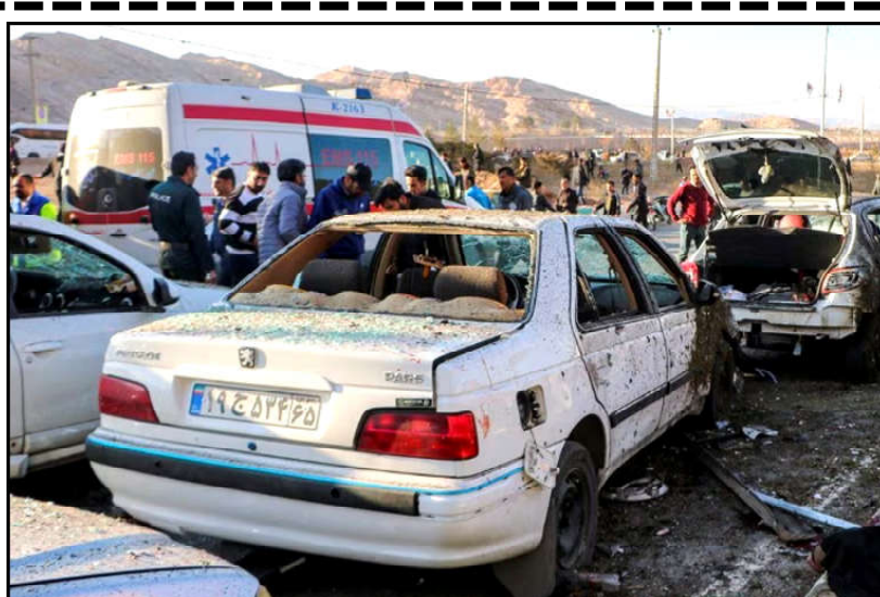
People gather at the scene of explosions during a ceremony held to mark the death of late Iranian General Qassem Soleimani, in Kerman, Iran.

Last week, the Philippines said it was not provoking conflict in the South China Sea.