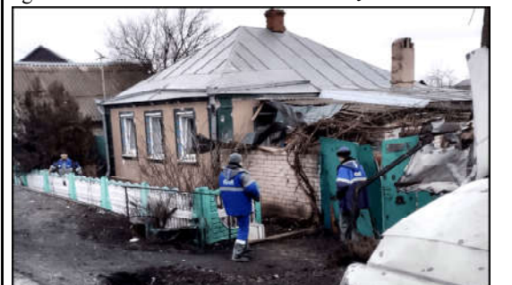
Governor of the Belgorod region, shows aftermath of a missile strike on the region as Moscow said it had downed nine missiles fired by Kyiv.

Putin said Russia would continue to hit what he called "military installations." "We are doing that today and tomorrow we will continue doing it," Putin announced, speaking almost two years into Moscow's military offensive in Ukraine. "What happened in Belgorod is a terrorist act," Putin told wounded Russian soldiers sitting near him in hospital pyjamas and sanitary masks.