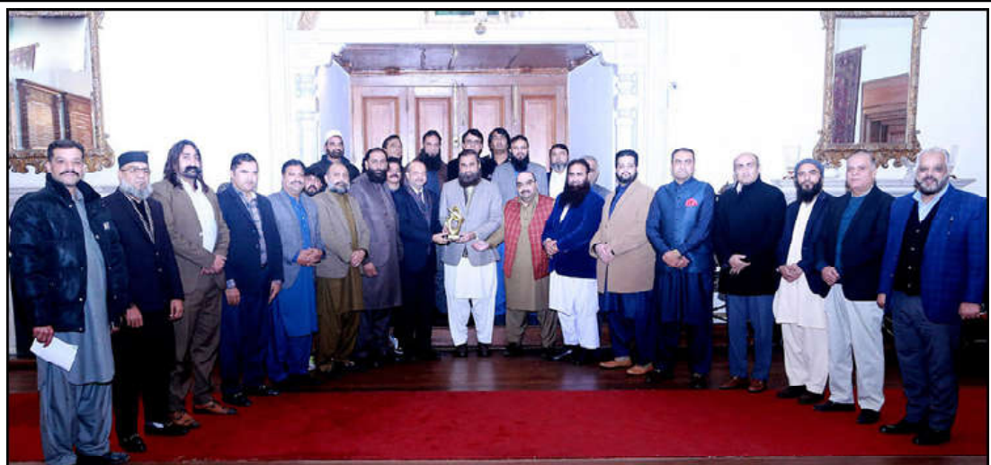
LAHORE: Punjab Governor Muhammad Baligh-ur-Rehman in a group photo with delegation of Anjuman-e-Tajiran led by Waqar Ahmed Mian.

Over 8 million or 80,82,744 bales were converted into bales at ginning factories. Textile sector continued to maintain its position as the biggest buyer with a figure of 73,14,127 bales bought while exporters and traders bought 2,92,126 bales.