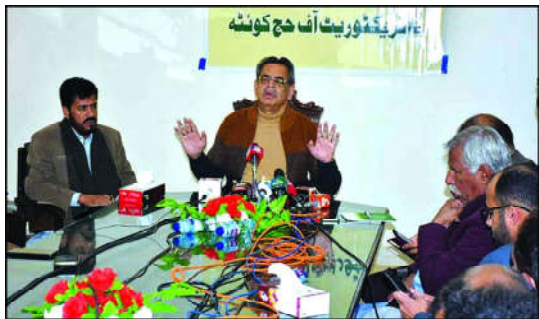
QUETTA: Caretaker Federal Minister for Religious Affairs and Interfaith Harmony Aneeq Ahmed talking to media persons after visiting Hajji Camp.

Responding to different media queries during his visit to the Business Facilitation Center, the prime minister said that terrorists and armed militants had been involved in the killing of people of Balochistan.