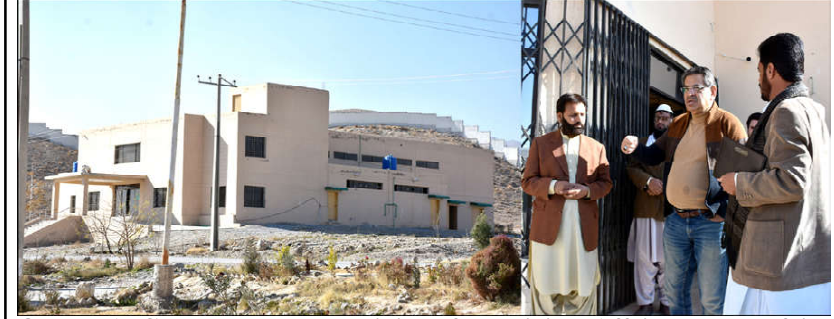
QUETTA: Caretaker Federal Minister for Religious Affairs and Interfaith Harmony Aneeq Ahmed inspecting building of Haji Camp

hard all the paths to there are blocked," Fallah said. The US assassination of Soleimani in a drone attack at Baghdad airport and Tehran's retaliation by attacking two Iraq military bases that house US troops brought the United States and Iran close to full-blown conflict in 2020. As chief commander of the elite Quds force, the overseas arm of Iran's Revolutionary Guard Corps (IRGC), Soleimani ran clandestine operations in foreign countries and was a key figure in Iran's long-standing campaign to drive US forces out of the Middle East.