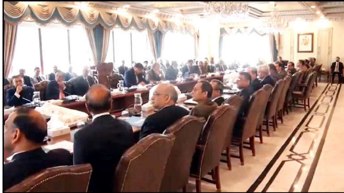
ISLAMABAD: Caretaker Prime Minister Anwaar-ul-Haq Kakar chairs a meeting of 8th meeting of Apex Committee of Special Investment Facilitation Council.

Ph: 2841470/2841473 Vol: XVI No. 211, Jamadi-us-Sani 21, 1445 AH Thursday January 04, 2024, Pages 04, Price Rs.15