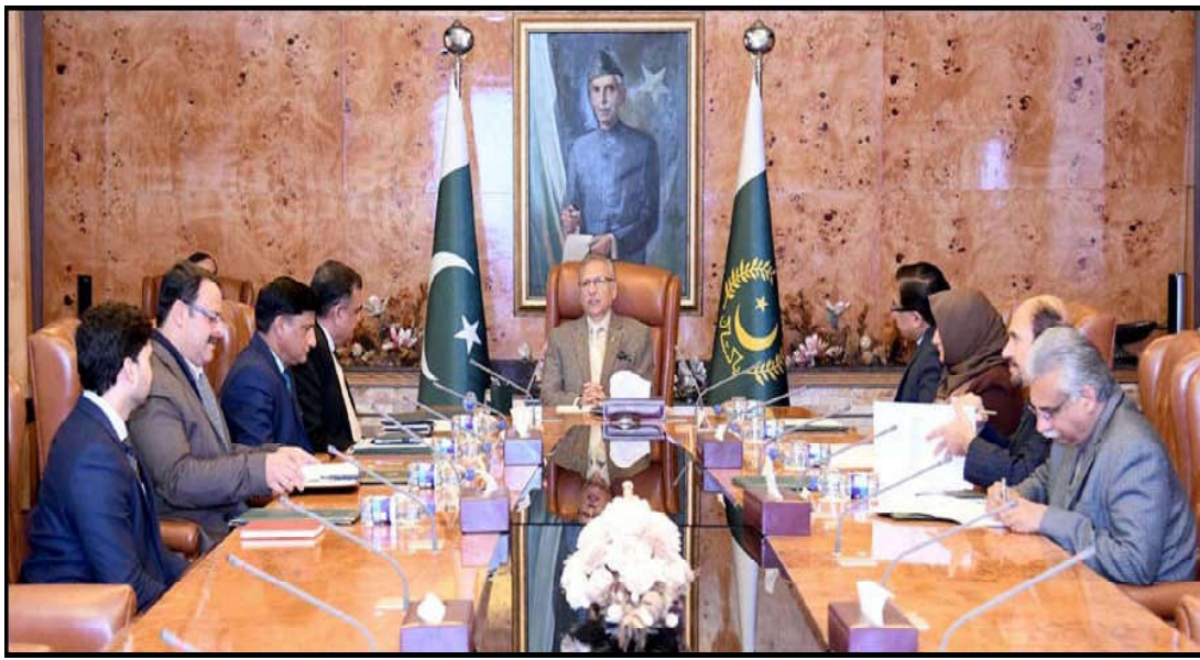
ISLAMABAD: President, Dr. Arif Alvi being briefed about the role and performance of National Book Foundation held at Aiwan-e-Sadr.