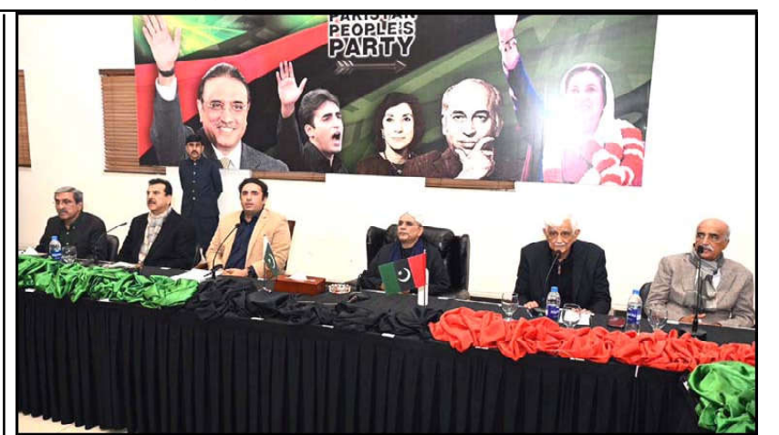
LAHORE: Peoples Party (PPP) Co-Chairman, Asif Ali Zardari and PPP Chairman, Bilawal Bhutto Zardari preside over Central Executive Committee (CEC) meeting of the party held at Bilawal House in Lahore.