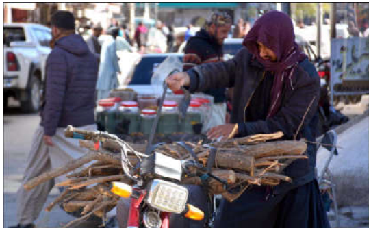
QUETTA: A man tie dry woods on his motorbike before going home for domestic use.