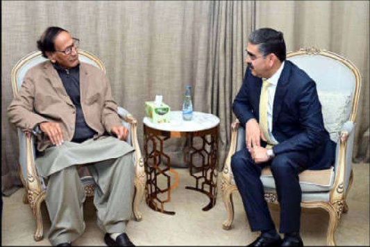
LAHORE: Caretaker Prime Minister Anwaar-ul-Haq Kakar meets with the President of Pakistan Muslim League (Q).

He said: "We want the conduct of the general elections in a peaceful way. There can be political differences, but there is no chance of personal differences."