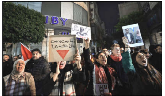
Palestinians protest in solidarity with Gaza in Ramallah, in the occupied West Bank.

noon, prompting people in western coastal areas to flee to higher ground as tsunami waves swept cars and houses into the water. Around 200 tremors were detected since the quake first hit on Monday, according to the Japan Meteorological Agency, which warned more strong shocks could hit in the coming days. A Coast Guard aircraft en route to deliver aid to the quake-hit region collided with a commercial aeroplane in Tokyo's Haneda airport on Tuesday, killing five Coast Guard crew while all 379 on board the Japan Airlines flight miraculously escaped a fire.