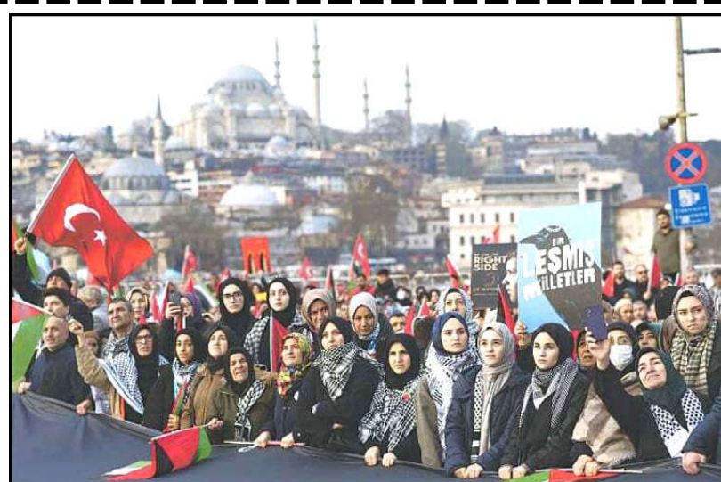
ISTANBUL: Tens of thousands of people demonstrate to show solidarity with the Palestinian people amid the Gaza crisis, at the Galata Bridge.

Monitoring Desk DHAKA: The United Nations will increase the food ration for each Rohingya refugee in Bangladesh by $2 a month, to $10 from Jan. 1, the World Food Programme (WFP) said on Tuesday, as it thanked donors for coming to the rescue of a cash-strapped effort. The United Nations had cut food aid last year to the refugees by a third, to $8 each every month, as it had raised less than half of the $876 million required to support them. Nearly a million members of the Muslim minority from Myanmar live in bamboo-and-plastic camps in Bangladesh's border district of Cox's Bazar, most of them having fled a military crackdown in 2017. The WFP cut the refugees' food entitlement to $10 from $12 in March, and further in June, to stand at $8 each a month, in the wake of a severe funding crunch.