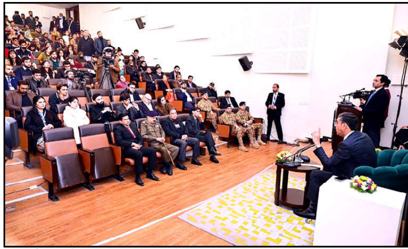
LAHORE: Caretaker Prime Minister Anwaar-ul-Haq Kakar in an interactive session with the students of Beaconhouse National University.

Solangi noted that the Senators had raised important points, whereas the solution lied in the fact that the country had to fix its economy.