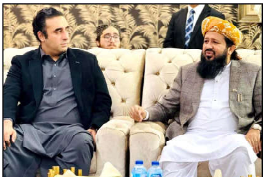
KARACHI: Peoples Party (PPP) Chairman, Bilawal Bhutto Zardari exchanging views with Jamiat Ulema-e-Islam (JUI-F) Sindh General Secretary, Maulana Rashid Mahmood Soomro during condolence meeting on the death of his young daughter, held at his residency located on Model Colony area in Karachi.