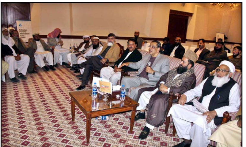
QUETTA: Federal Minister for Religious Affairs and Interfaith Harmony Aneeq Ahmed chairing a meeting with Religious Scholars of various religions.

She said that an upsurge had been witnessed in the registration of harassment and women's property cases with FOSPAAH due to the awareness campaign about its role and functions. She apprised the meeting that harassment of women and denial of property rights to women were pervasive issues in Pakistan. Appreciating the continued support of the President Dr Arif Alvi, she told the meeting that so far 208 representations against the decisions of FOSPAAH had been filed with the President, out of which only 10 were under process with the office of the President while the rest had been decided. The President called for taking appropriate legislative measures at the federal and provincial levels to ensure the protection of women's property rights, besides discouraging the transfer of property by women to their family members due to pressures. He said that he was conducting personal hearings of the Ombudsperson's cases to expedite the process of justice. He stated that highlighting important decisions of FOSPAAH in harassment and women's property cases through media would help increase awareness about the role of the Ombudsman. He said that police at the local level needed to improve their response to women's complaints in property cases, adding that police officials should be educated about the provisions of the Enforcement of Women's Property Rights Act, 2020.