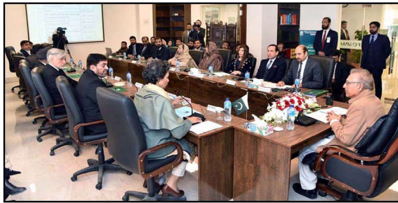
ISLAMABAD: President Dr Arif Alvi chairing a meeting during his visit to the Federal Ombudsman Secretariat for Protection Against Harassment at Workplace (FOSPAAH) Head Office.

The representatives of these areas have never understood the people there what they want. What does the unemployed youth want?