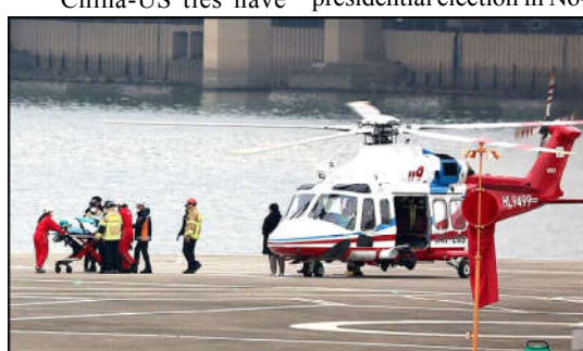
South Korean opposition party leader Lee Jae-myung, who was attacked in Busan, gets off from a helicopter on a stretcher to be transported to Seoul National University Hospital, at a heliport in Seoul.

vember, in which former president and outspoken critic of China Donald Trump is campaigning against Biden to come back for a second term. Xi also exchanged New Year's messages with North Korea leader Kim Jong Un, and both announced 2024 to be a "friendship year" for both countries, launching a series of activities for that, the Chinese foreign ministry said separately. Xi said China is willing to work with North Korea to deepen strategic mutual trust, enhance exchanges and cooperation, promote greater bilateral ties and make new contributions to the maintenance of peace and stability in the region. On New Year's Eve, the Chinese leader exchanged greetings with Russian President Vladimir Putin as well.