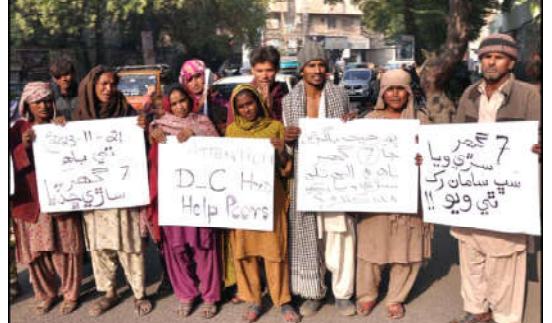
HYDERABAD: Residents of Gul Goth Muhammad Jakro are holding protest demonstration for acceptance of their demands, at Hyderabad press club.

the initiative requires skilled professionals in IT, mining engineering, and accounting. A request for relaxation in new recruitment has been sent to the Chief Minister's office. The minister highlighted the importance of digitalization for enhancing the corporation's efficiency, citing its profitability due to effective government strategies. He noted the positive impact of increased industrial salt prices on government revenue. Stressing the need for continued improvement, the minister instructed PUNJMIN to implement e-bidding and e-auction systems to curb corruption.