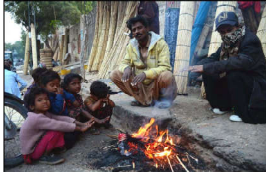
HYDERABAD: People warm their hands on bonfire to save themselves from cold waves during the winter season, in Hyderabad.

Tobacco Control brought his attention to a pressing issue that is affecting the youth of the province. "The leadership of Governor, Haji Ghulam Ali can set a precedent for other provinces of Pakistan, showcasing Khyber Pakhtunkhwa as role model for proactive and preventive health governance," reads the letter. A concerning rise in use of e-cigarettes and vapes has been observed among youngsters in Khyber Pakhtunkhwa, adds the letter.