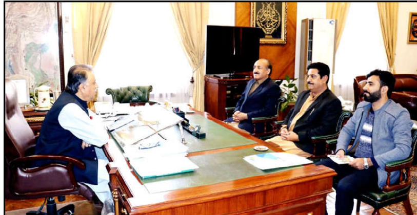
QUETTA: A delegation of Taraqi Foundation led by Essa Khan Kakar meeting with Governor Balochistan Malik Abdul Wali Khan Kakar

About a question related to Gaza, the caretaker prime minister said that Israel was displaying a force of brutality with impunity.