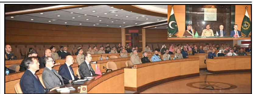
RAWALPINDI: A view of meeting of Trilateral Defence Collaboration between Pakistan, Saudi Arabia and Turkiye.