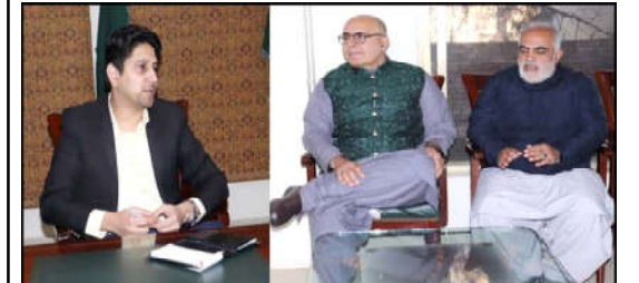
QUETTA: Caretaker Information Minister Jan Achakzai meeting with Deputy Commissioner Quetta Lt. (Retd) Saad bin Asad