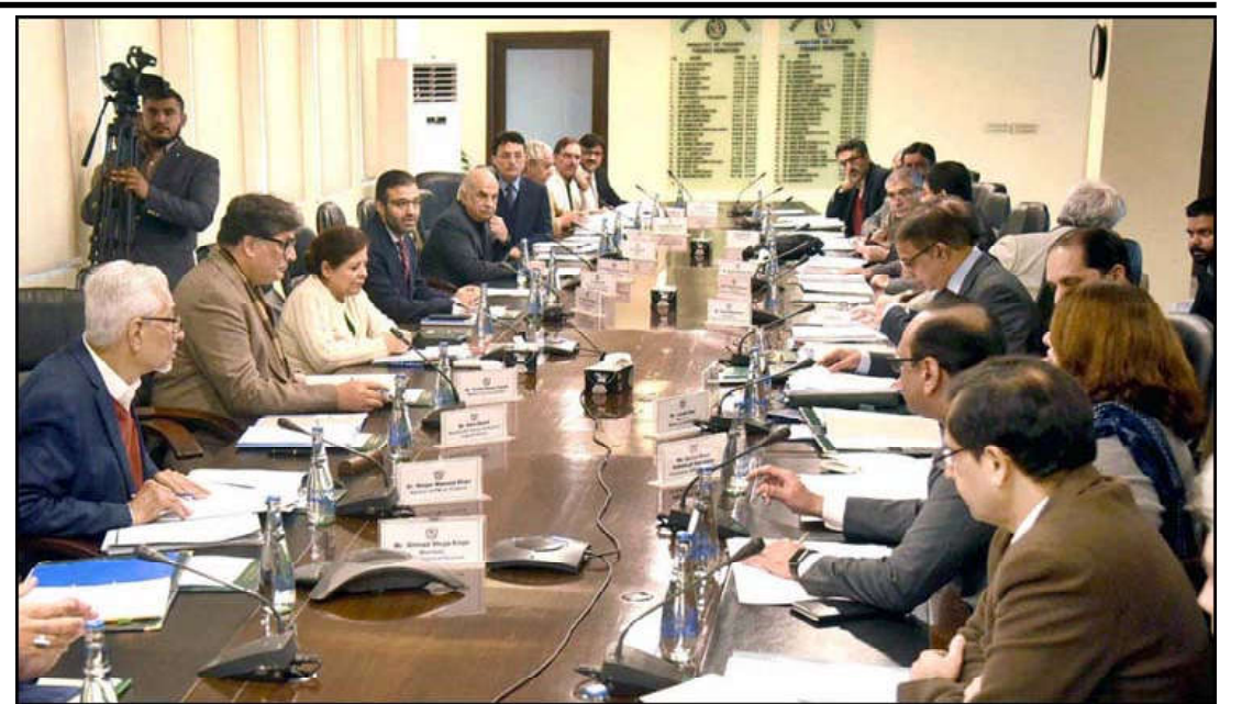
ISLAMABAD: Caretaker Federal Minister for Finance, Revenue and Economic Affairs, Dr. Shamshad Akhtar chairing a meeting of Economic Coordination Committee of the Cabinet.

The ECC approved the funds as a Technical Supplementary Grant (TSG) for up-gradation, technical enhancement and field activities of the Intelligence Bureau with releases on a need basis. The committee considered and approved the summary of National Health Services Regulation and Coordination for the provision of Technical Supplementary Grant (TSG).