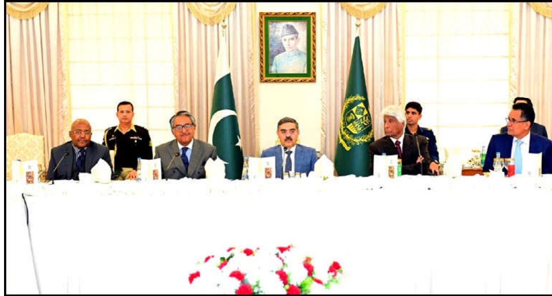
ISLAMABAD: Caretaker Prime Minister Anwaar-ul-Haq Kakar meets a group of Envoys from African and Asian Countries.

Ph: 2841470/2841473 Vol: XVI No. 216, Jamadi-us-Sani 27, 1445 AH Wednesday January 10, 2024, Pages 04, Price Rs.15