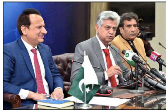
ISLAMABAD: Caretaker Federal Minister for Information and Broadcasting, Murtaza Solangi and Caretaker Federal Minister for Health Dr. Nadeem Jan addressing a press conference at PID Media Center.

KARACHI (INP): The MQM-Pakistan and the PML-N have agreed over seat adjustment on Karachi's seats for the general election next month. The sources sharing details of the meeting between the committees of two parties said that the PML-N will field its candidates on the national and provincial assemblies' seats of Karachi in NA-229 and NA-230. The MQM-P will field its candidates on NA-231 and its provincial constituencies. Both parties decided that the PML-N will field its candidate in national assembly constituency of NA-239 in Karachi South district. The issue of seat adjustment on the NA-242 constituency of Keamari district is pending and it will be decided in next 48 hours, sources said. PML-N President Shehbaz Sharif and MQM leader Mustafa Kamal are the candidates from NA-242.