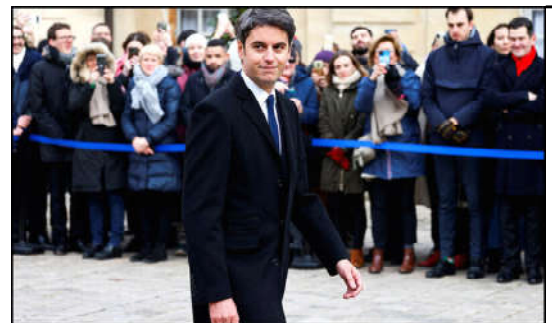
France's newly appointed Prime Minister Gabriel Attal arrives for the handover ceremony with outgoing Prime Minister Elisabeth Borne at the Hotel Matignon in Paris, France.

"I know of your own efforts, over many years, to build much greater connectivity and integration in the Middle East, and I think there are actually real opportunities there," he told his Israeli counterpart Israel Katz on Tuesday.