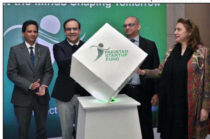
ISLAMABAD: Caretaker Federal Minister for IT & Telecommunication Dr. Umar Saif Launch Pakistan Startup Fund during ceremony organized by Ignite and Ministry of IT & Telecommunication.