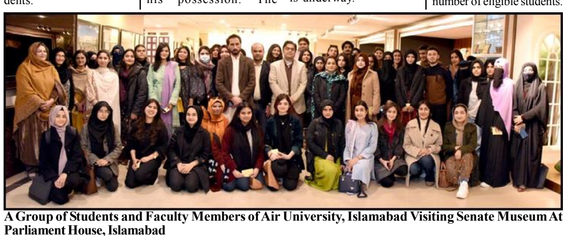
A Group of Students and Faculty Members of Air University, Islamabad Visiting Senate Museum At Parliament House, Islamabad