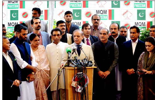
KARACHI: Former Prime Minister and Muslim League (PML-N) President, Shehbaz Sharif along with Khalid Maqbool Siddiqui, Convener Muttahida Qaumi Movement (MQM-P) talking to media persons at MQM-P Bahadurabad Head Office

The COAS said that the dividends of all initiatives by SIFC would help Pakistan come out of the economic crisis.