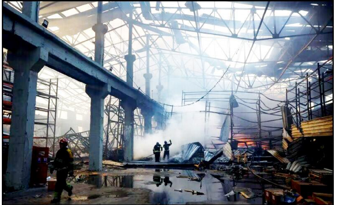
Rescuers work at the site where a residential building was damaged during a Russian missile and drone strike, amid Russia's attack on Ukraine, in Odesa, Ukraine

Air Force Commander Mykola Oleshchuk suggested the strike was Russia's largest aerial barrage since the February 2022 invasion, describing it on Telegram messenger as "the most massive attack from the air." Army chief General Valeriy Zaluzhnyi said the attack targeted critical infrastructure and industrial and military facilities. There was no immediate comment from Russia. The energy ministry reported power outages in the regions of southern Odesa, northeastern Kharkiv, central Dnipropetrovsk and central Kyiv. Ukraine has been warning for weeks that Russia could be stockpiling missiles to launch a major air attack on the energy system. Last year millions of people were plunged into darkness when Russian strikes pounded the power grid. Five people were killed in the central region of Dnipropetrovsk where missiles hit a shopping center, a privately-held home and a six-storey residential building. One person was confirmed dead at a warehouse in Kyiv, Mayor Vitali Klitschko said, revising down an earlier toll of two. Residential buildings and an uninhabited building were also hit, a senior military official said.