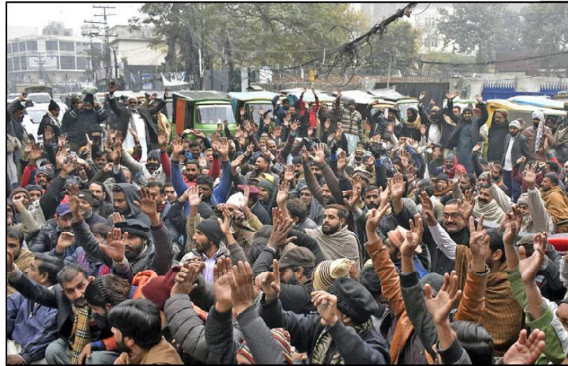
LAHORE: Activists of Rickshaw Union holds protest in the favor of their demands outside press club in Provincial Capital.