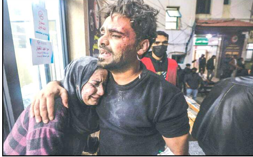
RAFAH: An injured Palestinian man comforts a relative outside the Kuwait hospital, in the southern Gaza Strip, following an Israeli army strike that left at least 20 dead and 55 wounded