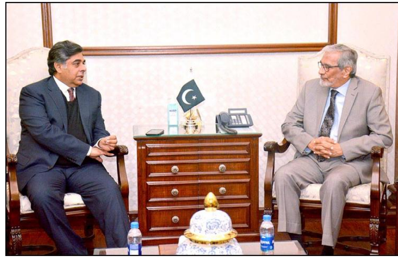
KARACHI: Caretaker Federal Minister for Commerce and Industries & Production Dr. Gohar Ejaz calls on with Caretaker Chief Minister Sindh Justice (Rtd) Maqbool Baqar at CM House.