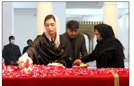
GARHI KHUDBUX: Peoples Party (PPP) Leader, Aseefa Bhutto Zardari is laying floral wreaths and offers Fateha for the peace of departed soul of the PPP Founder, Zulfiqar Ali Bhutto and Benazir Bhutto, at Bhutto Mausoleums in Garhi Khuda Bux.

The minister and the head of private educational institutions deliberated on the possibilities of expanding the network of the above-mentioned schools in the merged districts and also discussed the matters of public partnership proposal for some government educational institutions in the same districts. In the meeting, the minister said that the provincial government was considering several useful proposals to maintain the high quality of 10 governor model schools, established in the merged districts and to run them in a better manner.