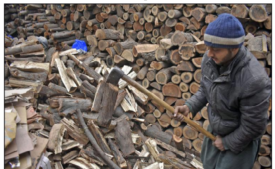
LAHORE: A worker is busy in cutting the woods at woods stall to meet the customers demand after gas load shedding during the coldest weather of winters in Provincial Capital.

The weekly SPI with the base year 2015-16 =100 covers 17 urban centers and 51 essential items for all expenditure groups.