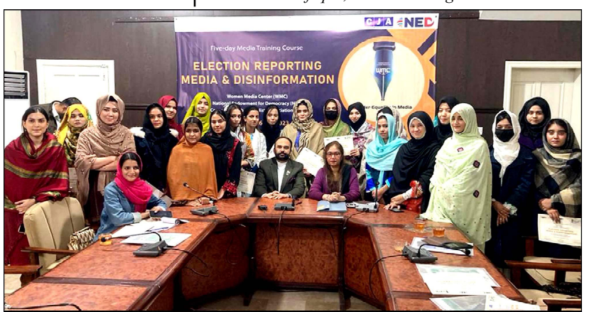
QUETTA: Caretaker Home Minister Captain (retd) Mir Zubair Jamali photographed with participants of a workshop organized by Women Media Center

At the end of the ceremony, the minister distributed certificates among the students who gained the training.