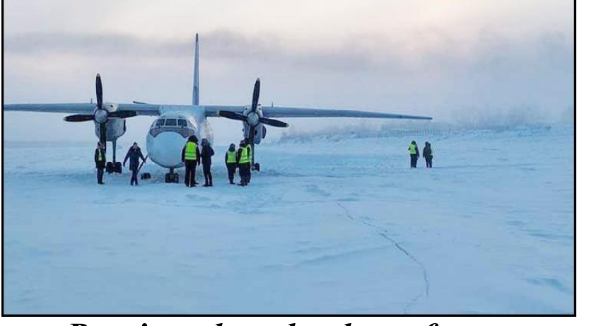
Russian plane lands on frozen river due to pilot error