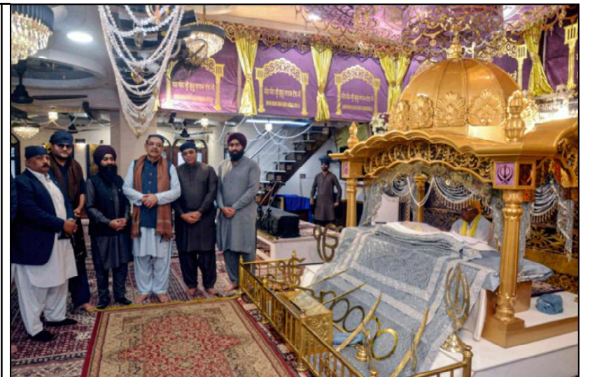
KARACHI: Caretaker Federal Minister for Religious Affairs and Interfaith Harmony Aneeq Ahmed visiting Gurdwara Guru Nanak Darbar Swami Narain Mandir Light House.

Some 10 days ago Rafah was already estimated to be the most densely populated area in Gaza, exceeding 12,000 people per square kilometre, OCHA said, which is more than in New York City. Despite a UN Security Council resolution adopted last week calling for a scale-up in aid deliveries to the enclave, access to people in need has remained overwhelmingly insufficient.