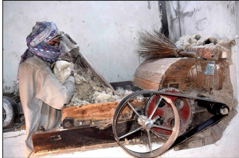
LAHORE: Labourer busy in ginning cotton at his workplace.