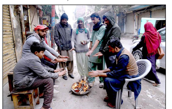
LAHORE: People sitting around fire to keep themselves warm in cold weather in the City.

The DIG Sukkur also directed to strictly enforce traffic laws and to ensure that heavy vehicles follow the times at which they can ply on the main roads like Bander Road, Minara Road, Station Road, Barrage Road, and Workshop road of the town.