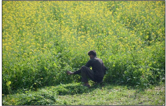
FAISALABAD: A farmer cutting green fodder for animals at his farm field.

The 4th edition of PATDC & SCE will see participation from MENA region including Jordan.