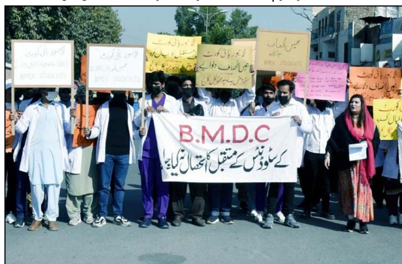
MULTAN: Students of Bahawalpur Medical and Dental College (BMDC) are holding protest rally for acceptance of their demands, in Multan.

He said that the District Bait-ul-Mal Committee was ensuring the distribution of relief funds among the deserving people on merit.