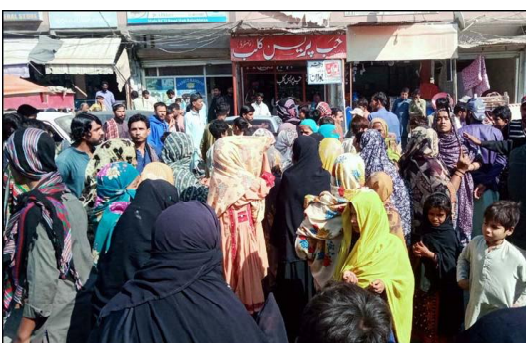
HUB: Members of Civil Society are holding protest demonstration against prolong sui gas load shedding in city, at Hub press club.

In a move aimed at enhancing the pilgrims' experience, the Secretary emphasized the introduction of short-term Hajj facilities within Pakistan. Notably, each pilgrim will receive a suitcase with a network SIM with a QR code, enhancing security and preventing the misplacement of luggage. Moreover, he said the Ministry plans to provide complimentary Pakistani flag-themed abayas for all women pilgrims, along with a free 7GB data card, further enhancing the Hajj journey experience. Unlike previous years, the training period has been doubled, focusing more on practical training than lectures. Pilgrims will undergo training in camps with an emphasis on social interactions and community engagement, addressing issues during the training, he added.