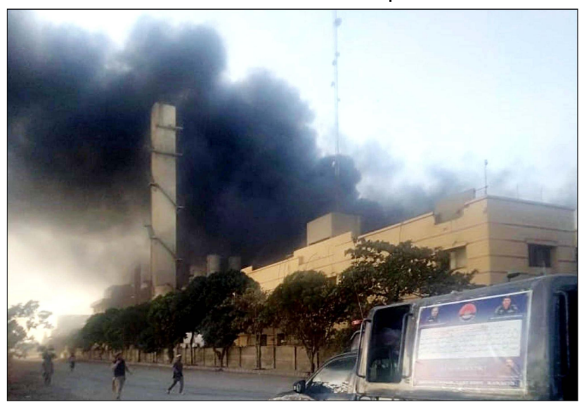
KARACHI: Huge smoke and fire flames rising from burning Agha Steel Mills after fire eruption incident, as rescue operation is underway, at Bin Qasim Town in Karachi

cricket board (PCB), Rauf was given permission earlier this month to make a limited appearance in the BBL, in which the 30-year-old has played four matches and taken six wickets. "I think Haris should be part of this side instead, rather than (the BBL)," Afridi, who led the country in Test cricket, one day internationals and T20 between 2009 and 2016, told reporters on the sidelines of the second Test in Melbourne on Friday. "In these conditions, the kind of pace he has, he would have performed well and enjoyed himself on the kinds of pitches Australia prepared in Perth and here." The third and final Test of the series will be played at the Sydney Cricket Ground from Jan 3.