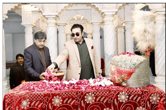
LARKANA: Chairman PPP Bilawal Bhutto Zardari showering flowers at the grave of Shaheed Zulfiqar Ali Bhutto at Garhi Khuda Baksh.

Sources claimed that the former PM will also hold a separate meeting with the Convener, Deputy Convener, and Senior Deputy Convener later after this meeting.