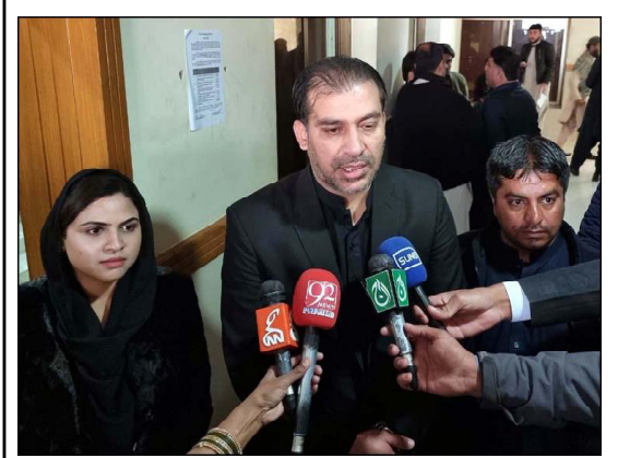
QUETTA: Balochistan Awami Party (BAP) Leader, Mubin Khan talking to media persons after submitting his nomination papers to participate in upcoming General Election 2024, in Quetta.

They said international health organizations were diligently working to eradicate the disease by administering vaccinations to children and Islamic scholars actively supported such initiatives. Despite those efforts, they said, certain elements, driven by ignorance or ulterior motives, continued to obstruct the progress in combating polio. The religious scholars and leaders emphasized that vaccines were a form of medicine, and the teachings of the Holy Prophet (Peace Be Upon Him) regarding the use of medicine.