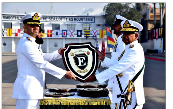
KARACHI: Chief of the Naval Staff, Admiral Naveed Ashraf giving away efficiency shield to the winning unit of Pakistan Navy for best performance during Fleet Efficiency Competition Parade 2023 held at Pakistan Navy Dockyard

The court ordered that meeting between chairman