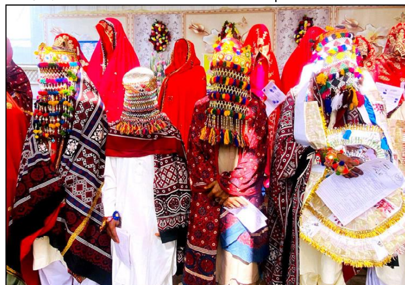
TANDO ADAM: Grooms and brides during a mass marriage ceremony held in a local garden, organized by the Otero Lal Welfare Association. A total of 250 couples participated, including 125 Muslims and 125 Non-Muslims.

While addressing the meeting the newly elected Chairman thanked all the board members.