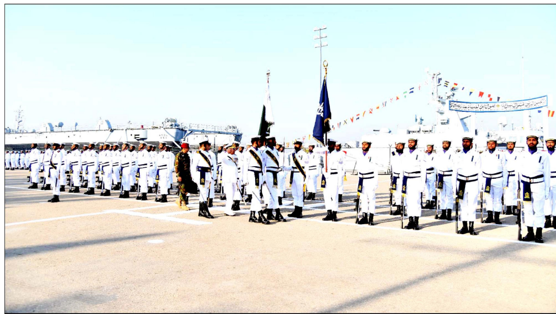
KARACHI: Chief of the Naval Staff, Admiral Naveed Ashraf reviewing the parade during Fleet Efficiency Competition Parade 2023 held at Pakistan Navy Dockyard in Karachi