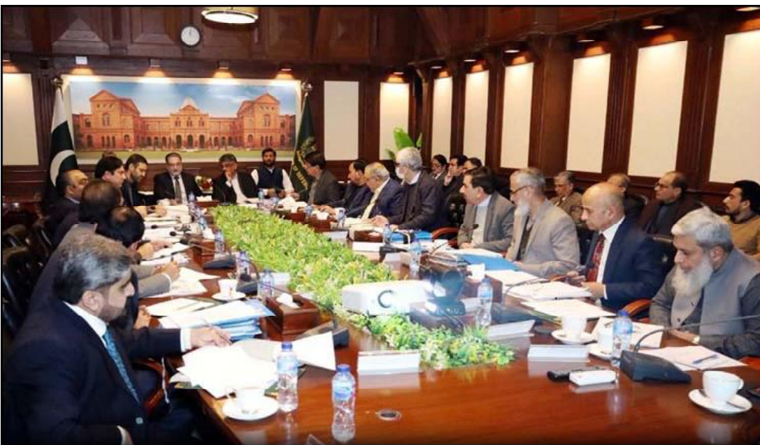
RAWALPINDI: Inter Ministerial Committee on AJ&K being chaired by Minister for Defence, Lt. Gen (Retd) Anwar Ali Hyder co-chaired by Prime Minister Azad Jammu and Kashmir (AJK), Chaudhary Anwar-ul-Haq held at Ministry of Defence in Rawalpindi.