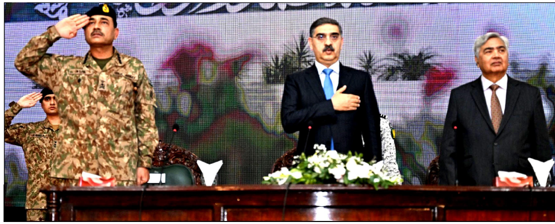
ISLAMABAD: Caretaker Prime Minister Anwaar-ul-Haq Kakar and Chief of the Army Staff, General Syed Asim Munir participating in the National Farmer's Convention

The SSP said that a special campaign would also be launched against underage drivers.